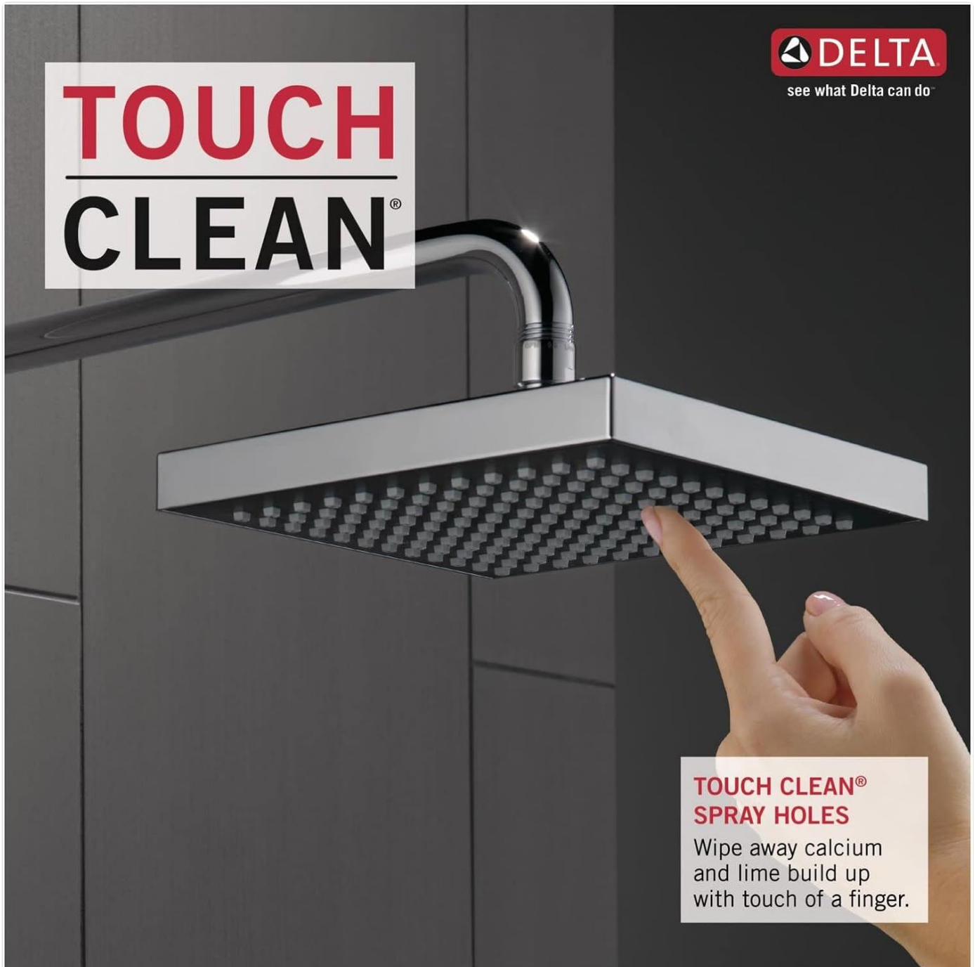
Figure 4.1: Cleaning the Touch-Clean Spray Holes.