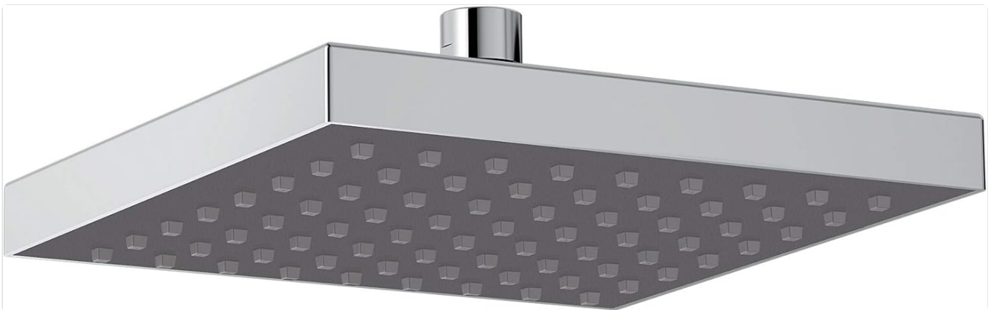
Figure 1.1: Delta Faucet Single-Spray Touch-Clean Rain Shower Head (Chrome finish, bottom view).

Please read this manual thoroughly before installation and use to ensure proper function and to maximize the lifespan of your product. Keep this manual for future reference.