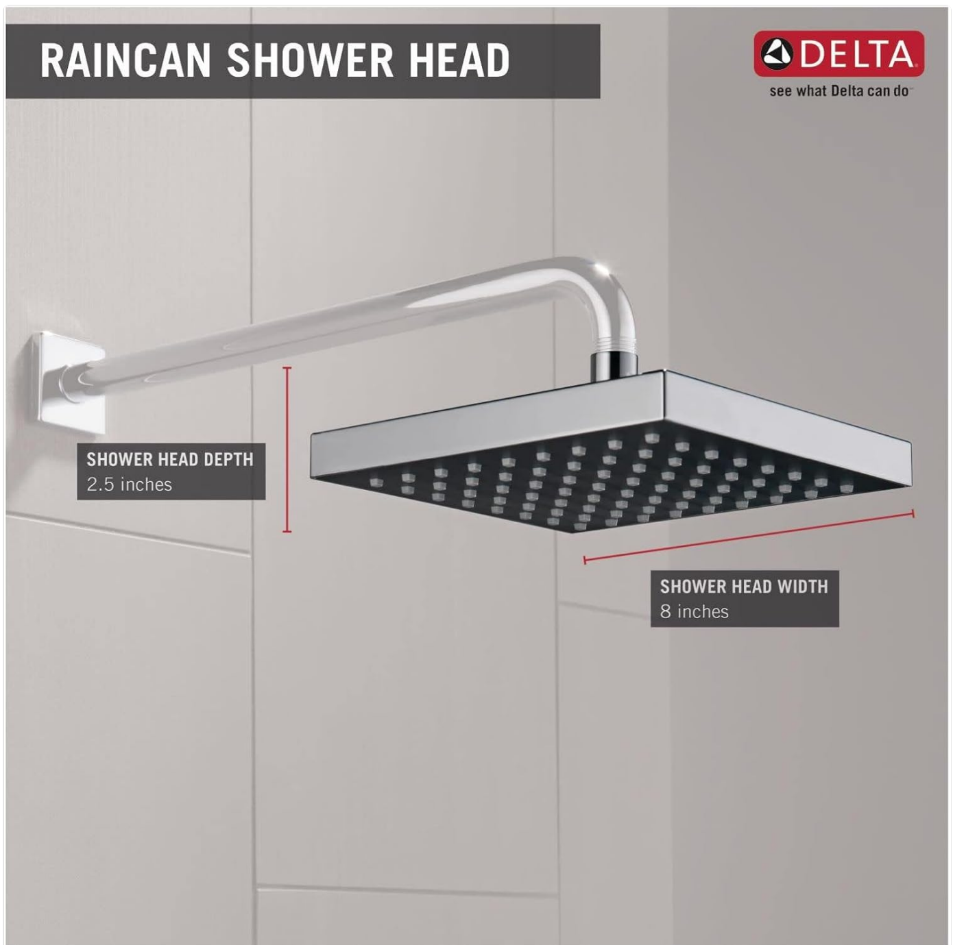
Figure 2.2: Shower Head Dimensions (8" width x 2.5" depth).