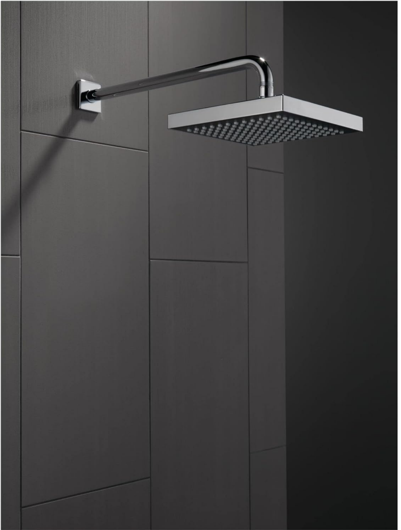
Figure 2.1: Installed Delta Rain Shower Head (Chrome finish).