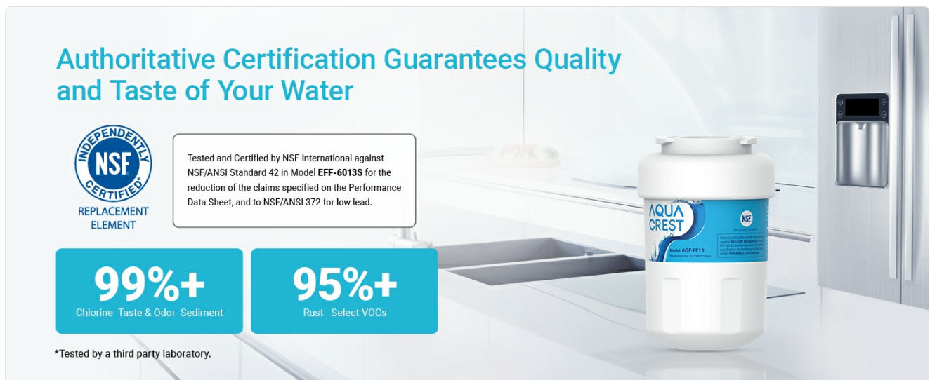
Image 1.1: AQUA CREST filter with NSF 42 and 372 certifications. This image highlights the independent certification of the filter, assuring its performance in reducing contaminants and its lead-free housing.

The AQUA CREST AQF-FF13 refrigerator water filter is designed to provide clean, fresh-tasting water by reducing various impurities. This filter utilizes a 100% superior coconut shell carbon block for effective filtration. It is certified by NSF 42 and 372, ensuring quality and safety standards are met. This manual provides essential information for the proper use and maintenance of your filter.