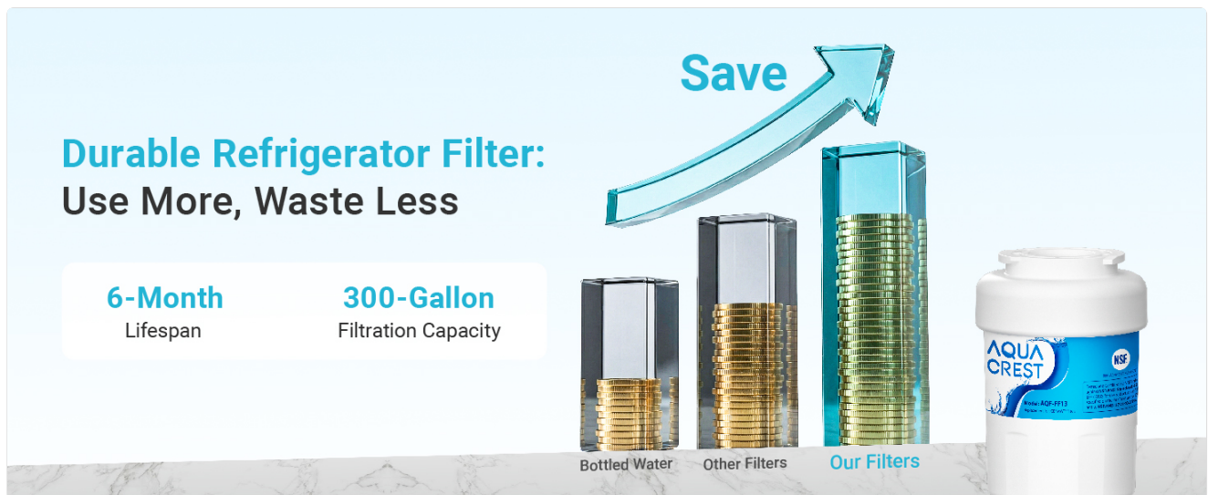
Image 6.1: Durable refrigerator filter with 6-month lifespan and 300-gallon capacity. This image illustrates the recommended replacement schedule for optimal performance and water quality.