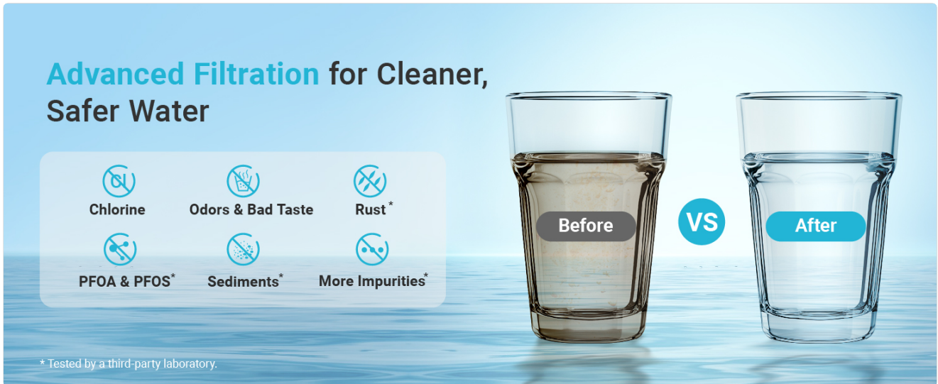
Image 2.1: Visual comparison of unfiltered and filtered water. This image illustrates the filter's capability to provide cleaner, safer water by removing various impurities.