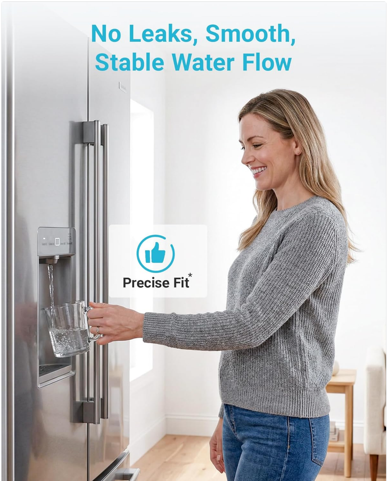
Image 4.2: No leaks, smooth, stable water flow. This image illustrates the precise fit of the filter, ensuring proper function and preventing water leaks.

Video 4.1: AQUA CREST MWF Refrigerator Water Filter Installation. This video demonstrates the process of installing the AQUA CREST MWF replacement filter, ensuring a smooth and leak-free setup.