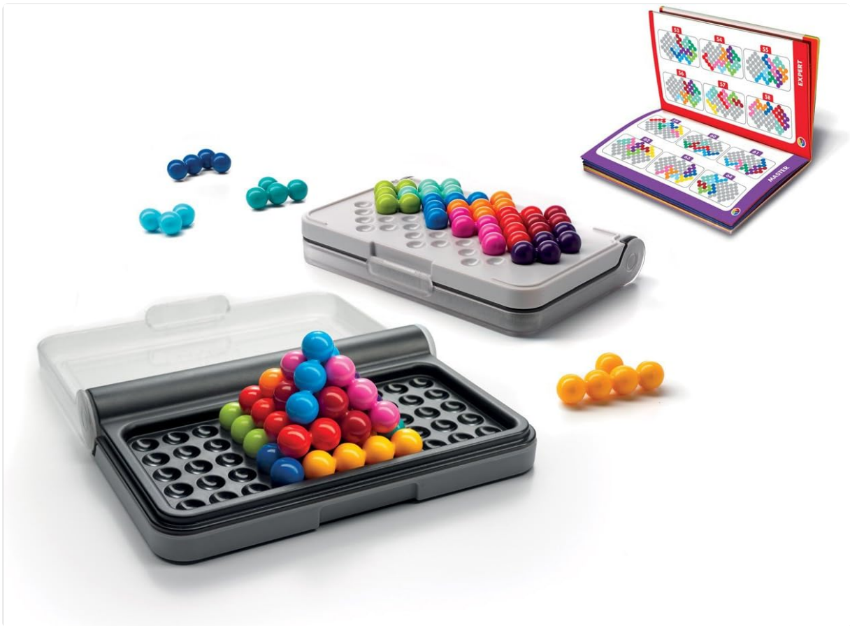
Image: All components of the SmartGames IQ Puzzler Pro, including the game board, puzzle pieces, and challenge booklet.