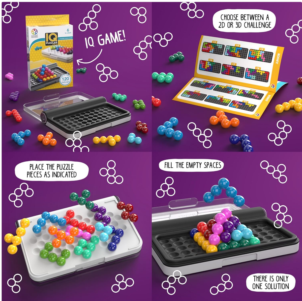
Image: Infographic detailing the steps to play IQ Puzzler Pro, from selecting a challenge to finding the unique solution.