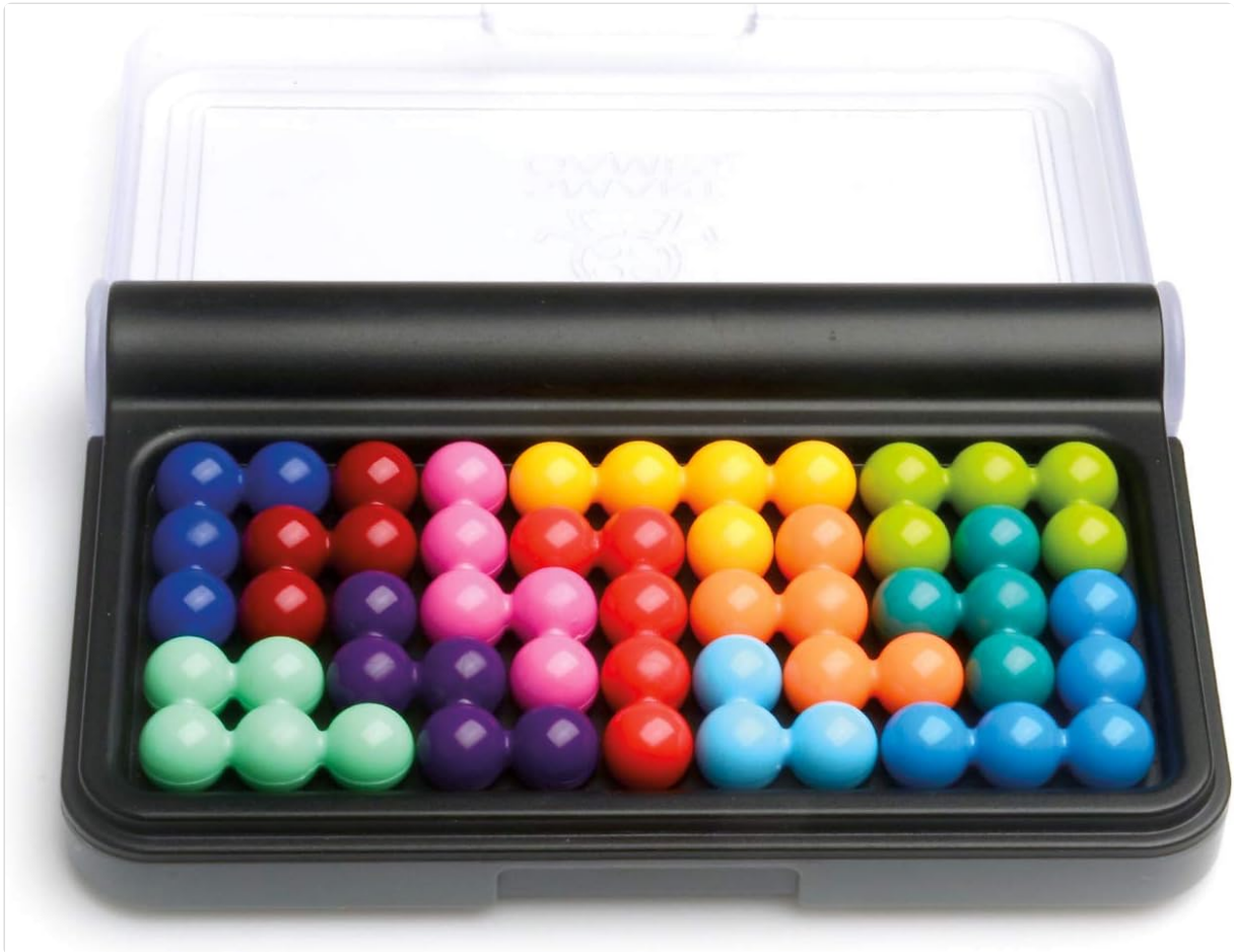
Image: Colorful puzzle pieces arranged flat on the game board for a 2D challenge.

For 2D challenges, use the flat grid side of the game board. The challenges will indicate which pieces to use and their initial placement. Your task is to fit the remaining pieces onto the grid to complete the pattern.