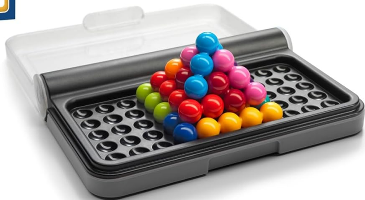
Image: SmartGames IQ Puzzler Pro game box and open game board with a colorful pyramid of puzzle pieces.