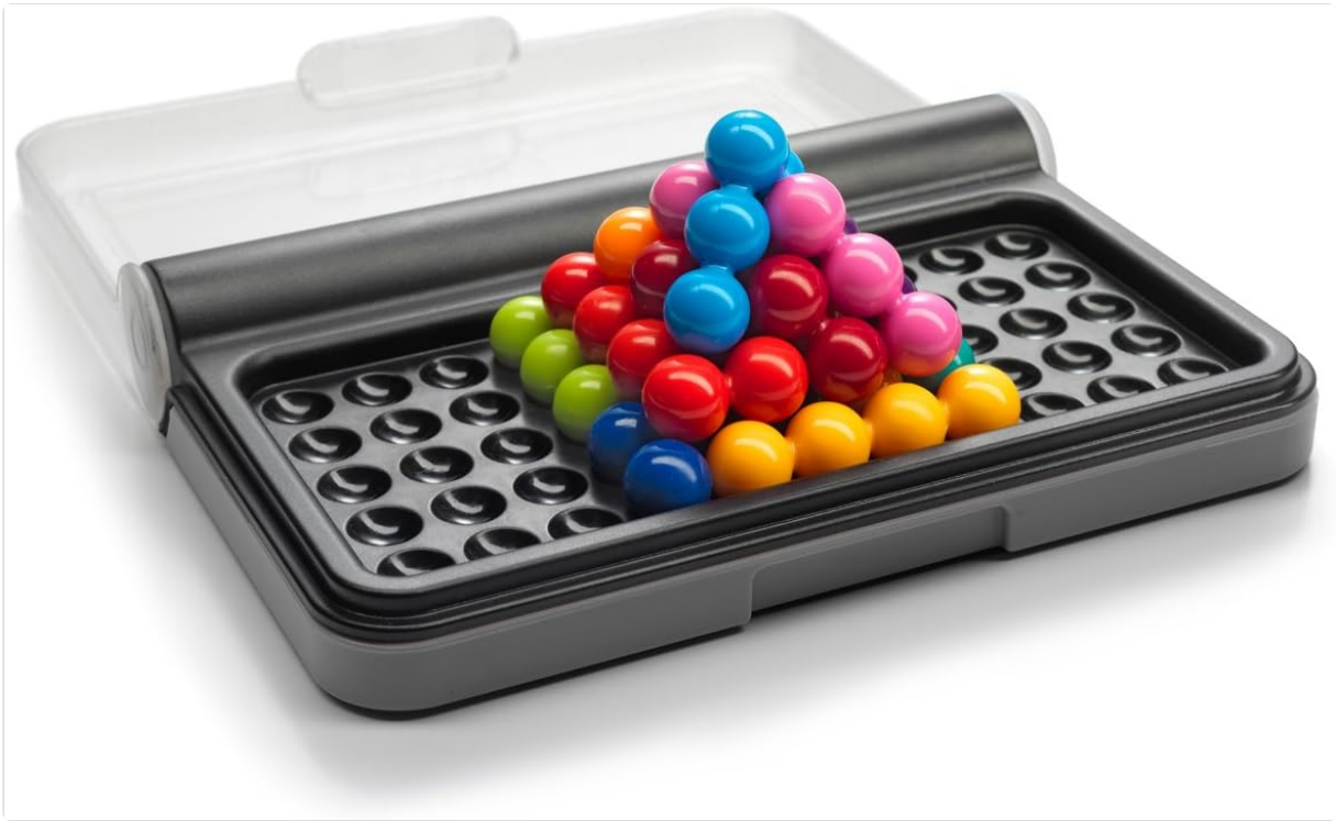
Image: Colorful puzzle pieces forming the base of a pyramid on the game board for a 3D challenge.