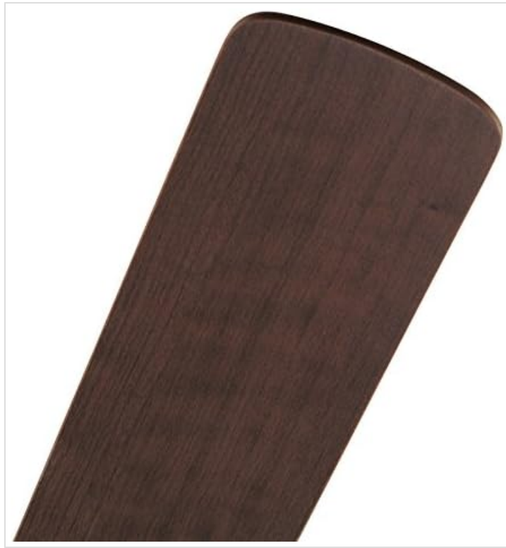
Figure 4: Close-up view of a fan blade, highlighting the bronze finish.