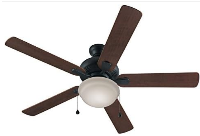
Figure 1: Overview of the Harbor Breeze Caratuk River 52-inch Ceiling Fan.

The Harbor Breeze Caratuk River 52-inch Bronze Downrod or Flush Mount Indoor Ceiling Fan with Light Kit is designed to provide efficient air circulation and illumination for various indoor spaces such as living rooms, bedrooms, and home offices. This fan features a durable bronze finish, five reversible blades, and a convenient pull chain control system for both the fan and light functions. It also includes a reversible motor for optimal performance in both summer and winter seasons.