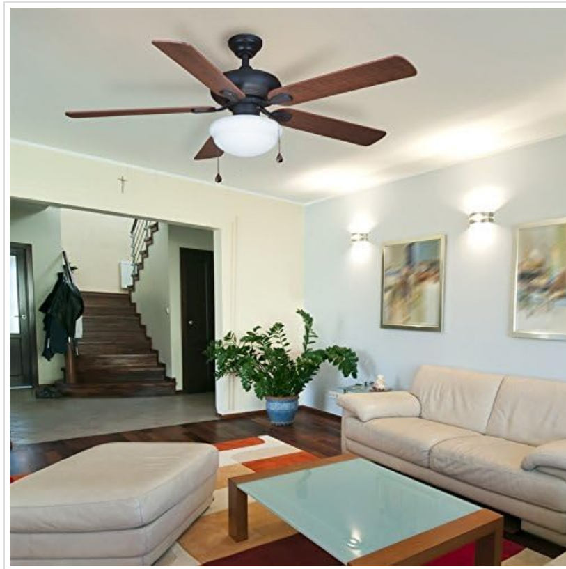
Figure 2: The ceiling fan installed in a living room, demonstrating its aesthetic integration.

Note: While an instructional video was reviewed, it was created by an influencer and not the seller. For detailed installation steps, please refer to the comprehensive guide included in your product packaging.