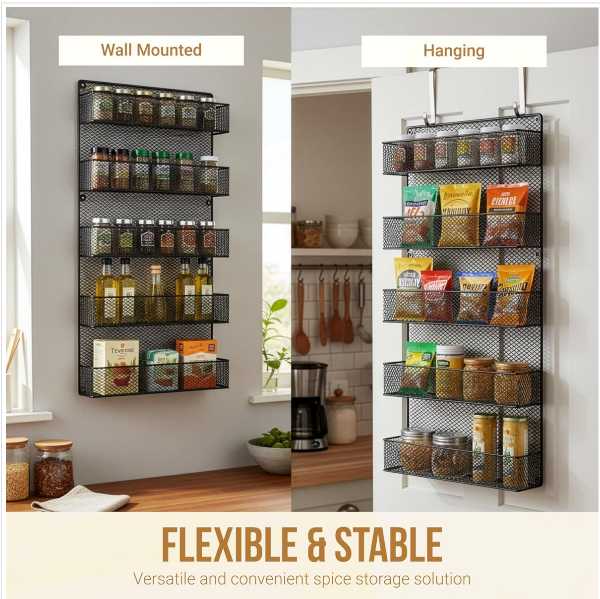
Figure 2: Installation options: wall-mounted or over-the-door (over-the-door hooks not included).