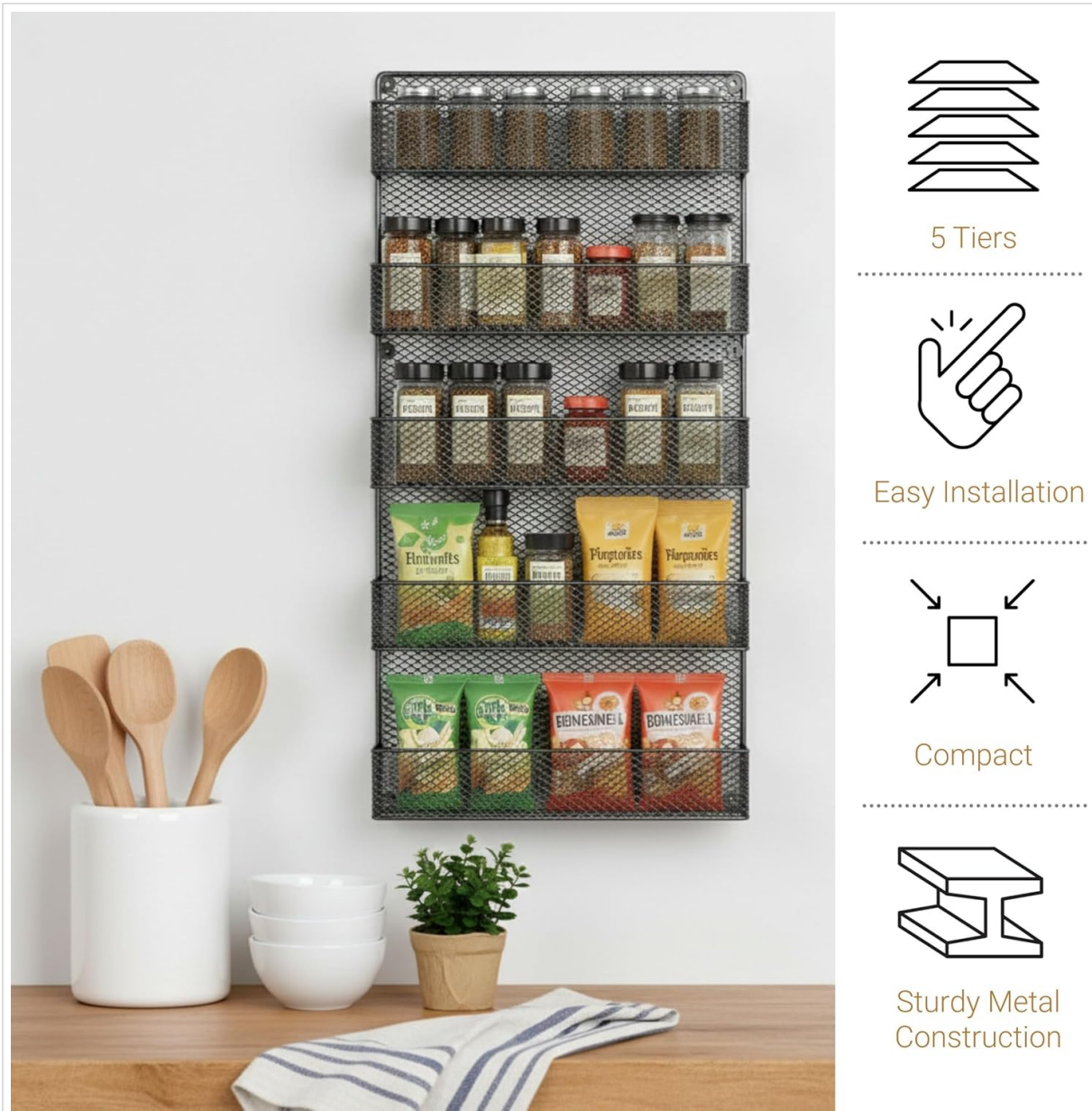
Figure 1: The 5-Tier Spice Rack Organizer installed and filled with spices.

Note: If mounting to drywall without studs, use appropriate drywall anchors (not included) for added stability. If mounting to a cabinet door, ensure screws do not penetrate through to the other side of the door.