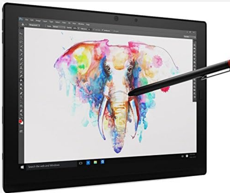
Figure 3: Using the Active Pen for creative tasks on the ThinkPad X1 Tablet.

The Active Pen allows for precise input on the touchscreen. It can be used for writing, drawing, and navigating the interface. Ensure the pen has a charged battery if applicable (refer to pen-specific instructions for battery replacement).