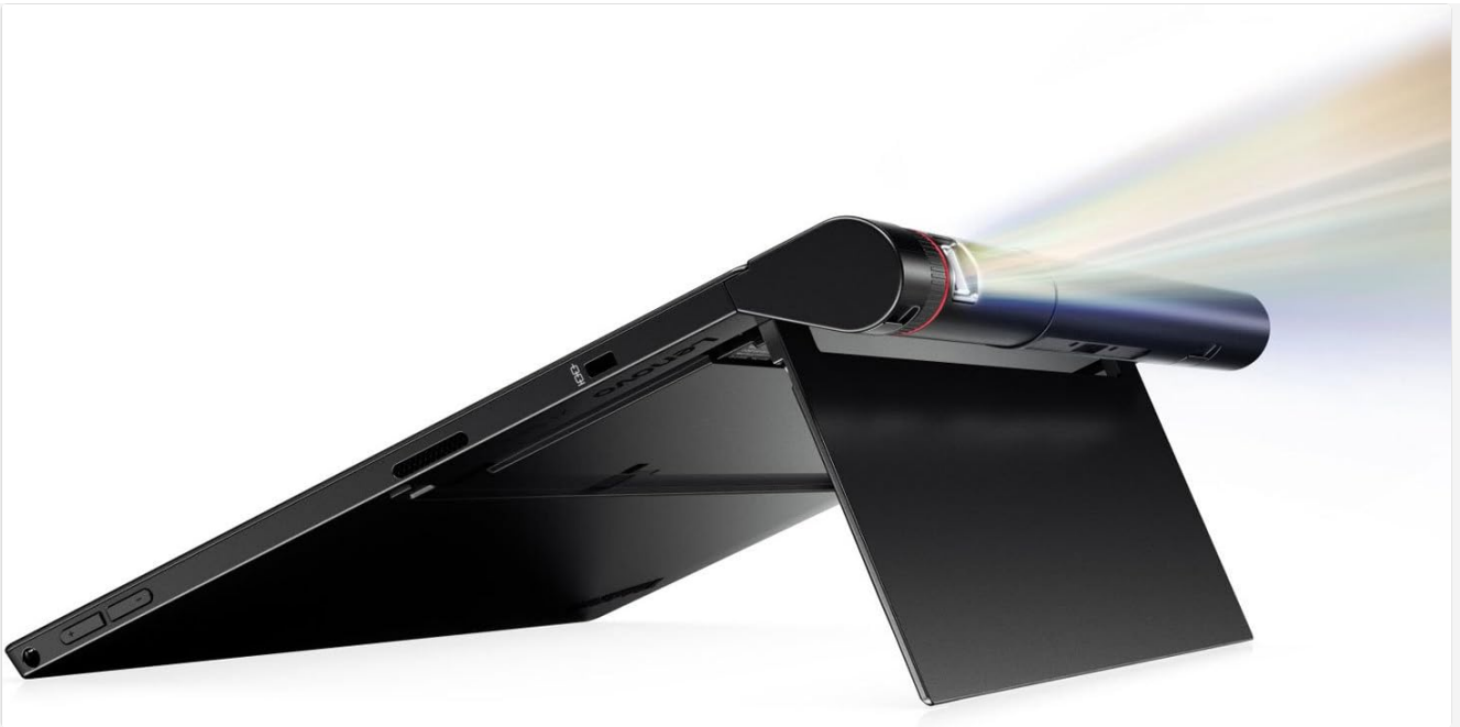
Figure 4: ThinkPad X1 Tablet with the optional Presenter Module, featuring an integrated projector.