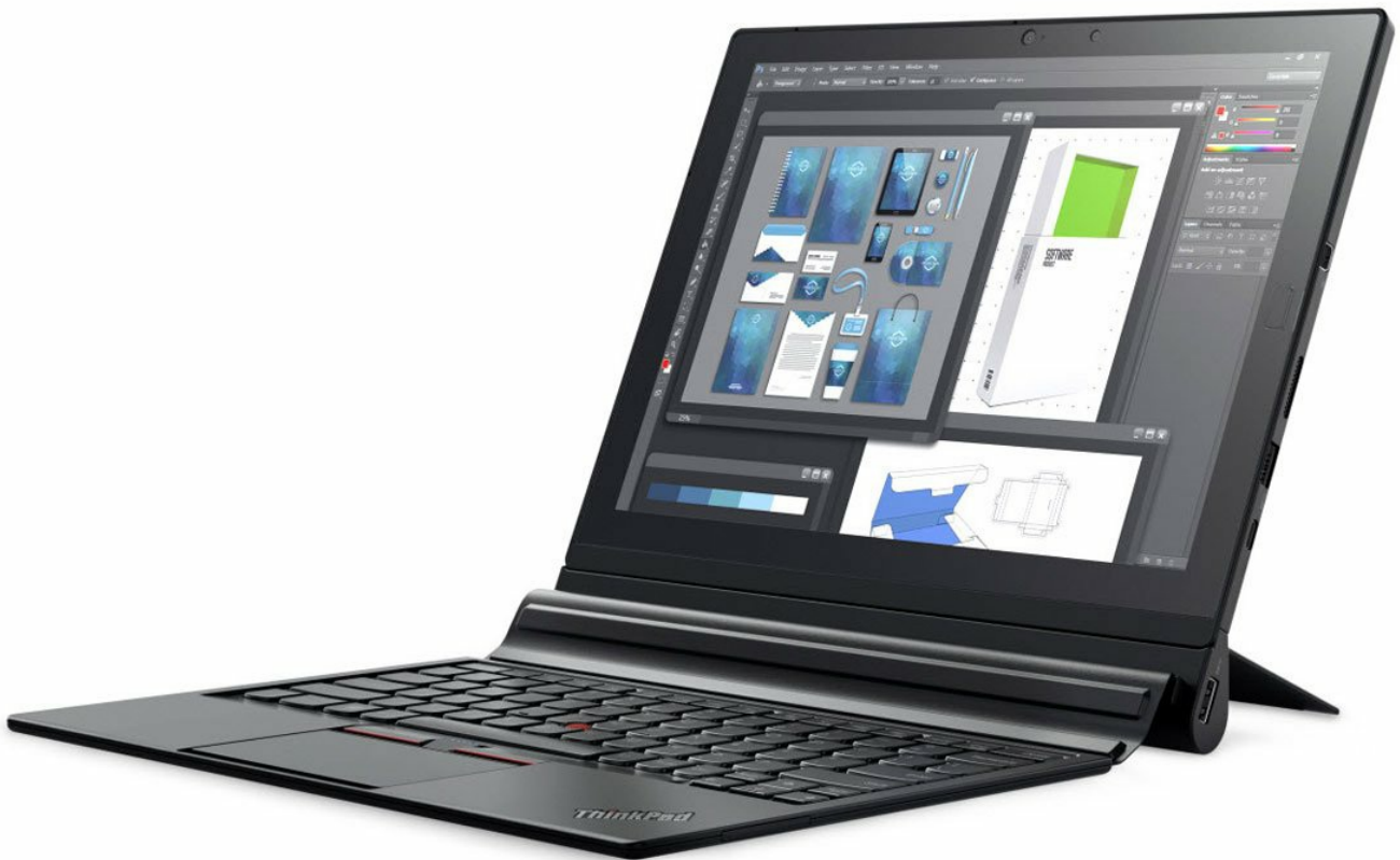
Figure 1: Lenovo ThinkPad X1 Tablet in use for a video conference.