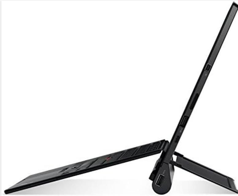
Figure 2: Side view of the ThinkPad X1 Tablet with the detachable keyboard connected.