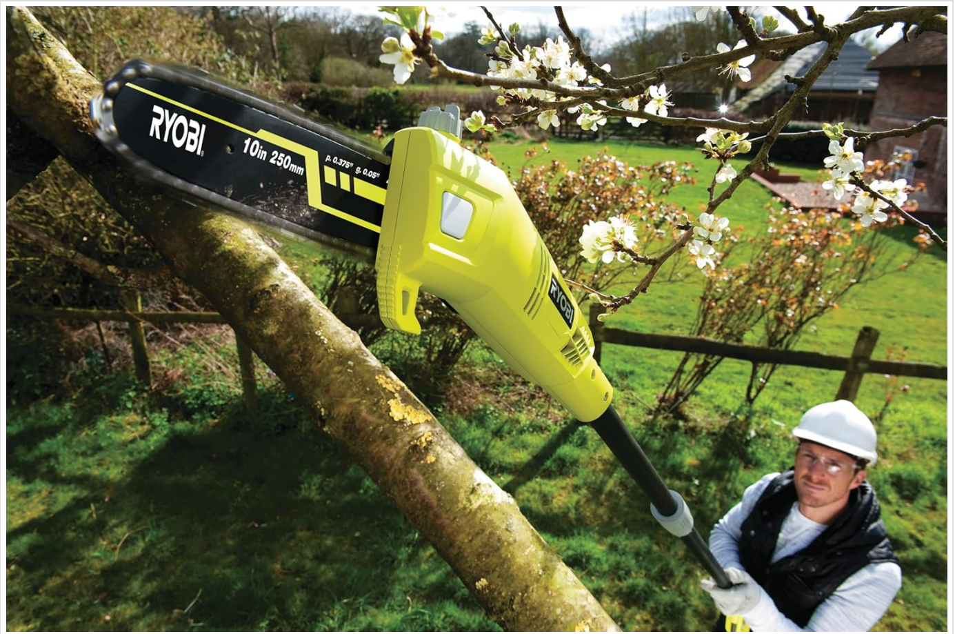
Figure 3.1: A user safely operating the RYOBI RPP755E Pole Pruner to trim a high branch, wearing appropriate safety gear.