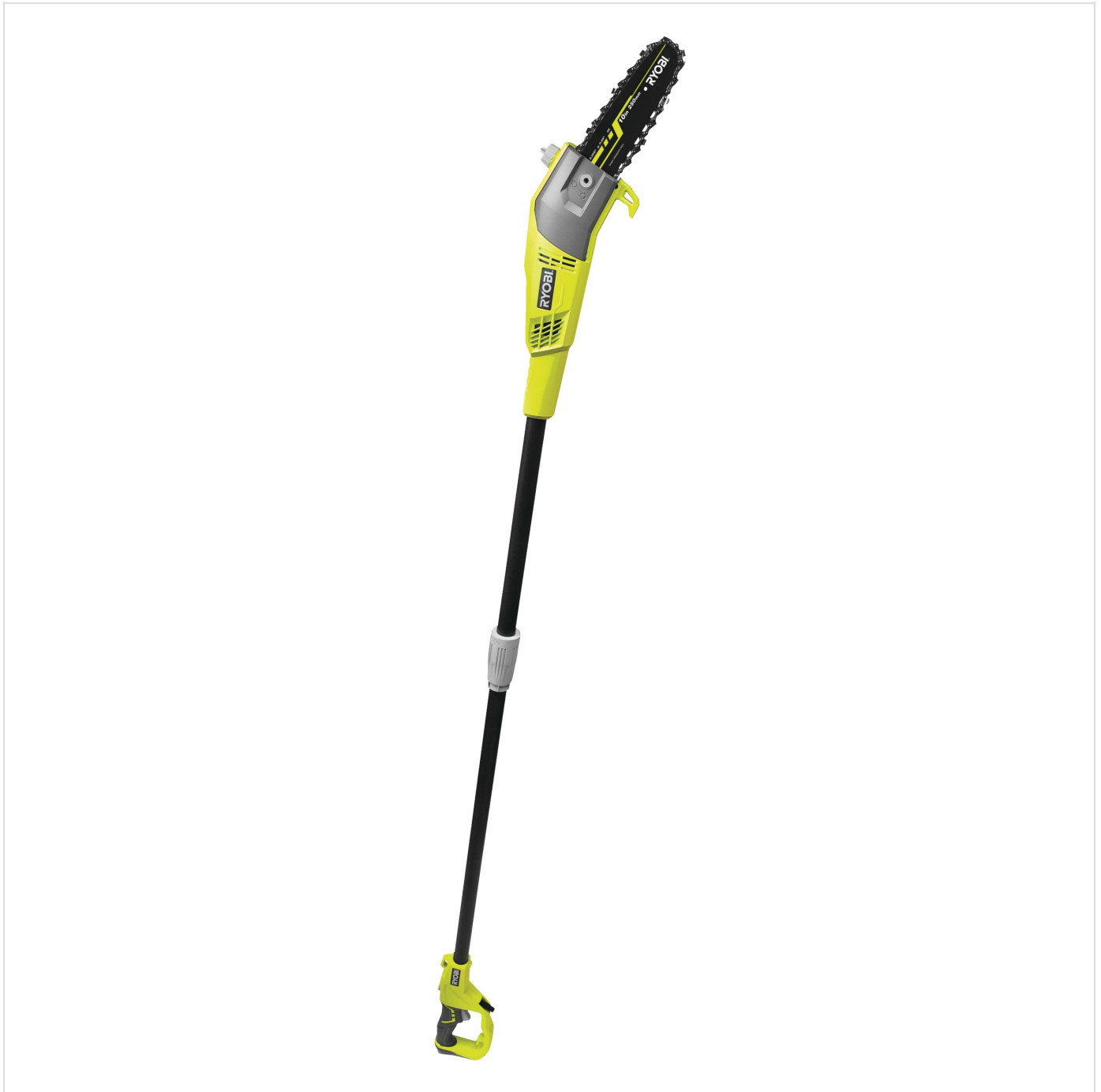
Figure 2.1: Main unit of the RYOBI RPP755E Electric Pole Pruner.