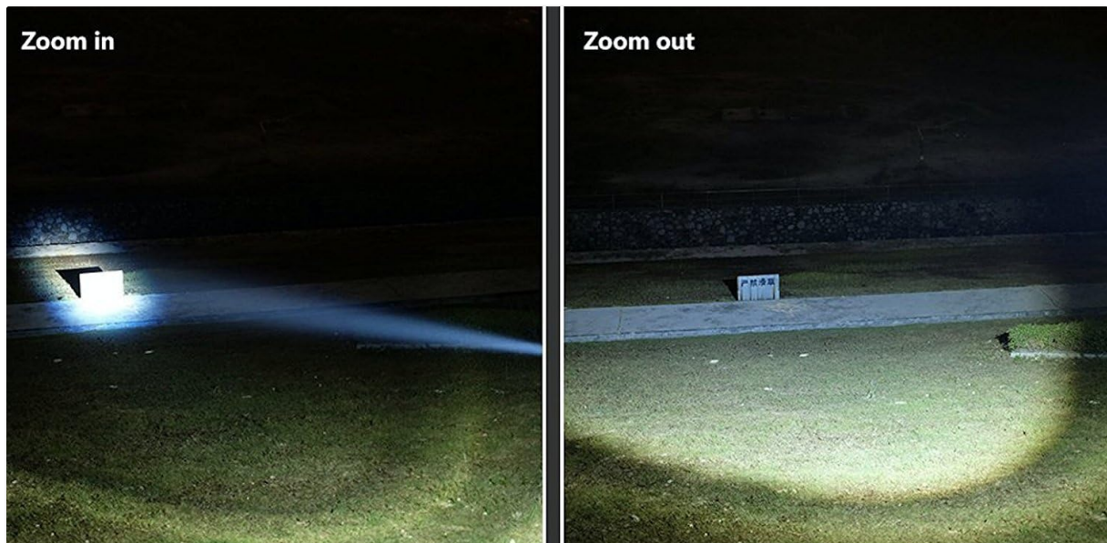
Image: A side-by-side comparison demonstrating the effect of the adjustable focus, showing a narrow, intense beam when "Zoom in" is applied and a wide, diffused beam when "Zoom out" is applied, illuminating different areas.