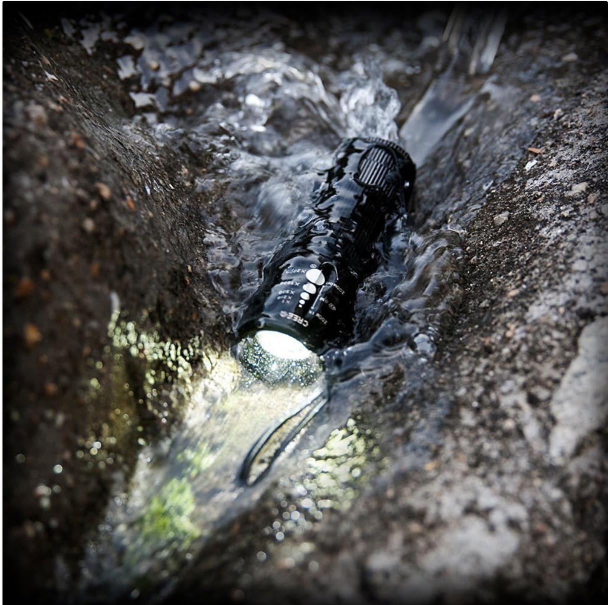
Image: The NAVIGATOR 1193 flashlight is shown partially submerged in flowing water, demonstrating its water-resistant capabilities.

The NAVIGATOR 1193 is designed to be water resistant against splashing water and can be used in heavy rain. However, it is not intended for submersion. Ensure the tail cap is securely tightened to maintain water resistance.