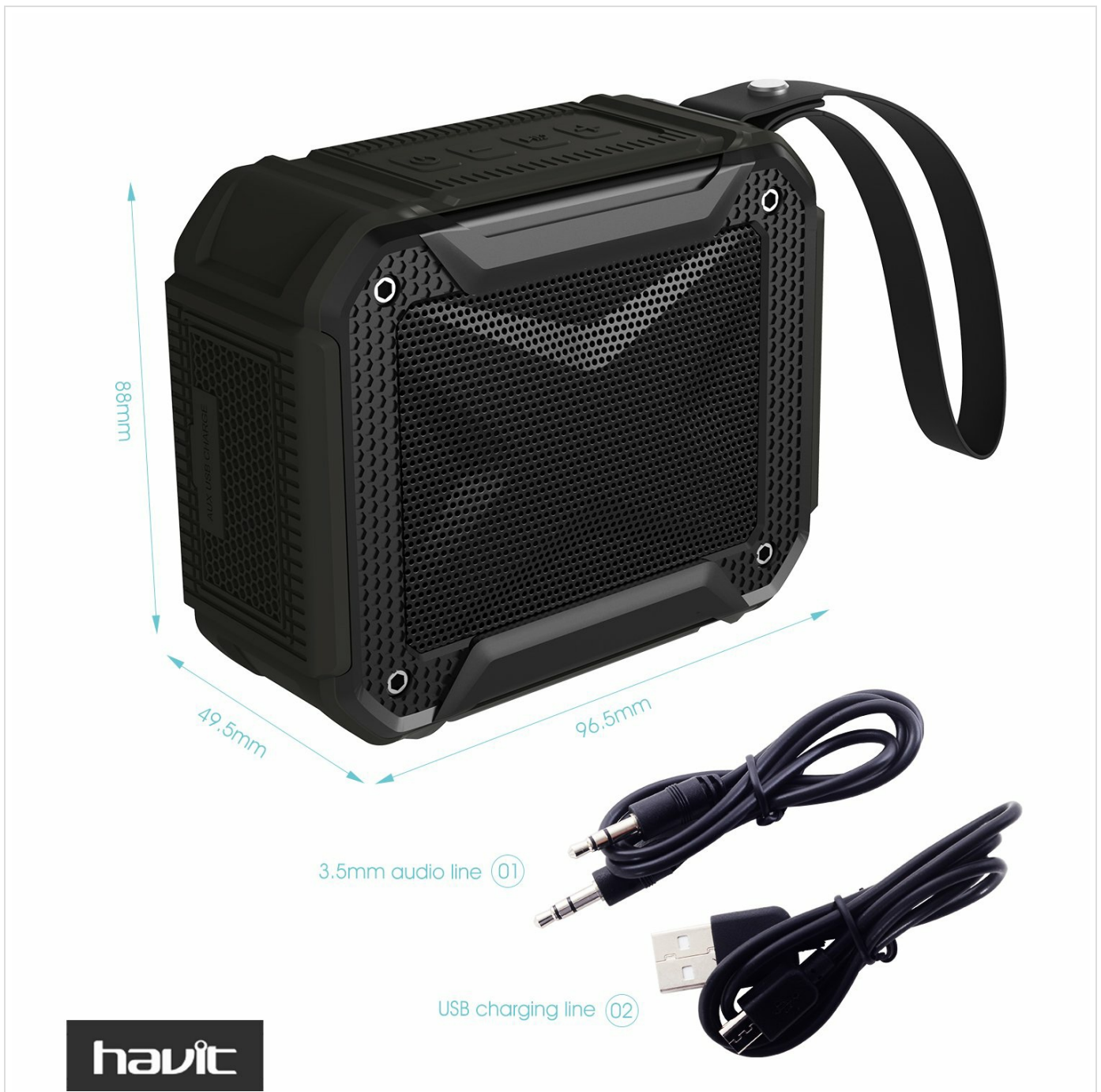
Figure 4: The speaker comes with a 3.5mm audio cable and a USB charging cable for versatile connectivity and power options.