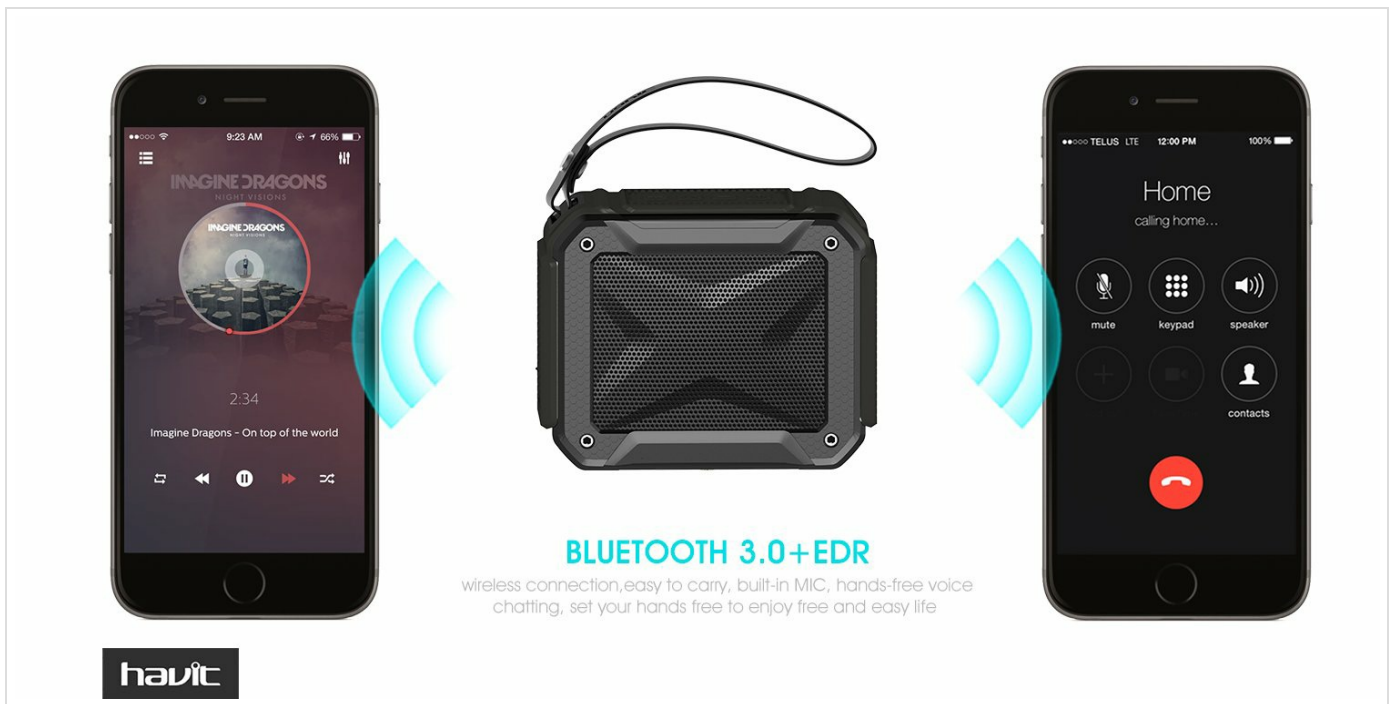
Figure 7: The speaker supports hands-free calling via Bluetooth, allowing you to answer or make calls directly through the speaker.