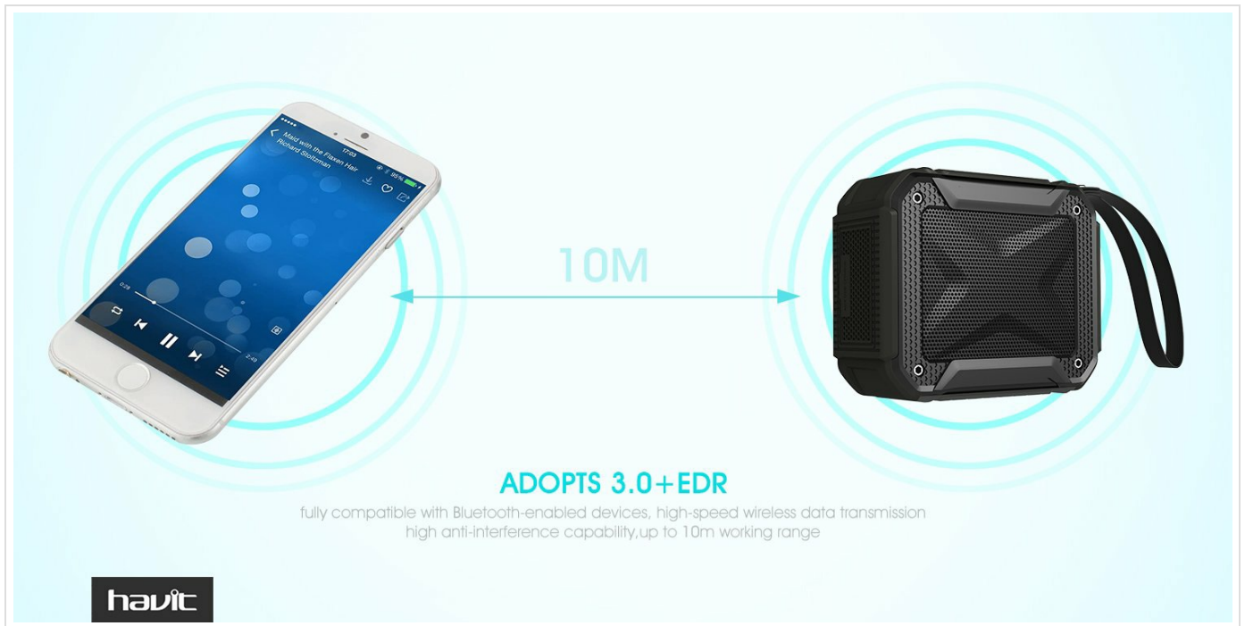
Figure 5: The speaker offers a stable Bluetooth connection up to 10 meters (32 feet) for wireless audio streaming.