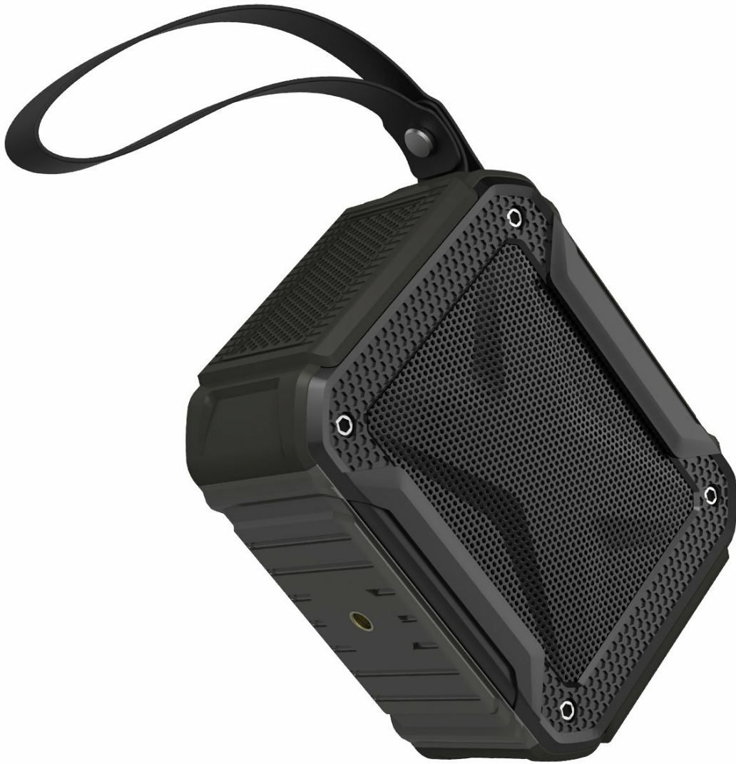
Figure 1: HAVIT HV-SK533BT Portable Wireless Bluetooth Speaker.