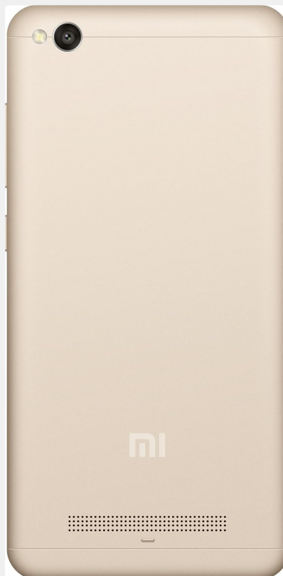
Figure 2: Back view of the MI Redmi 4A. This image highlights the gold-colored plastic back panel, the rear camera lens and flash located in the top left corner, and the MI logo centrally placed towards the bottom. Speaker grilles are visible at the very bottom.