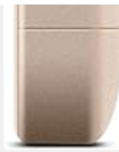
Figure 3: Right side view of the MI Redmi 4A. This image shows the elongated volume rocker button and the power button located below it on the right edge of the device.