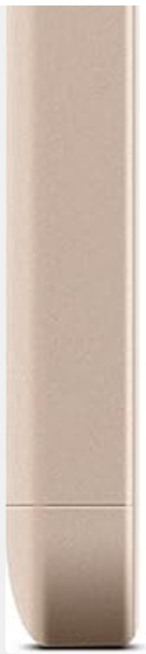
Figure 4: Left side view of the MI Redmi 4A. This image displays the SIM card and microSD card tray slot on the left edge of the device.