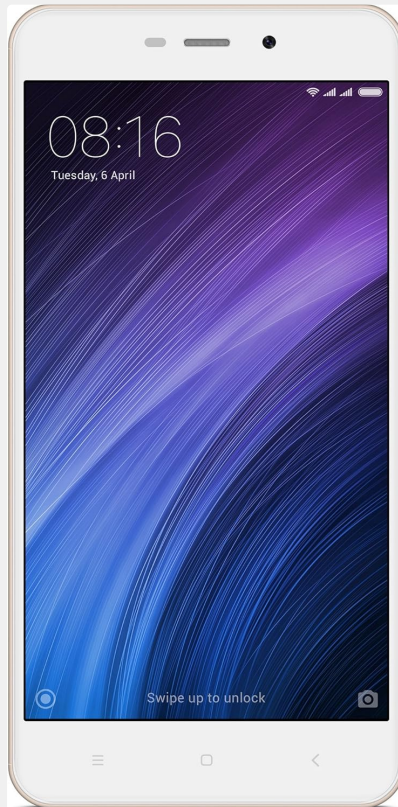
Figure 1: Front view of the MI Redmi 4A. This image displays the phone's screen, which shows the time 08:16 and the date Tuesday, 6 April. Below the screen are the capacitive navigation buttons. The earpiece and front camera are visible above the screen.