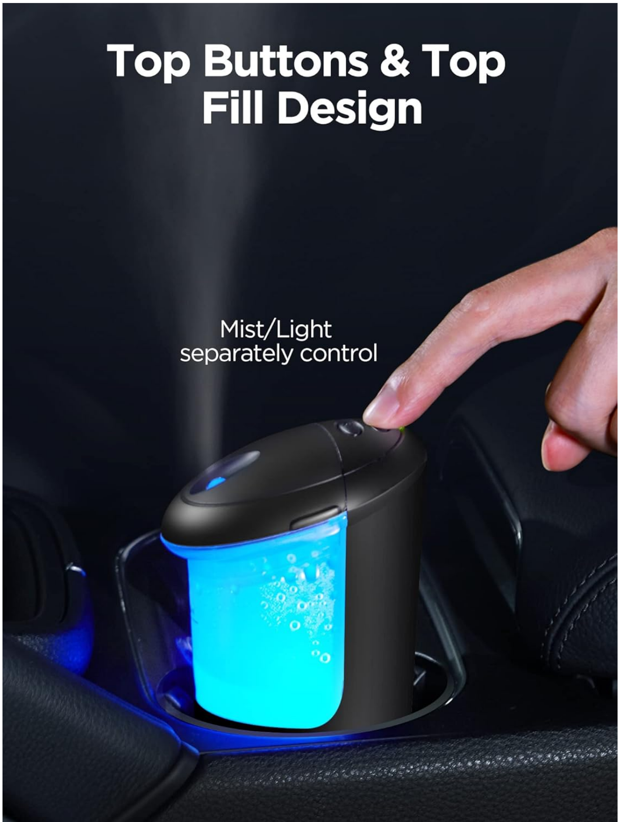
Image: A hand demonstrating how to press the top-mounted buttons for mist and light control.