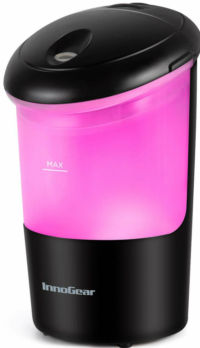
Image: The InnoGear Car Diffuser in black, emitting a pink glow.