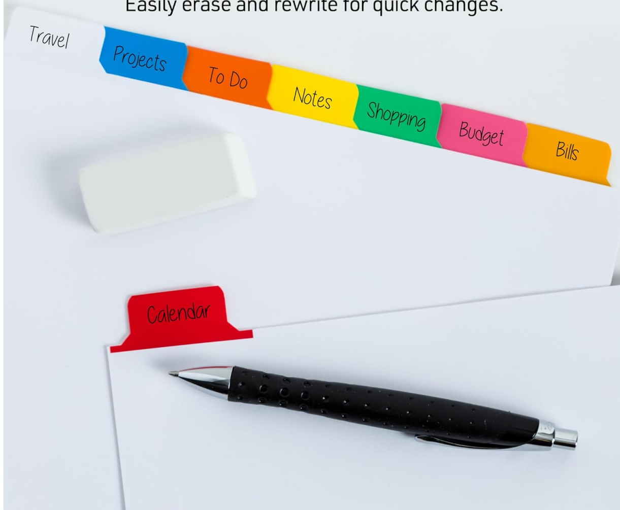
Figure 5: Demonstrating the erase and rewrite capability of the tabs.

Write directly on tabs with ballpoint pen or pencil. Easily erase and rewrite for quick changes.