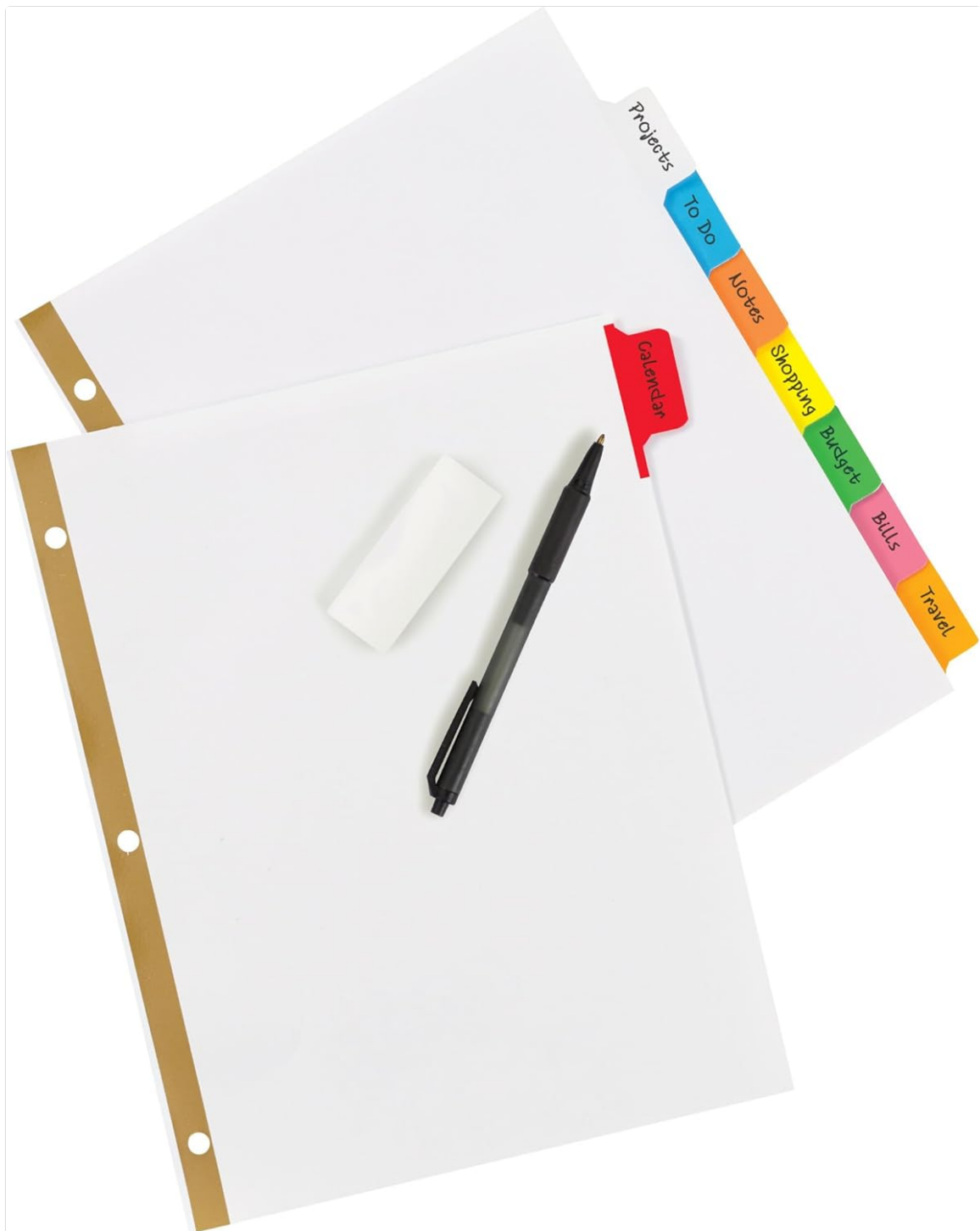
Figure 4: Dividers with writing tools, demonstrating the write-on feature.