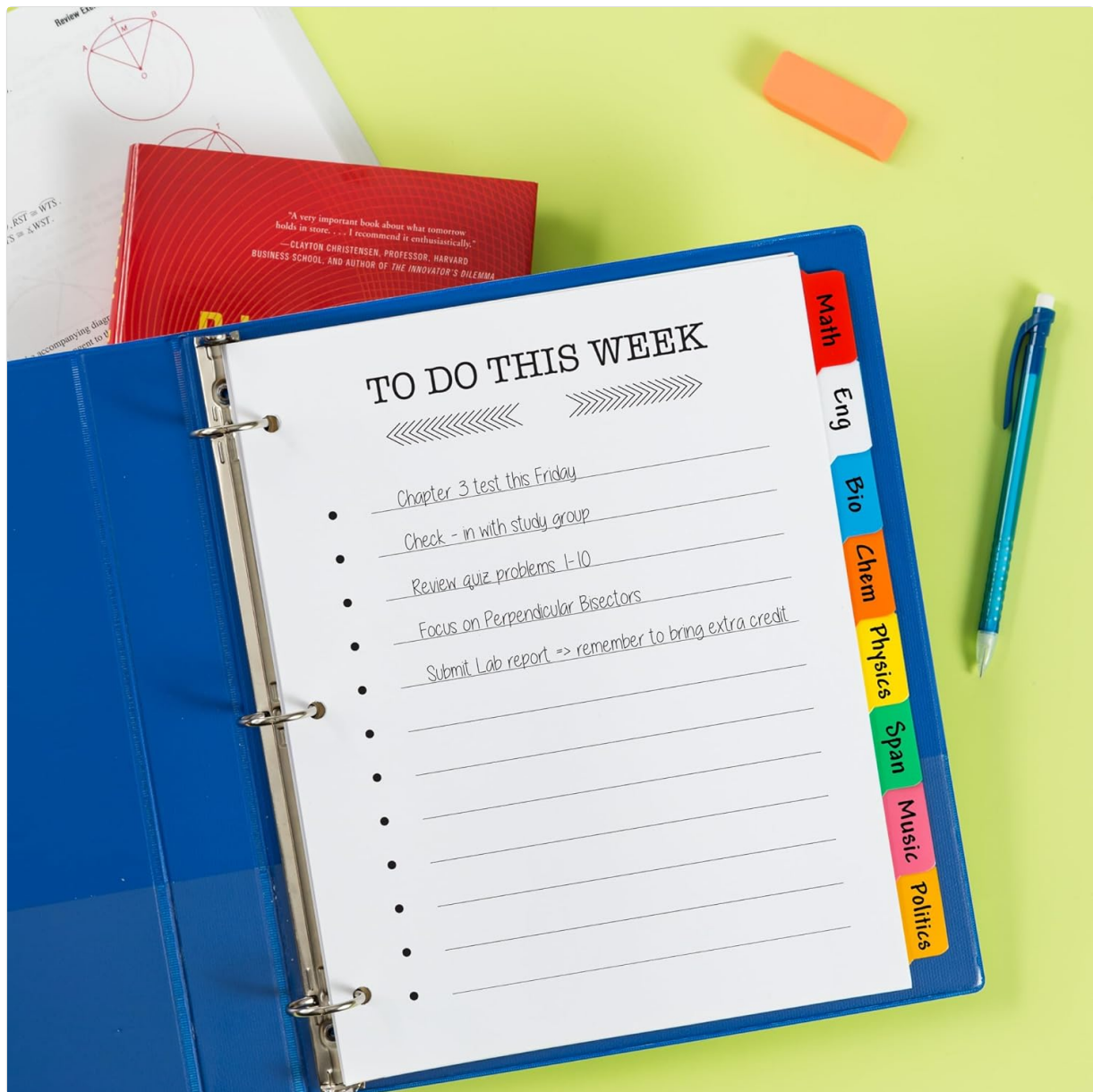
Figure 6: Example of organized documents within a binder using the dividers.