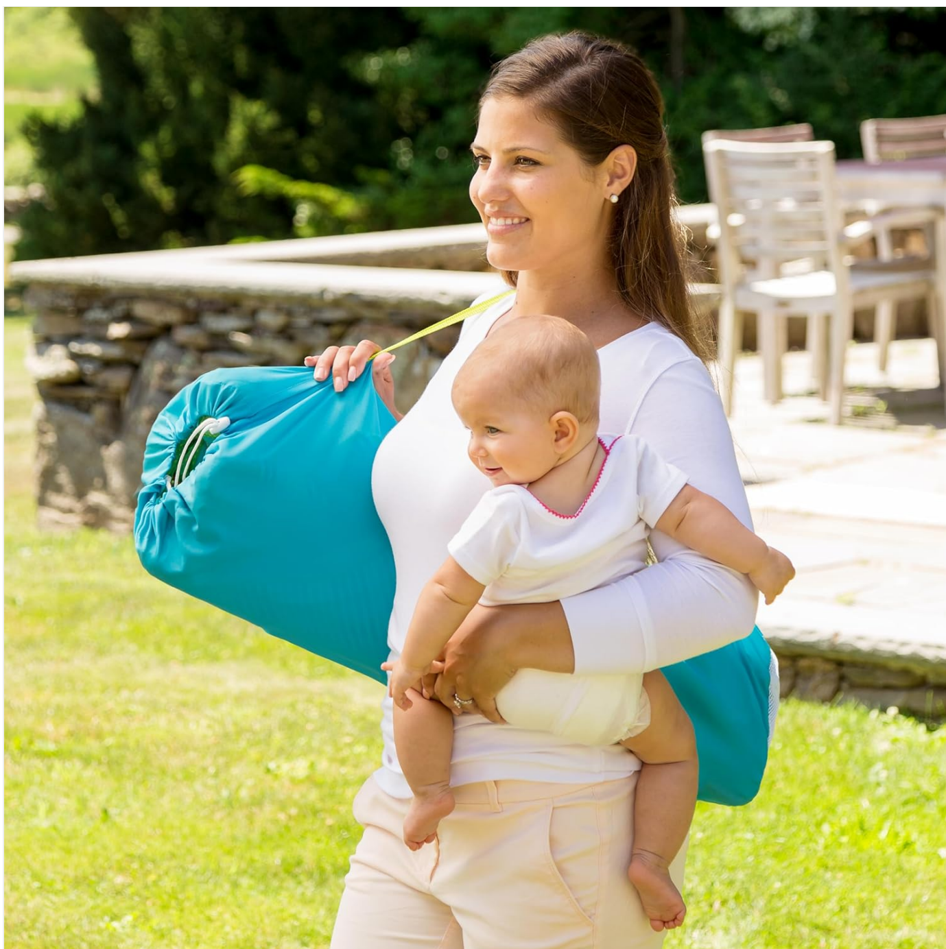
Figure 7: Transporting the activity center in its carrying bag.