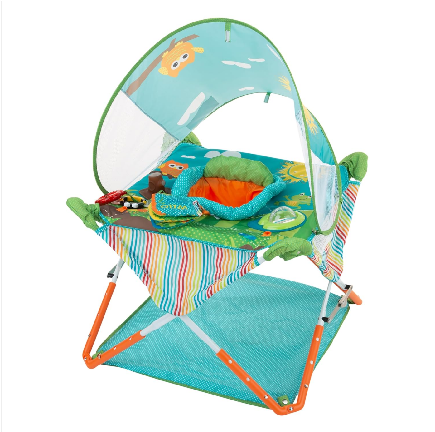
Figure 1: Fully assembled Bright Starts Pop 'N Jump SE Activity Center.