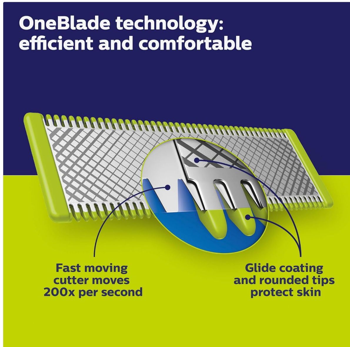
Image 4.1: Visual representation of the OneBlade's capabilities: Trim, Edge, and Shave.

The Philips OneBlade is designed for trimming, edging, and shaving facial hair. It can be used dry or wet, with or without shaving foam, and is showerproof.