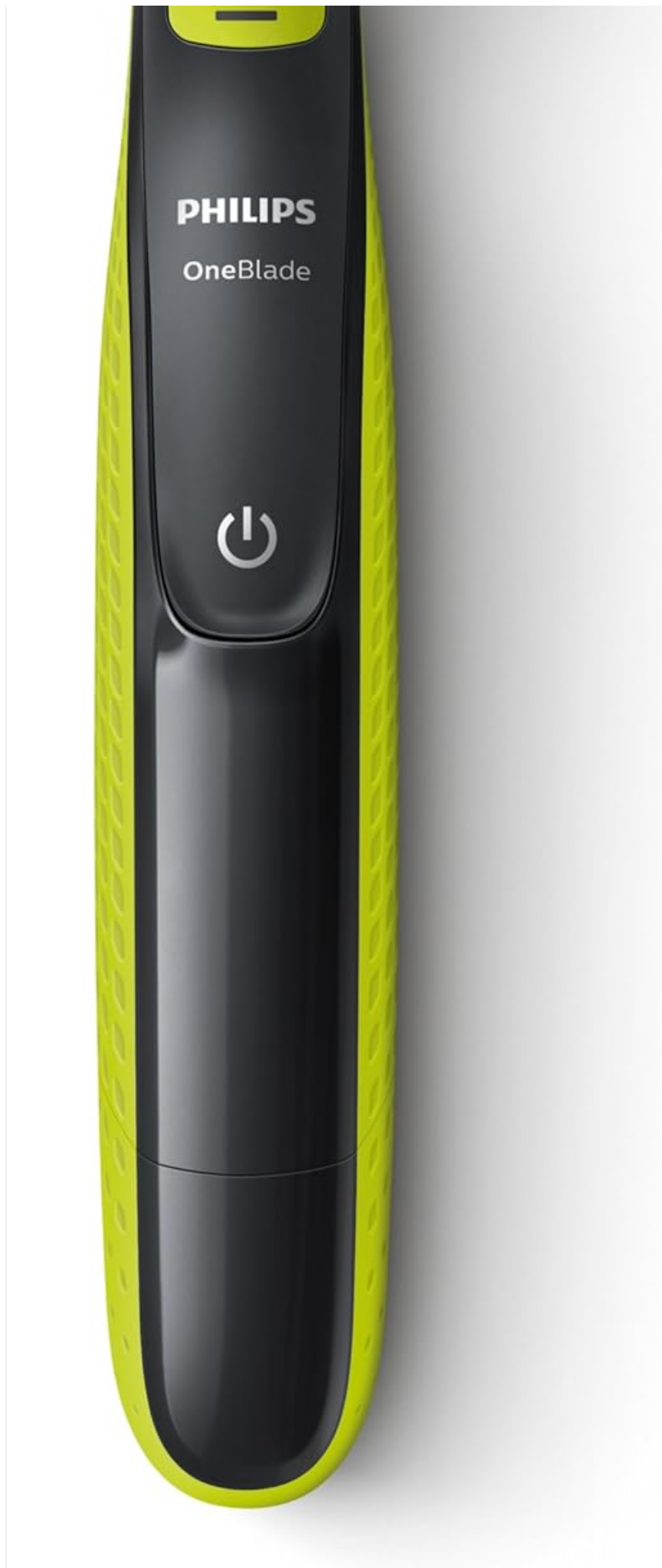
Image 3.2: The Philips OneBlade with various stubble combs, demonstrating how they attach to the blade for different trimming lengths.