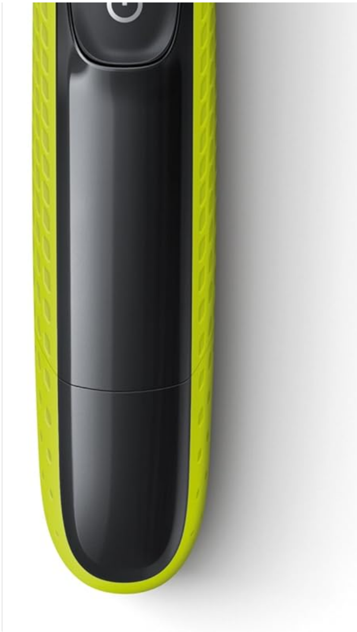
Image 3.1: The charging port of the Philips OneBlade, illustrating where to connect the power adapter.