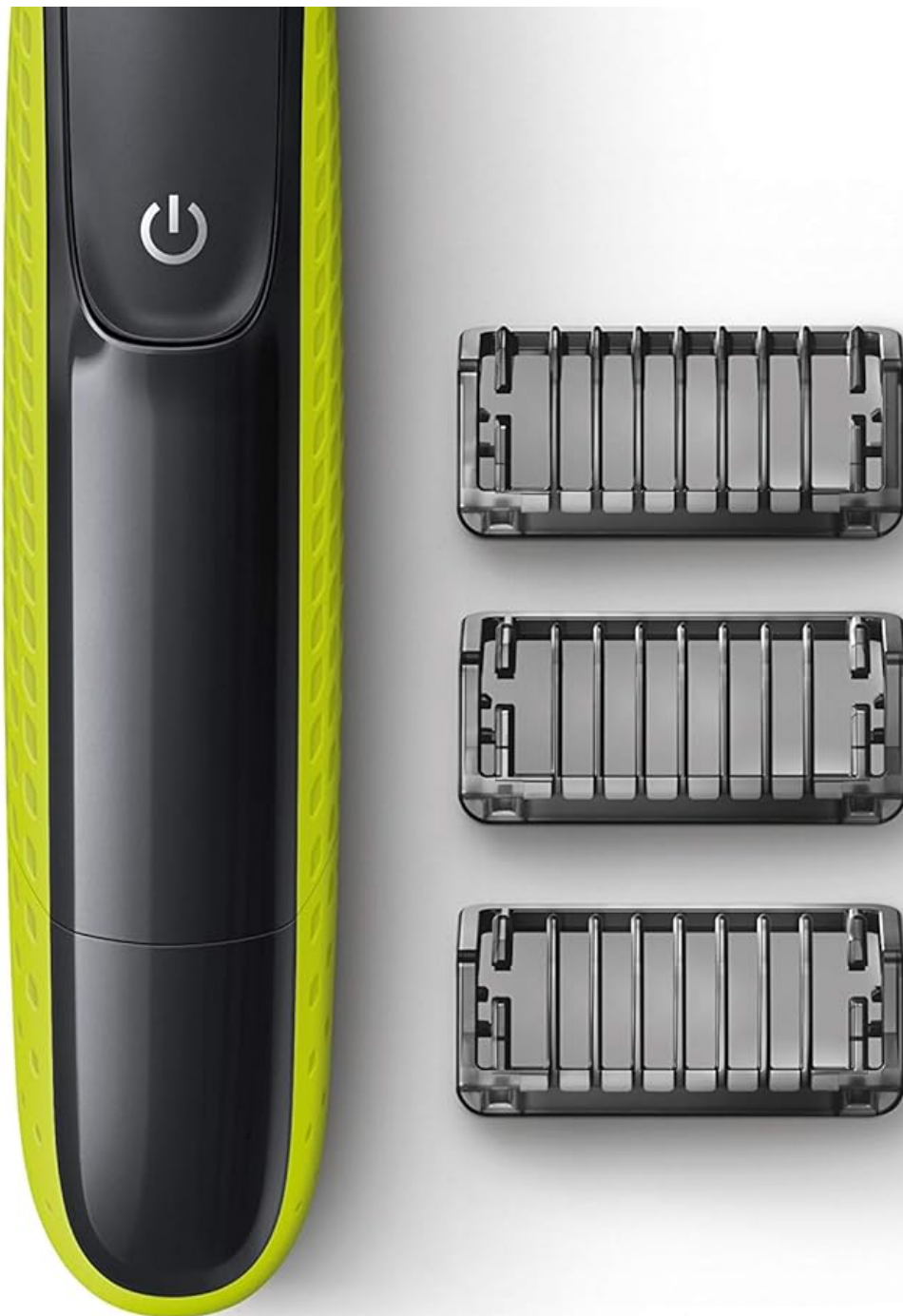
Image 1.1: The Philips OneBlade QP2520 device, showcasing its main unit and included stubble combs.