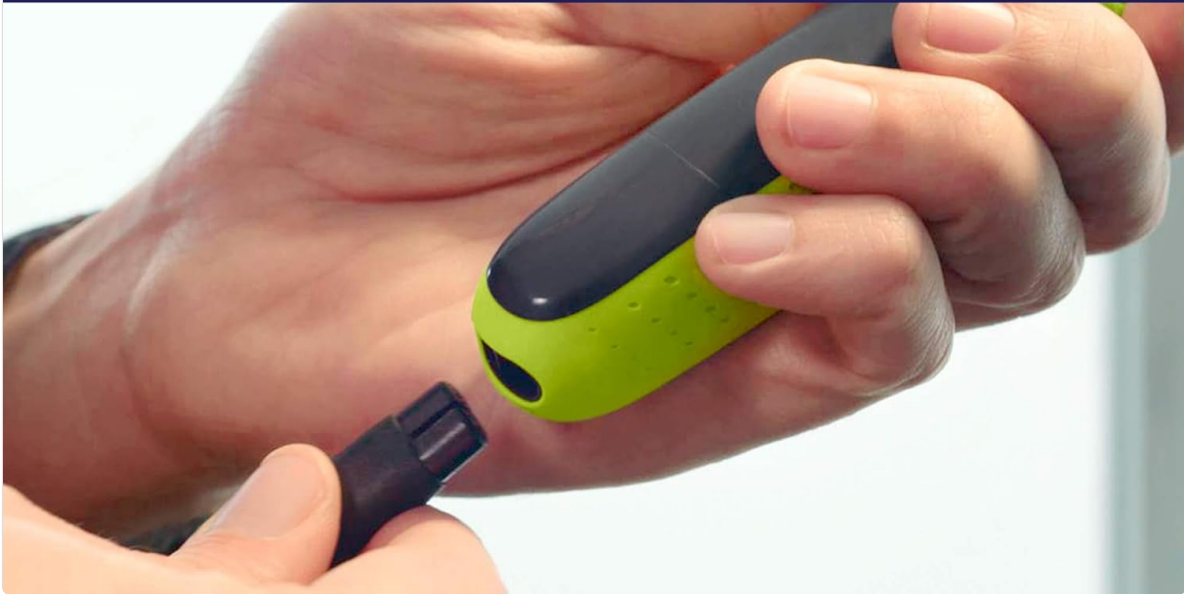
Image 4.3: Illustrates the flexibility of the OneBlade for wet or dry shaving, highlighting its showerproof design.