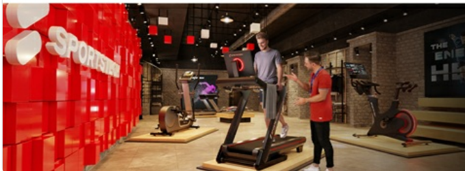
Image: Visual guide indicating video assembly instructions for the Sportstech ESX500 Exercise Bike.