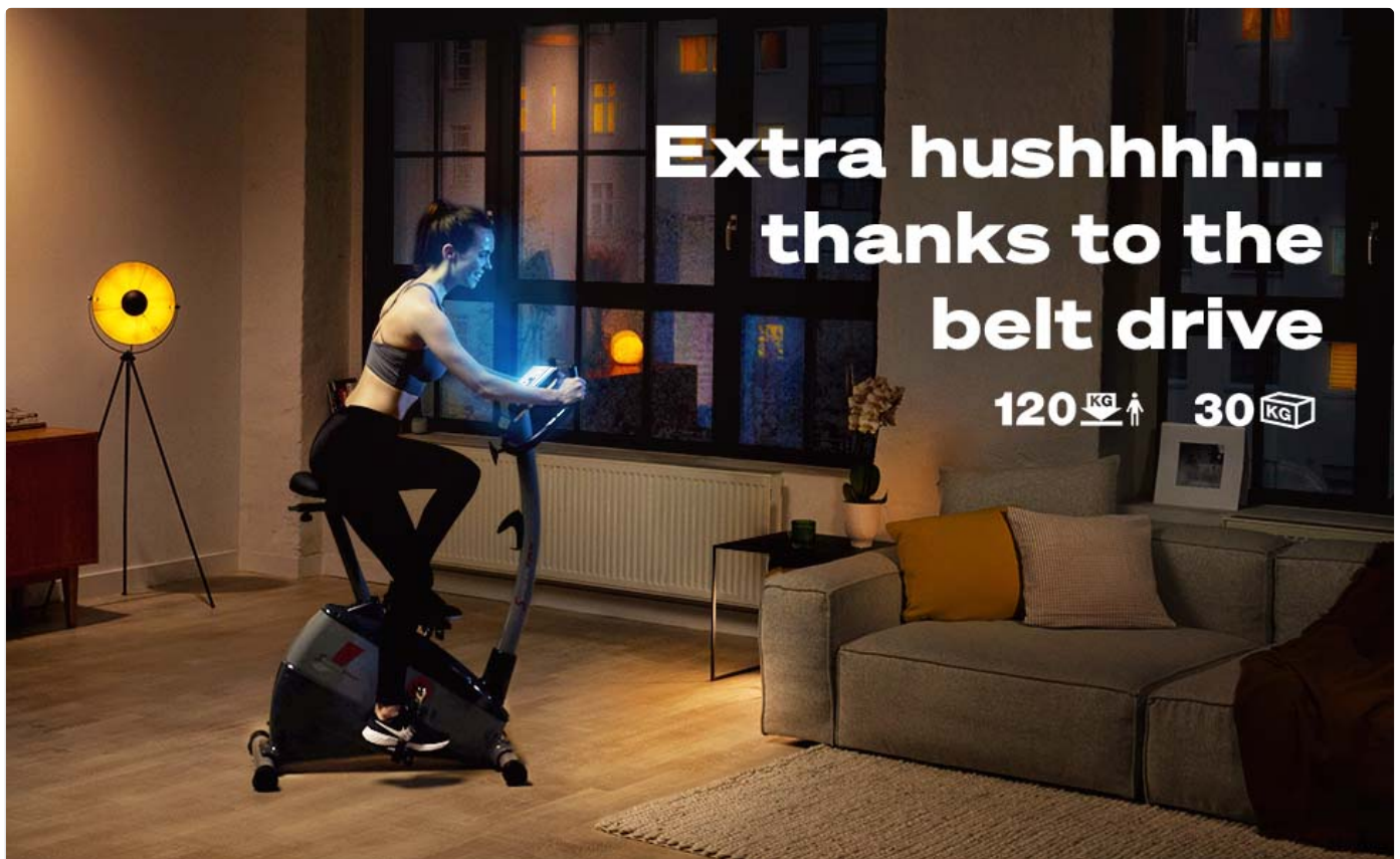
Image: A user exercising on the ESX500, highlighting the low-noise belt drive system for optimal power transmission and durability.

The ESX500 features a 12 KG inertia flywheel and a low-noise belt drive system, providing smooth and quiet operation. The 16-stop motor-controlled magnetic braking system allows for precise and silent resistance adjustments.