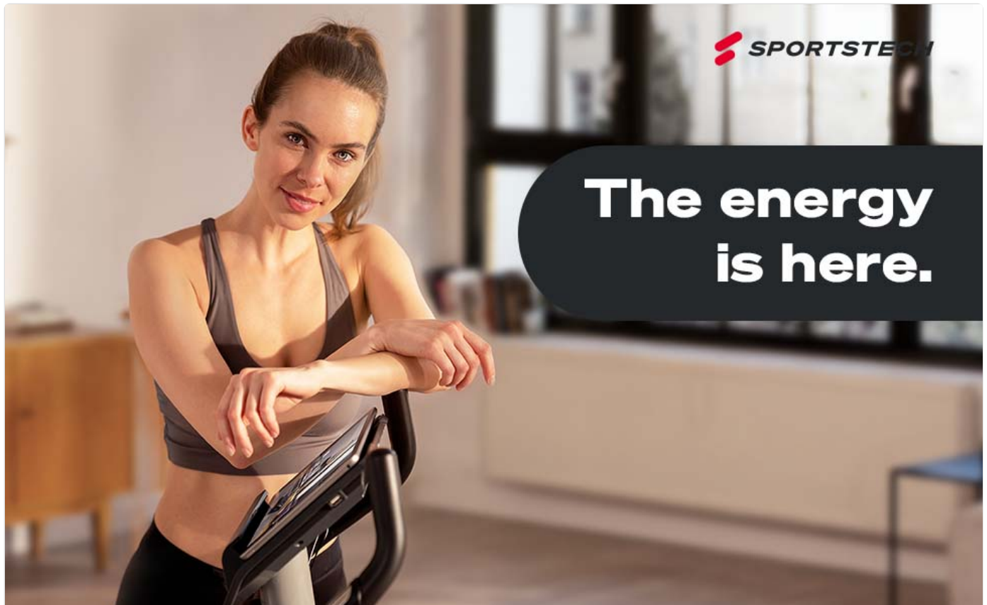
Image: A user exercising on the ESX500 while viewing a virtual cycling route streamed from Kinomap to a large screen, demonstrating the streaming function.