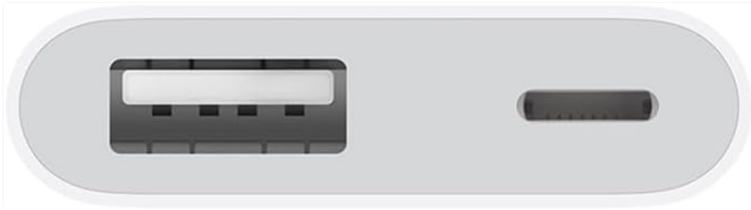
Figure 2: The adapter connected to an iPad, ready for a USB device.