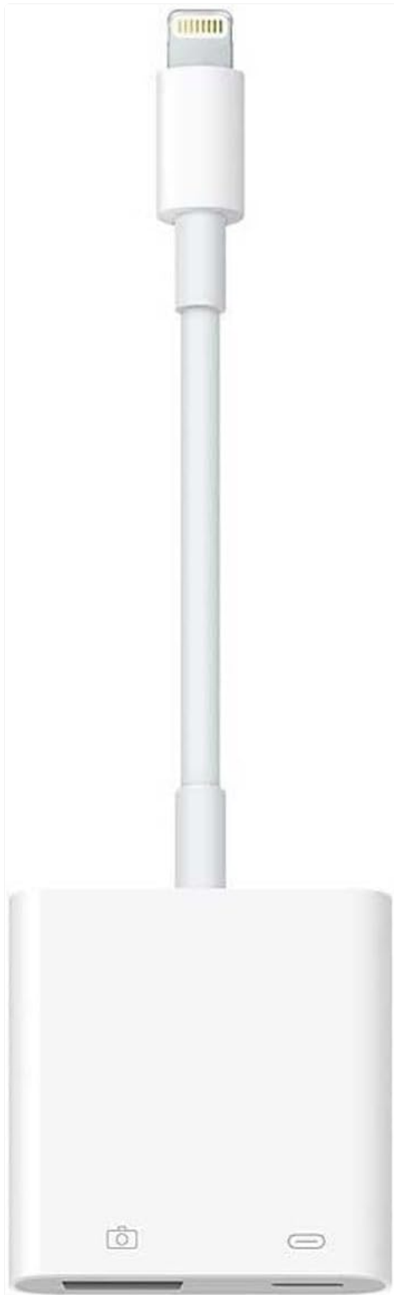
Figure 1: The Apple Lightning to USB 3 Camera Adapter, showing its Lightning connector and USB-A port.