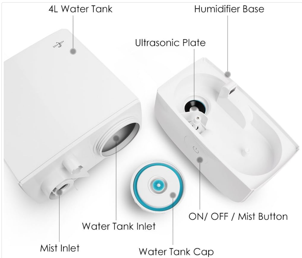
Image 4.2: The 360-degree rotating mist nozzle. This feature allows users to adjust the direction of the cool mist output.