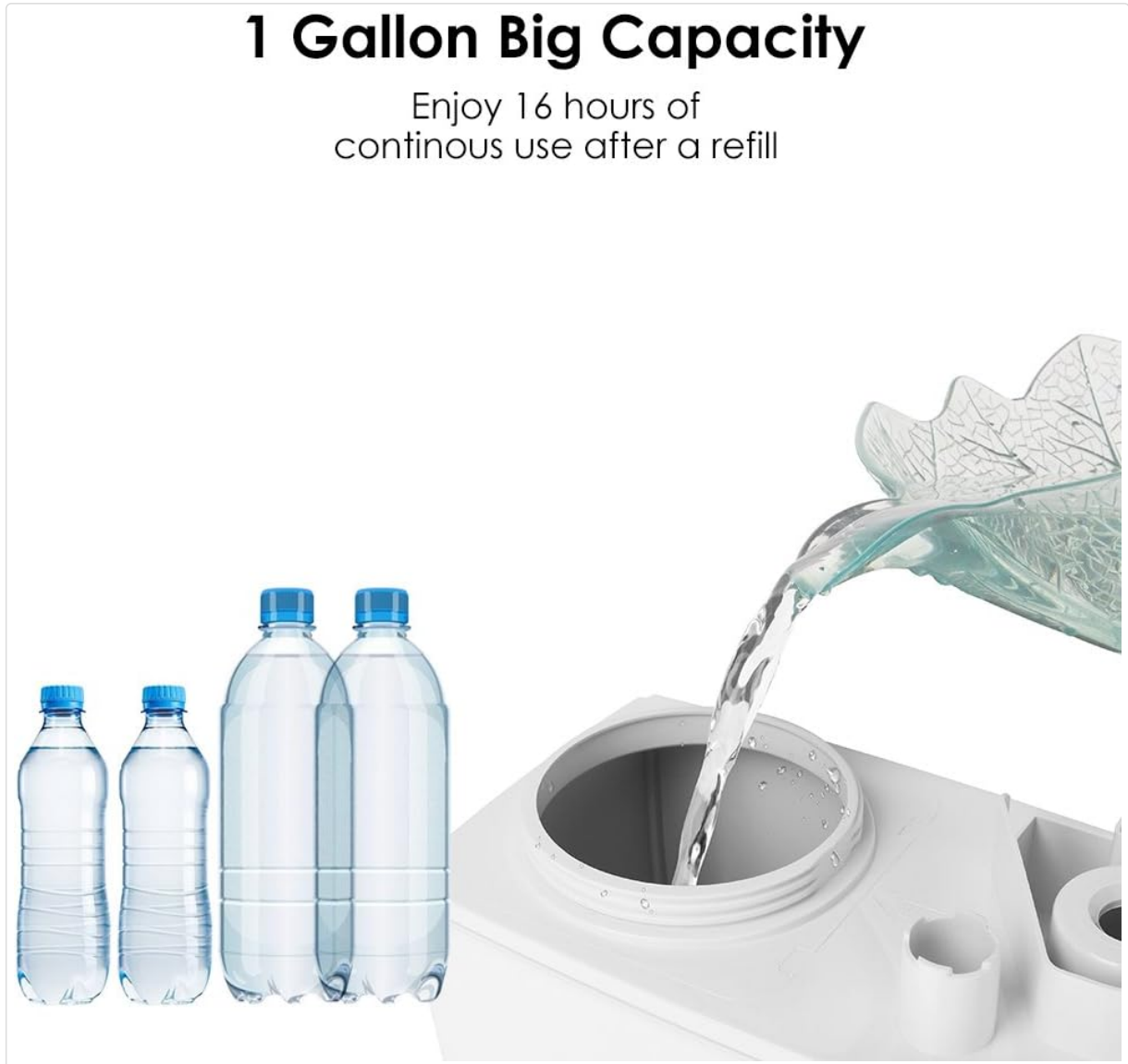
Image 3.1: Demonstrating how to fill the water tank. Water is being poured into the tank's opening, highlighting the large capacity.

The humidifier features a 4-liter capacity tank for extended operation.