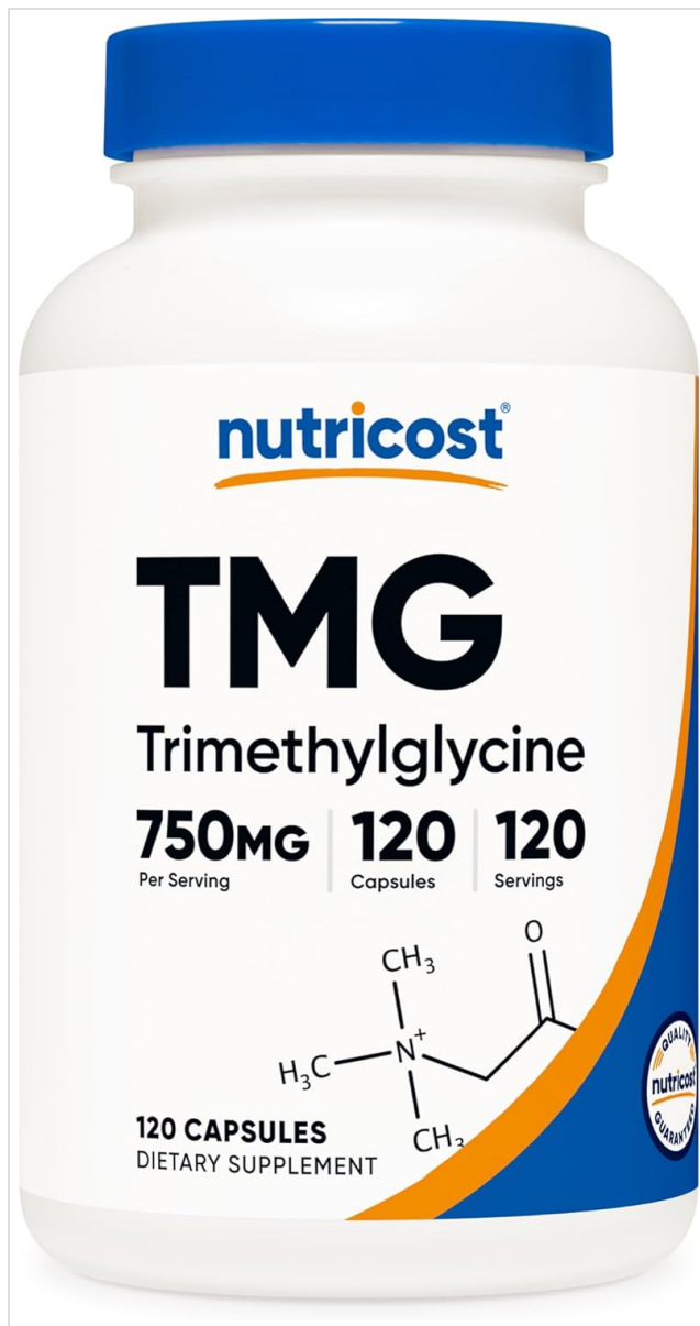
Image: Front view of the Nutricost TMG 750mg bottle, displaying the brand name, product name, dosage, and capsule count.