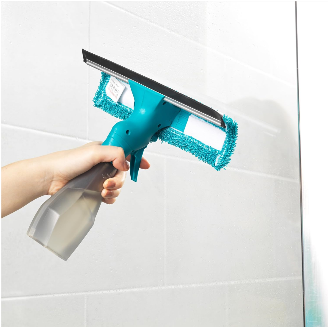
Image: A hand demonstrating the squeegee function of the window cleaner, removing liquid from a surface.