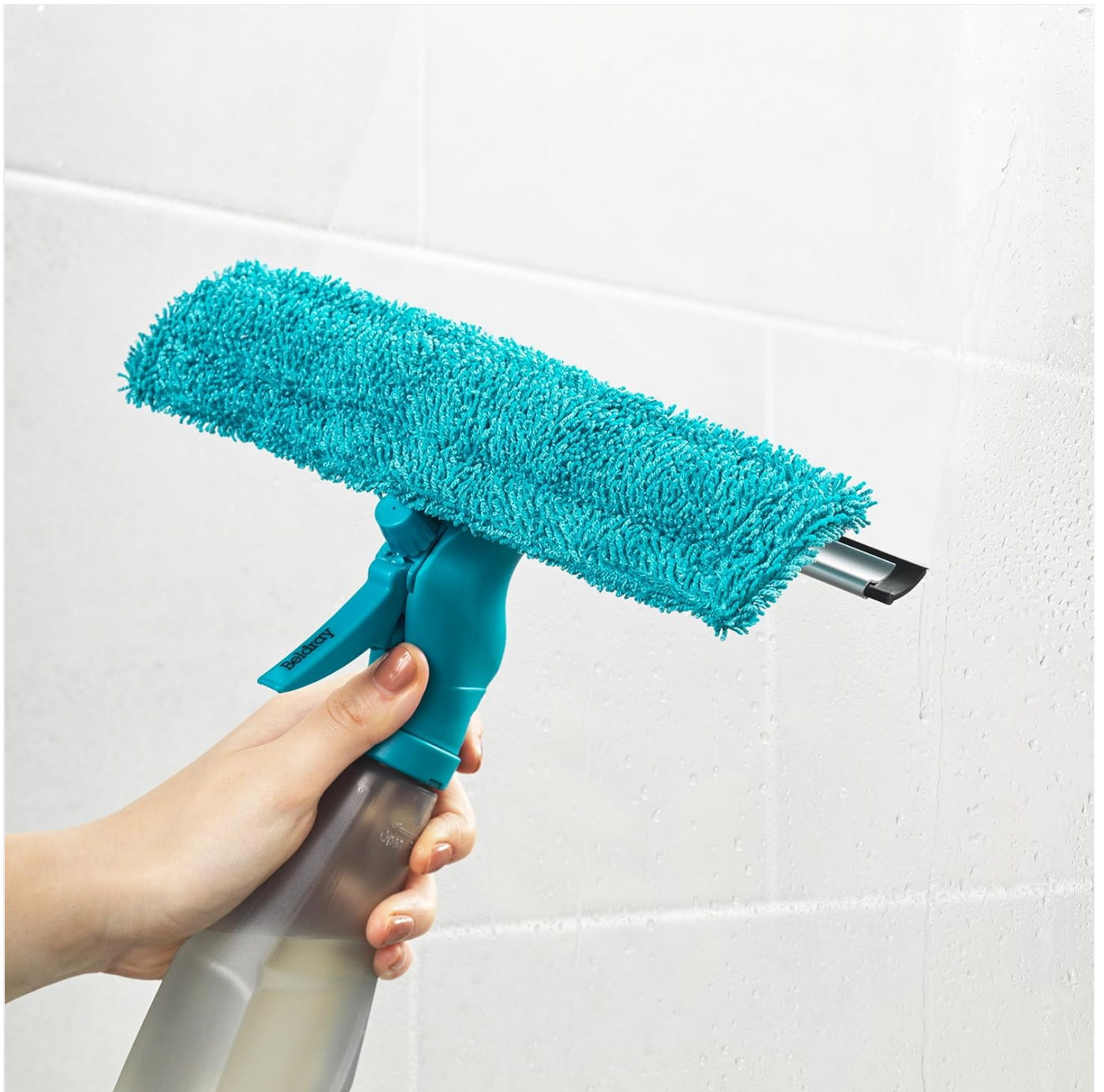
Image: A hand demonstrating the spray function of the window cleaner on a tiled wall.