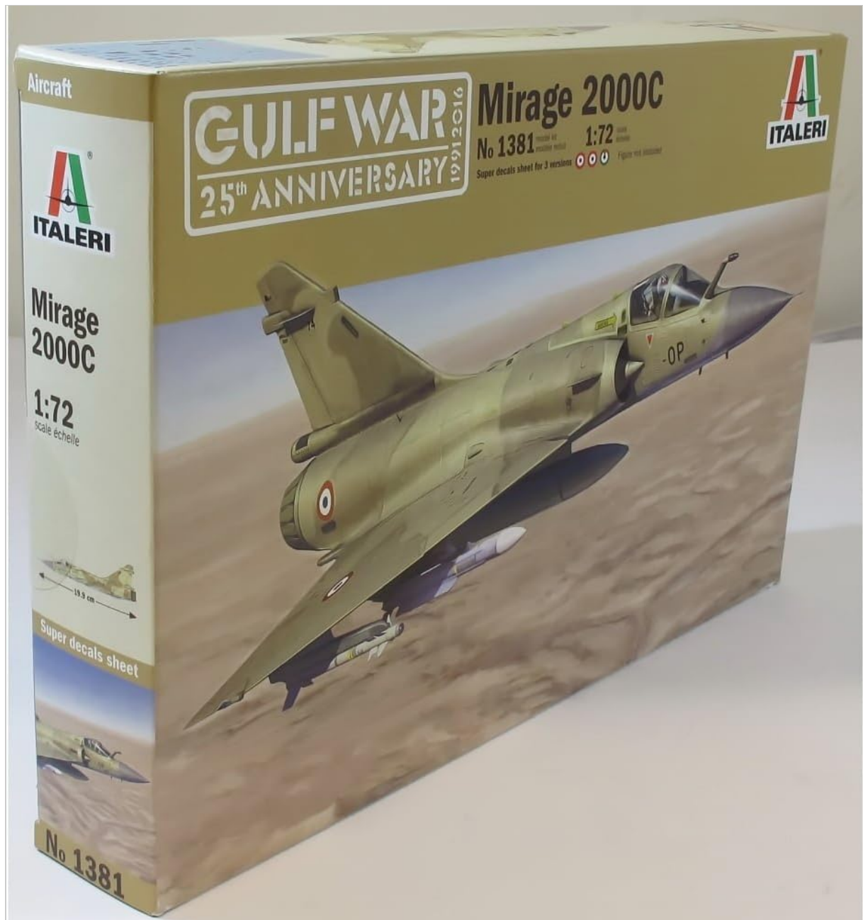
Image 1.1: Front view of the Italeri Mirage 2000C model kit box, showcasing the aircraft artwork and kit details.