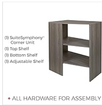
Image detailing the individual components of the SuiteSymphony Corner Unit, including top shelf, bottom shelf, and adjustable shelf, along with assembly hardware.