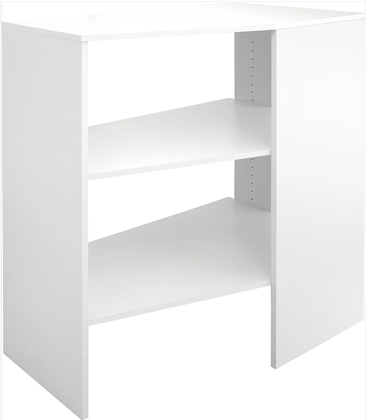
Image of the ClosetMaid SuiteSymphony Wood Corner Shelf Unit in Pure White.