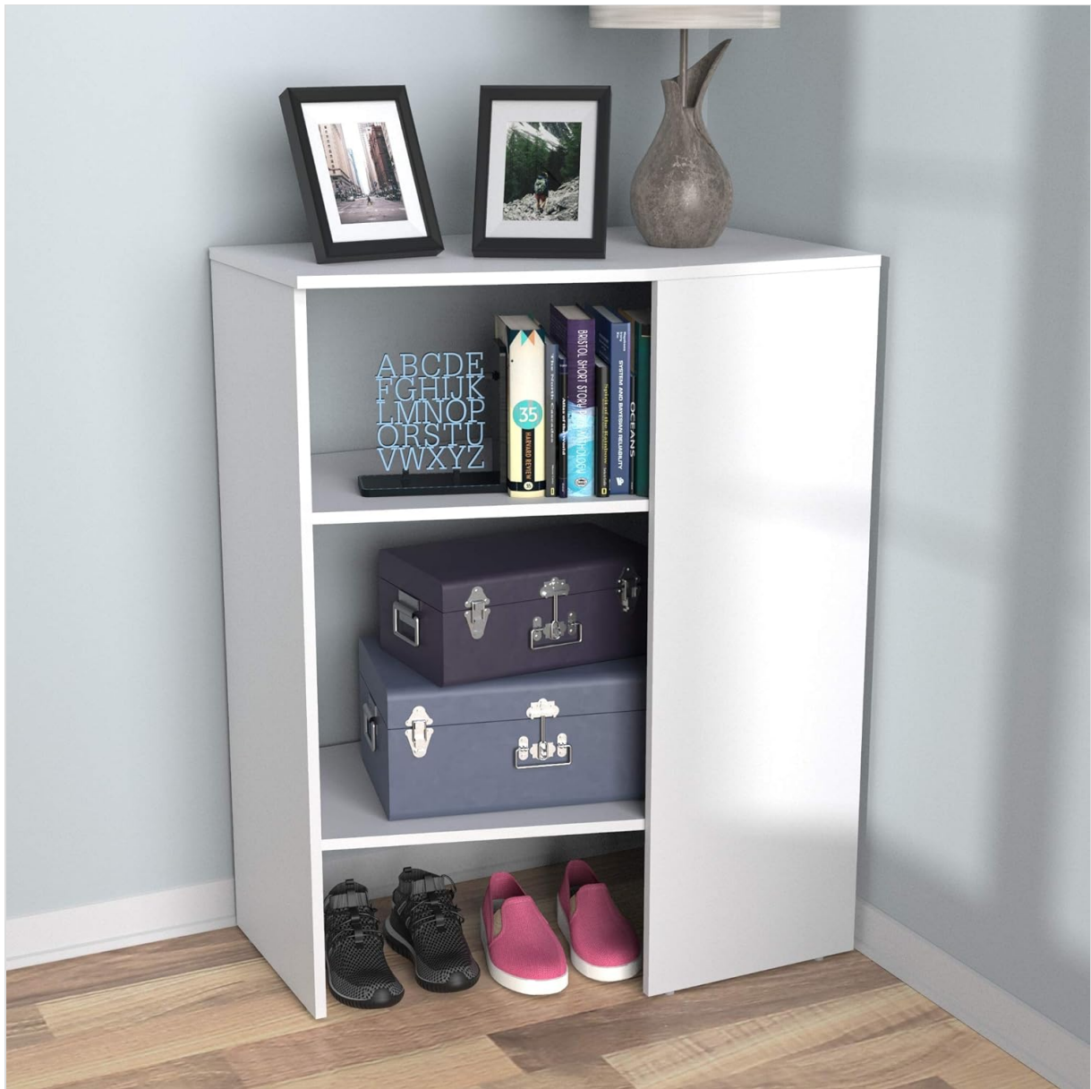
Image showing the corner shelf unit in a room, organized with books, decorative boxes, and shoes.