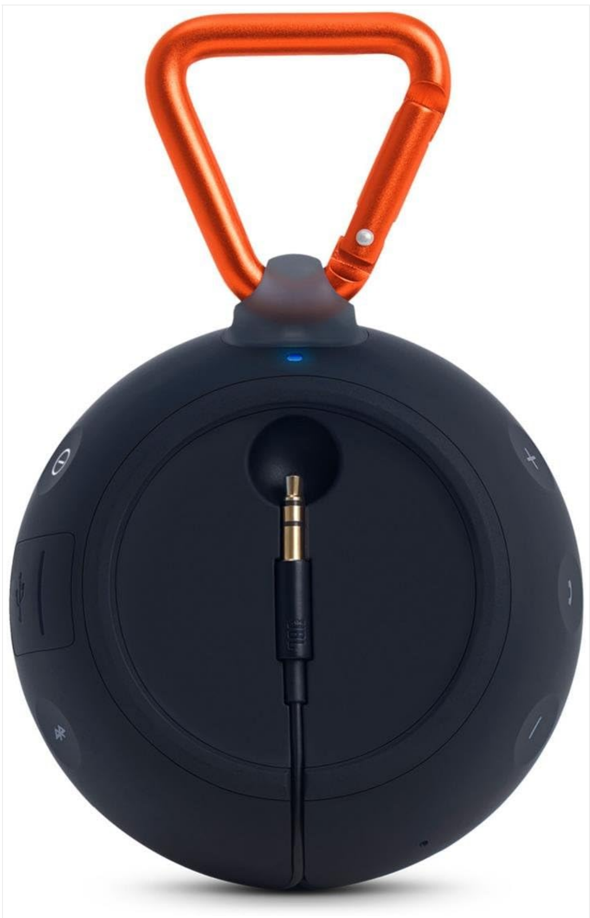
Figure 1: Front view of the JBL Clip 2 speaker, highlighting its integrated 3.5mm audio cable and carabiner clip.