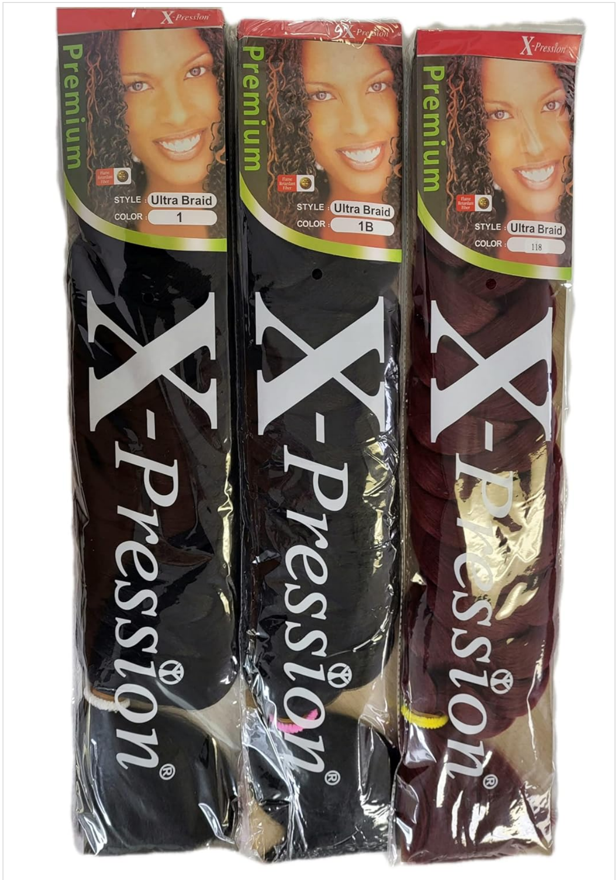
Image: Three packs of X-pression Premium Original Ultra Braid hair extensions, illustrating different color options available.