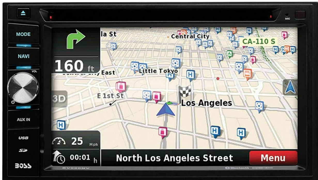
Figure 3: Front View of BV960NV. This image shows the front of the BOSS Audio Systems BV960NV unit, featuring its 6.2-inch touchscreen display with an active GPS navigation map. Control buttons and a volume knob are visible on the left side.