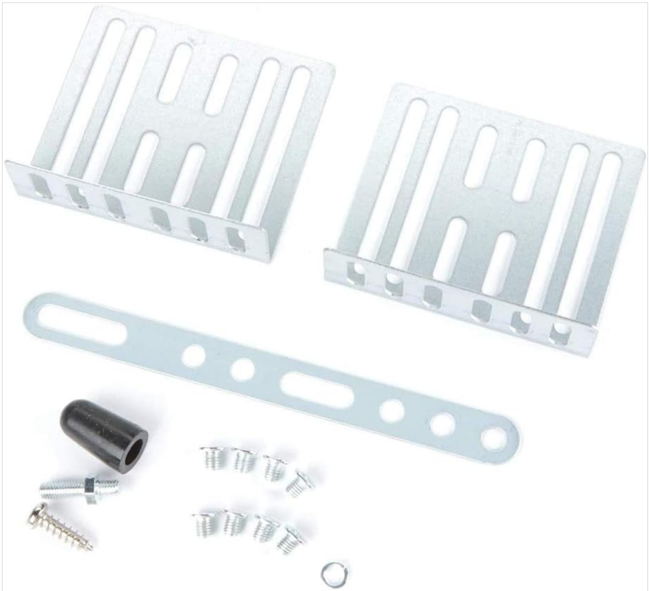
Figure 1: Mounting Hardware. This image illustrates the metal mounting brackets, screws, and a rubber cap for the GPS antenna, which are provided for secure installation of the BV960NV unit in a vehicle's dashboard.