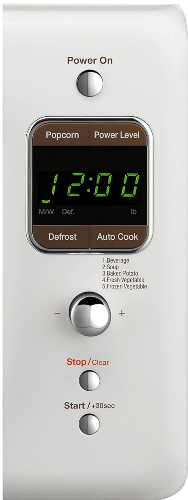
Close-up of the control panel, highlighting the digital display, dial, and function buttons.