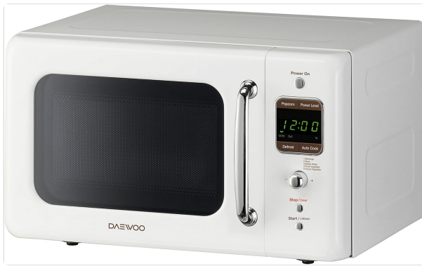
Front view of the Daewoo KOR-7LREW Retro Microwave Oven, showcasing its cream white finish and control panel.