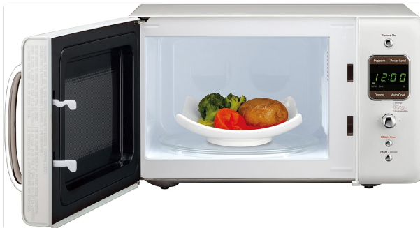
Interior view of the microwave with the door open, showing a plate of food on the recessed turntable.