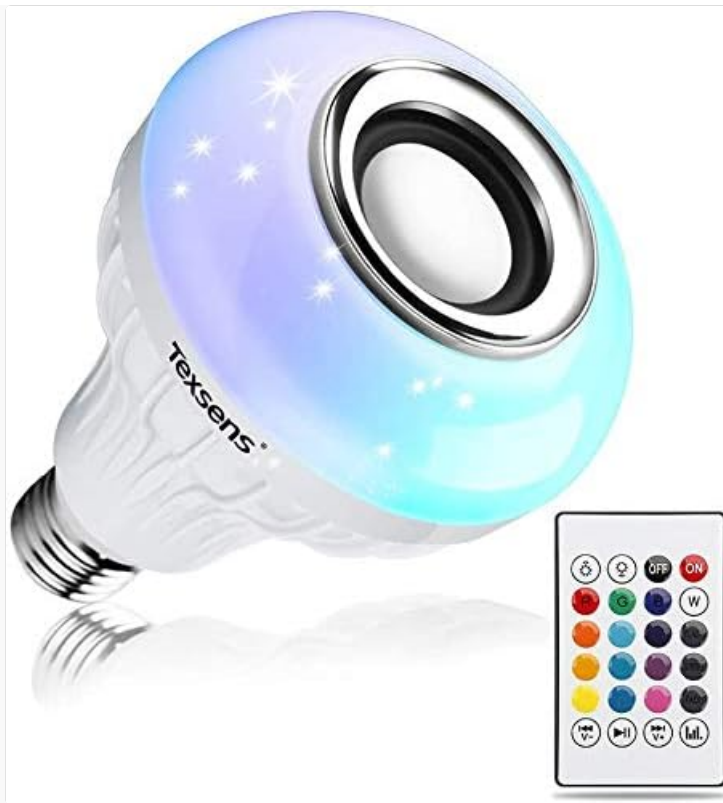
The Teksens Bluetooth Smart Light Bulb Speaker, Generation II, shown alongside its compact remote control. The bulb features a speaker grille at the top and a standard E26 base.