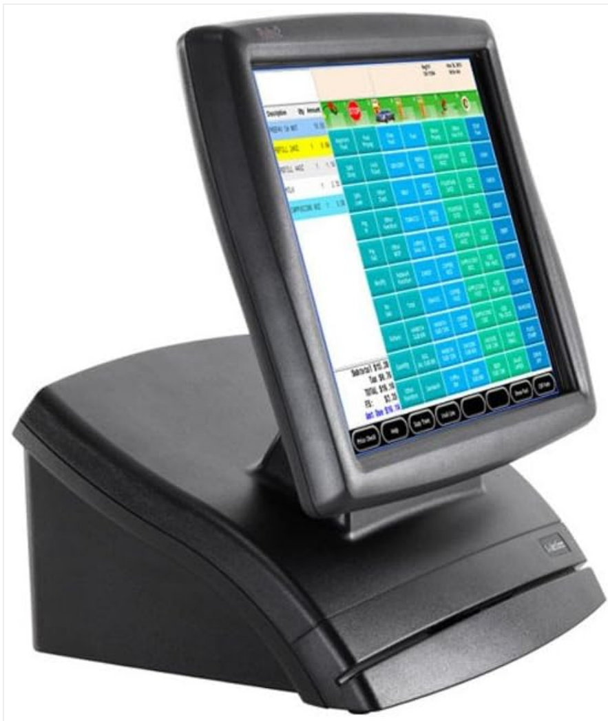
Image: A Verifone Ruby2 Touch Screen POS Console, an example of a compatible device.