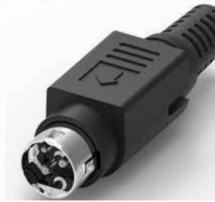
Image: Close-up view of the 3-pin C143DIN-L connector on the charger cable.