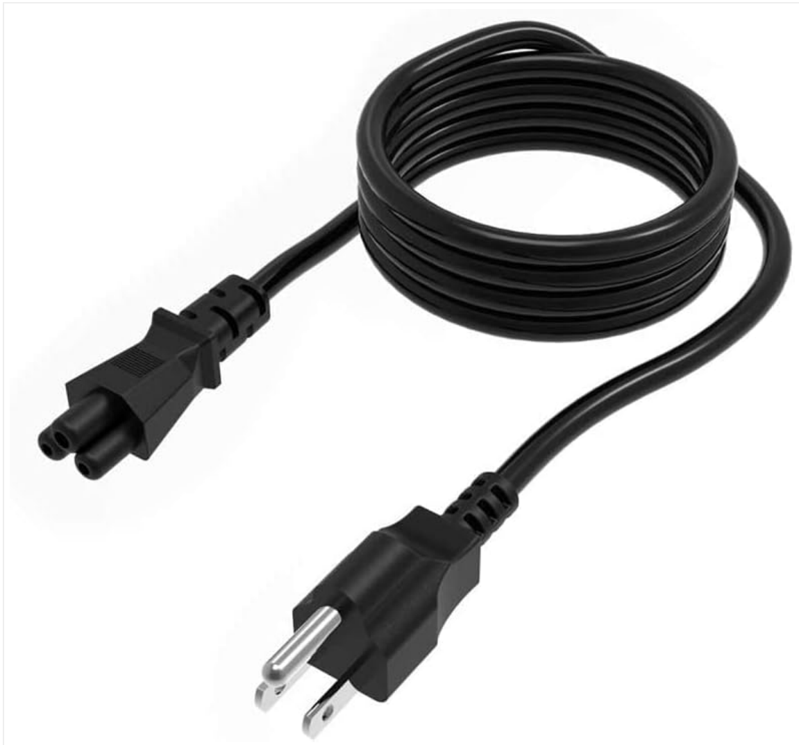
Image: The AC power cord, which connects the charger to a wall outlet.