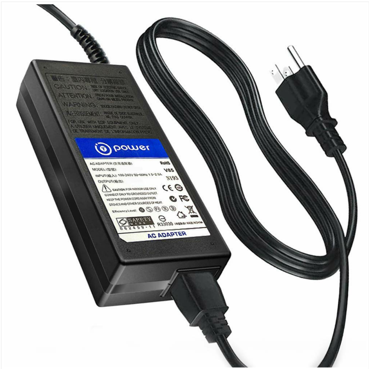
Image: The T POWER 24V 3-Pin Charger, featuring the main power brick and connected cables.