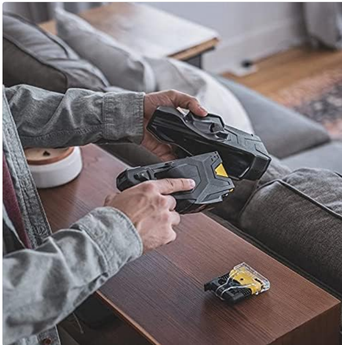
Image: A person holding the TASER X2 device, demonstrating its compact size and ease of handling.