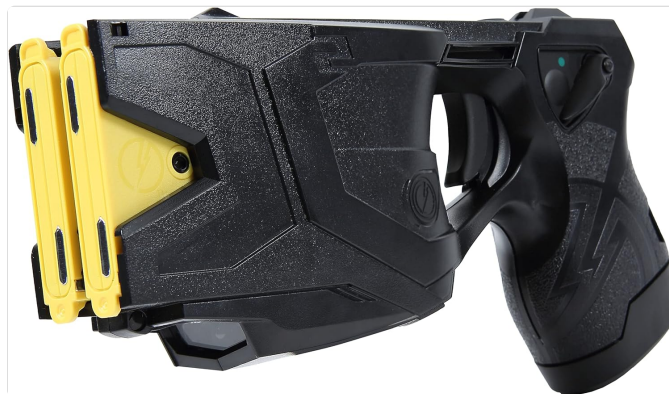
Image: A side view of the black TASER X2 device with yellow cartridges inserted, showcasing its ergonomic design.