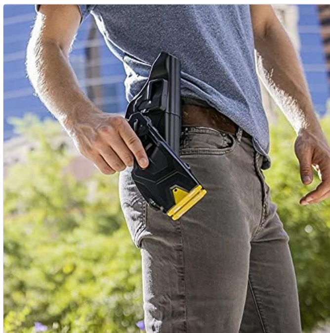
Image: A person demonstrating how the TASER X2 can be carried securely in a holster on their belt, highlighting its portability for personal defense.