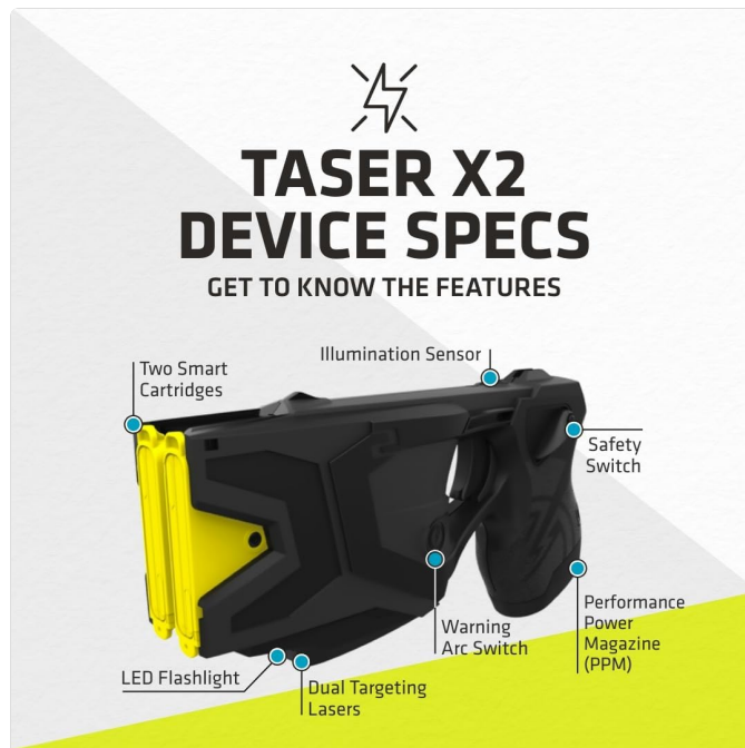
Image: Diagram highlighting the key features of the TASER X2 device, including smart cartridges, LED flashlight, dual targeting lasers, warning arc switch, safety switch, and Performance Power Magazine.