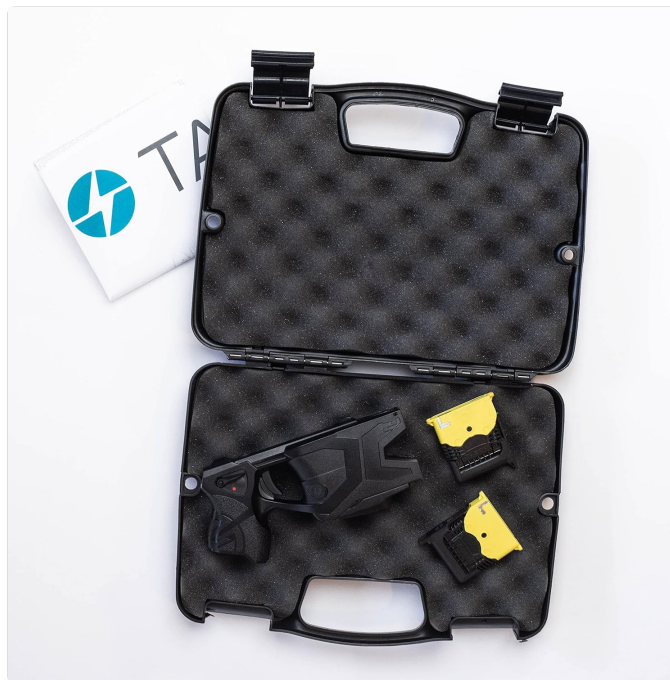
Image: The TASER X2 device and cartridges neatly arranged within its rugged carrying case.