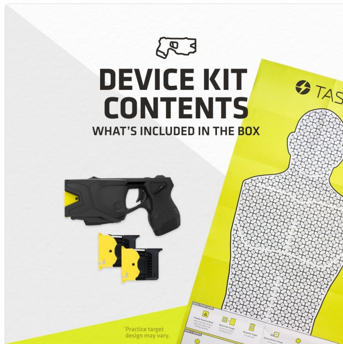
Image: Contents of the TASER X2 kit, showing the device, two cartridges, and a practice target.