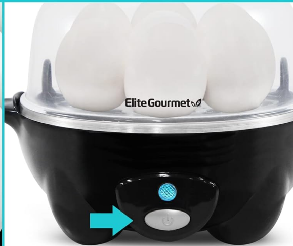
Image: Step-by-step visual guide demonstrating how to set up the egg cooker for boiling eggs, from adding water to pressing the power button.