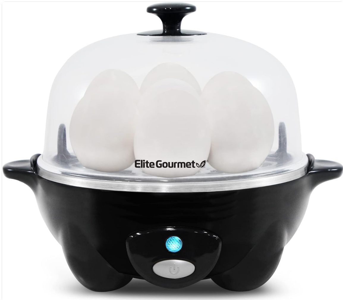
Image: The Elite Gourmet Easy Electric 7 Egg Capacity Cooker, showcasing its compact design and capacity for 7 eggs.