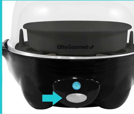
Image: The Elite Gourmet Egg Cooker with the poaching tray in place, ready for or after cooking poached eggs.