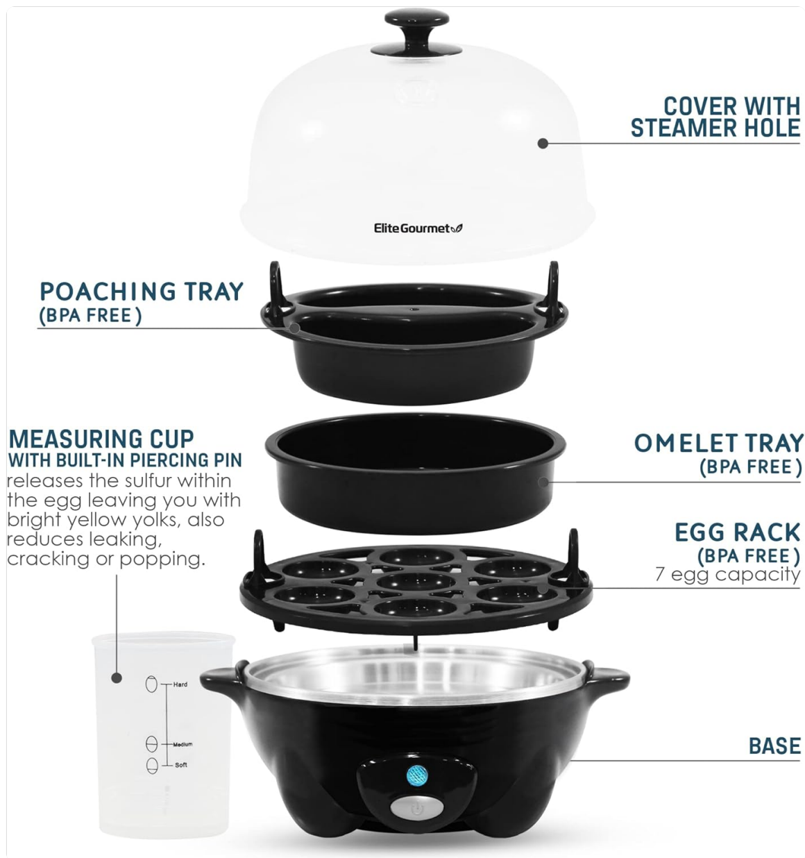
Image: A detailed breakdown of the Elite Gourmet Egg Cooker's components, including the cover, various trays, egg rack, measuring cup, and base.