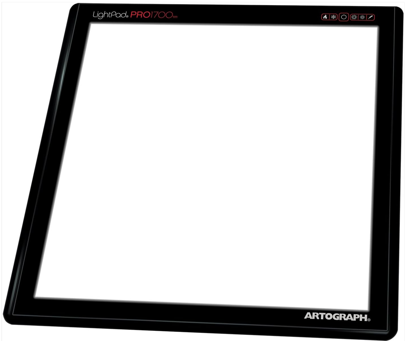
Image: Top-down view of the Artograph LightPad PRO1700 LED Light Box.