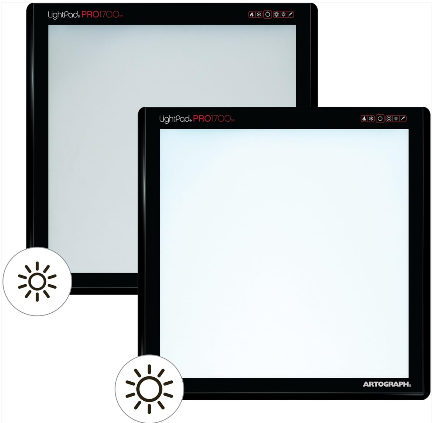
Image: Two LightPad PRO1700 units demonstrating different brightness levels, from bright to dim.