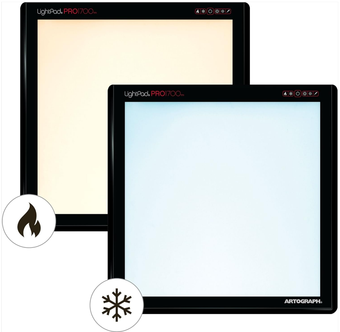
Image: The LightPad PRO1700 showcasing its adjustable color temperature feature, with one unit displaying warm light and another cool light.