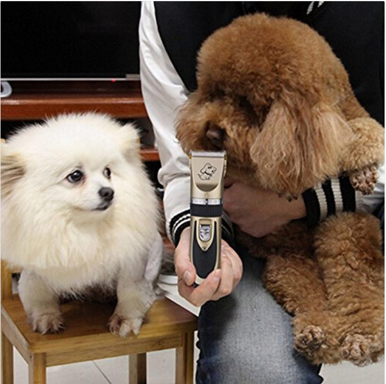
Image 6.2: A person using the Baorun Pet Grooming Clipper to groom a small dog, illustrating the practical application of the device.