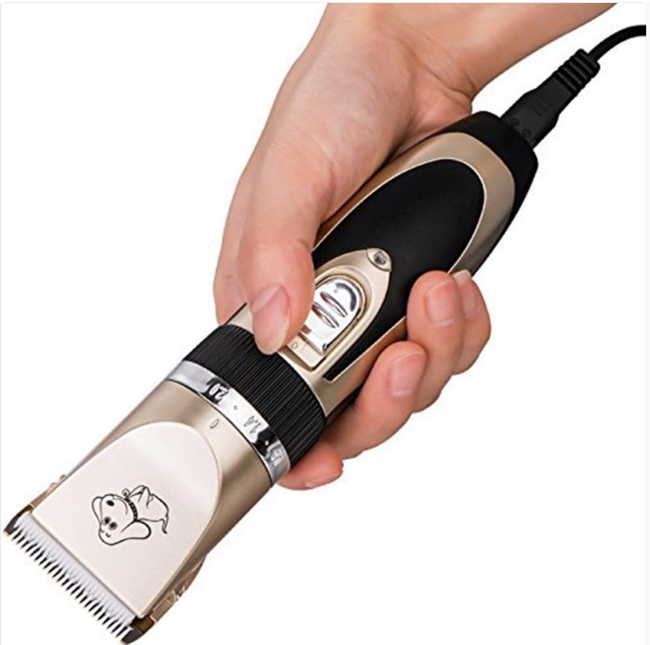
Image 5.1: A hand holding the Baorun Pet Grooming Clipper with the charging cable connected, demonstrating the charging process.