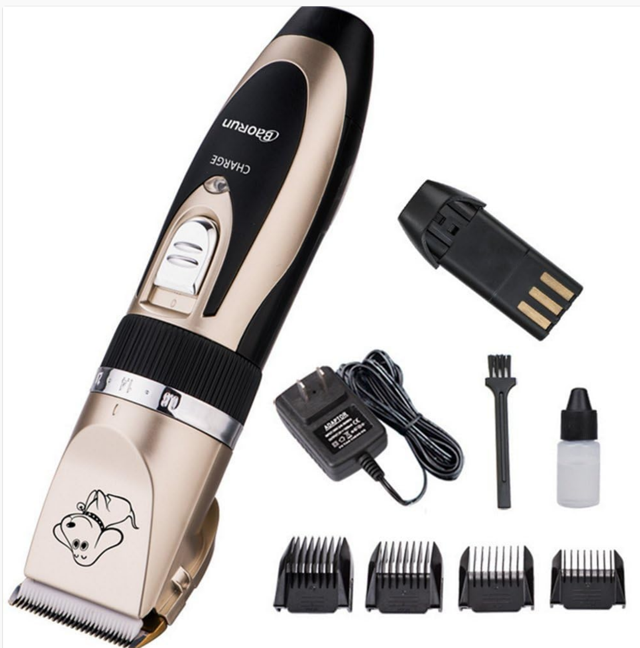
Image 3.1: Contents of the Baorun Pet Grooming Clippers package, including the clipper, charger, cleaning brush, oil, and four comb guides.