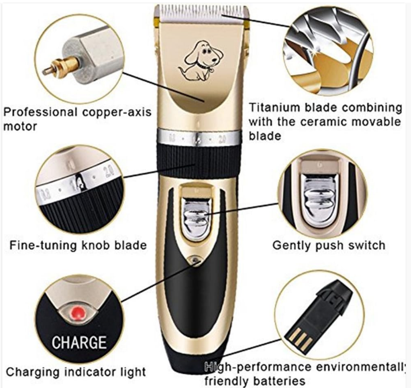
Image 4.1: Detailed diagram highlighting key features of the clipper, including the professional copper-axis motor, titanium and ceramic blade, fine-tuning knob, push switch, charging indicator light, and high-performance battery.