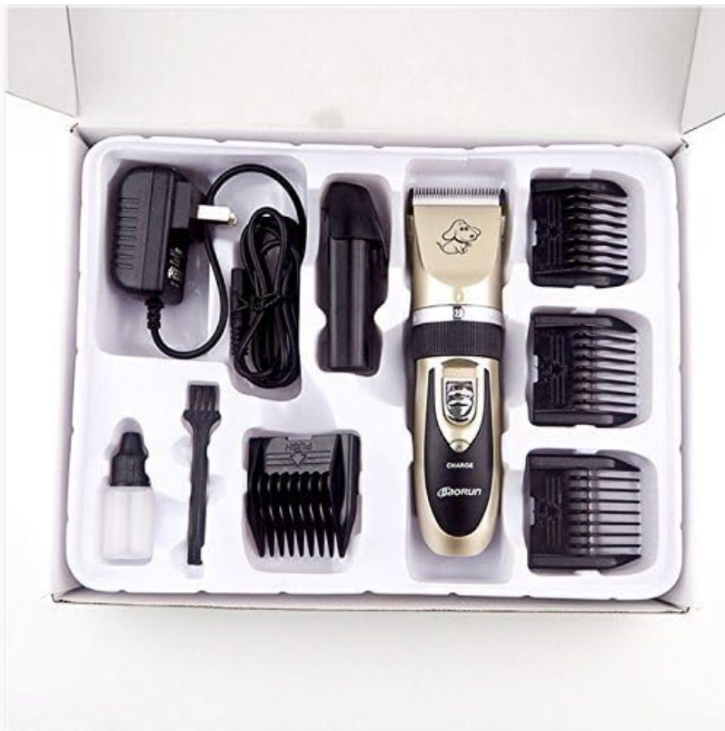
Image 3.2: The Baorun Pet Grooming Clippers kit neatly arranged within its packaging, showcasing all included components.