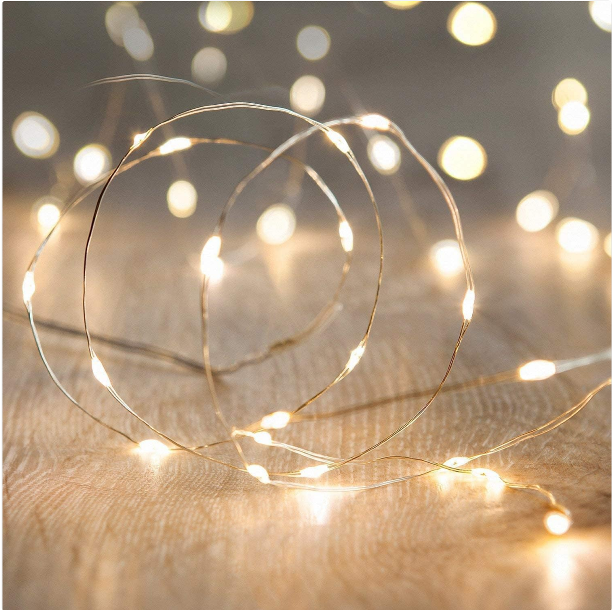
Image: Coiled ANJAYLIA LED Fairy String Lights. The lights are shown in a compact, coiled form, highlighting their flexible wire design.