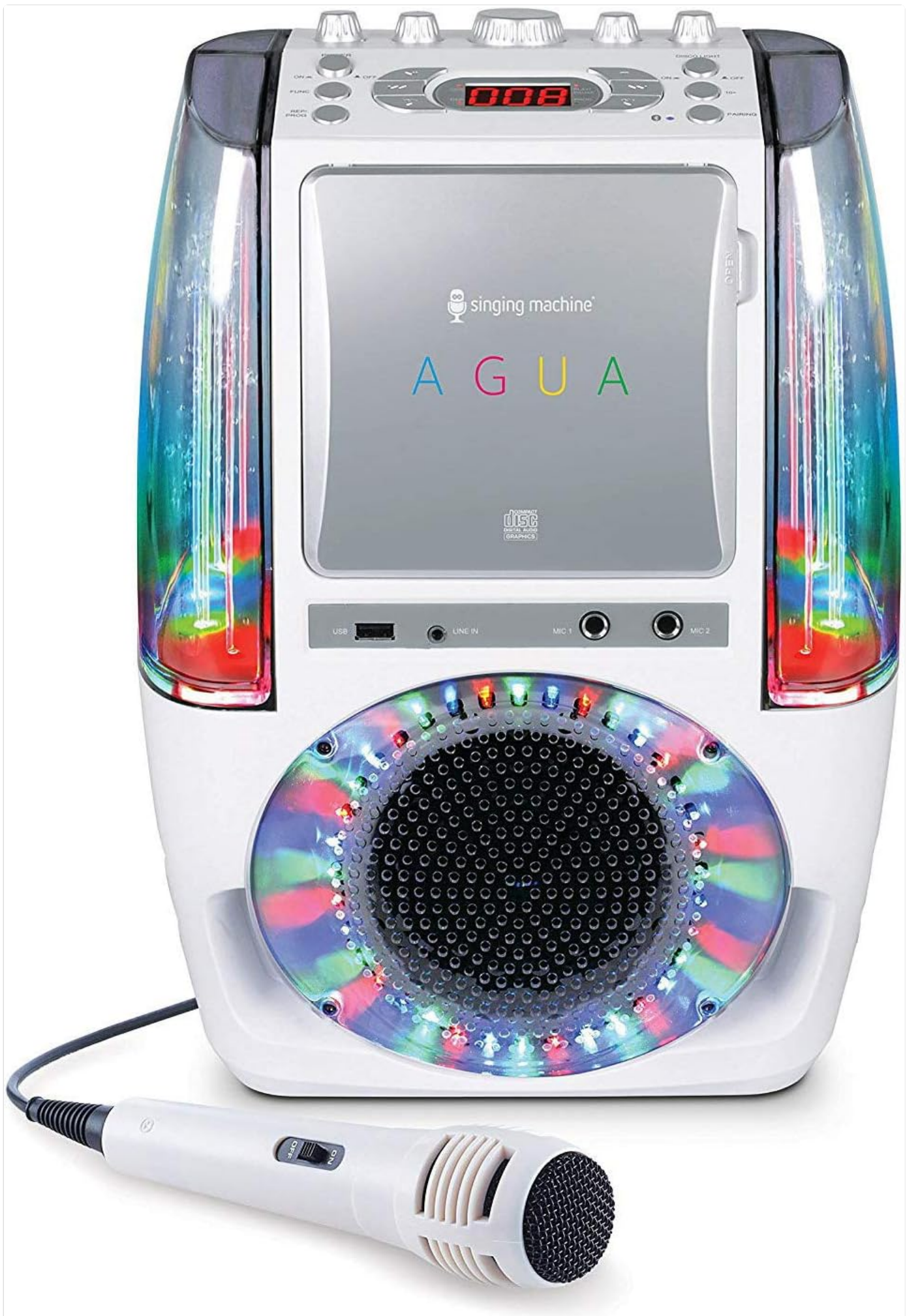
Image: Front view of the Singing Machine SML605W Karaoke System. The unit is white with clear side panels for the water fountain effect.