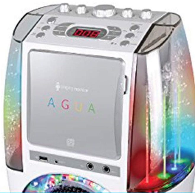
Image: A graphic illustrating the "Motion lighted water synchronize to the music" feature, showing water jets illuminated with colorful lights.