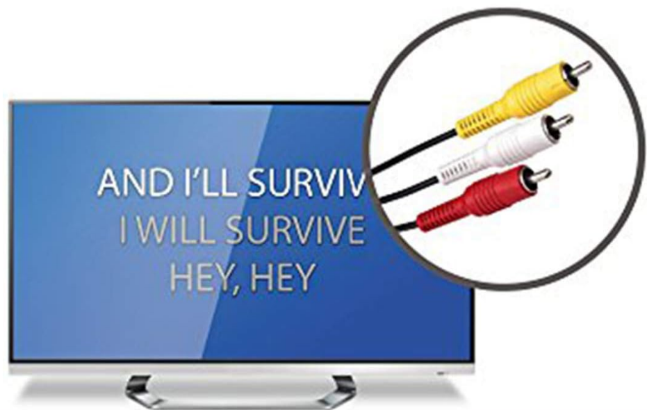
Image: A diagram illustrating how to connect the karaoke system to a TV using RCA cables (red, white, yellow). The yellow cable is for video, and the red/white cables are for audio.

To display lyrics from CD+G discs on your TV, connect RCA cables from the AUDIO OUT (red/white) and VIDEO OUT (yellow) jacks on the back of the karaoke system to the corresponding AUDIO IN and VIDEO IN jacks on your television. Select the correct input source on your TV.