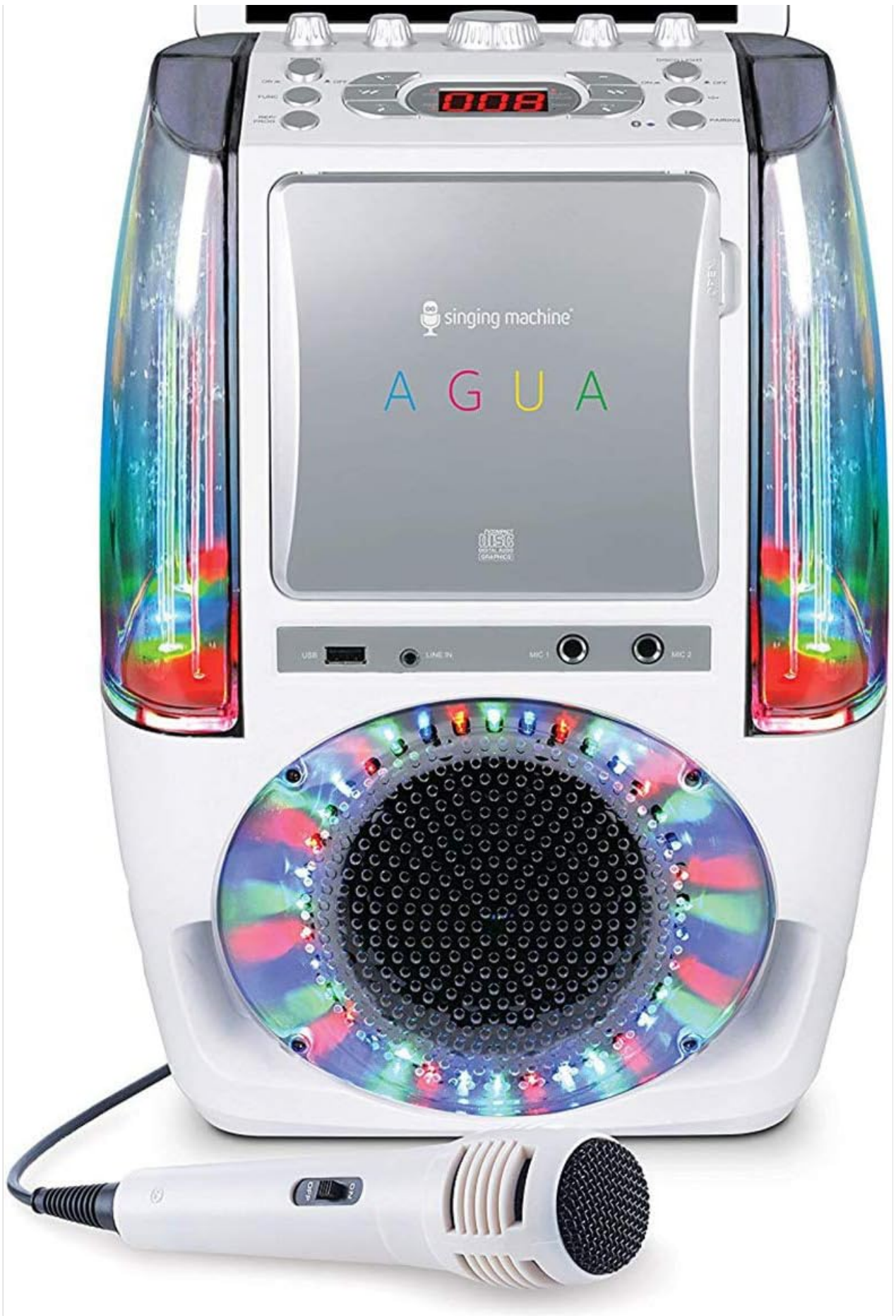
Image: The Singing Machine SML605W with a tablet securely placed in the integrated cradle on top of the unit, displaying song lyrics.

Place your tablet or smartphone in the integrated cradle on top of the unit for easy viewing of lyrics or content from streaming apps.