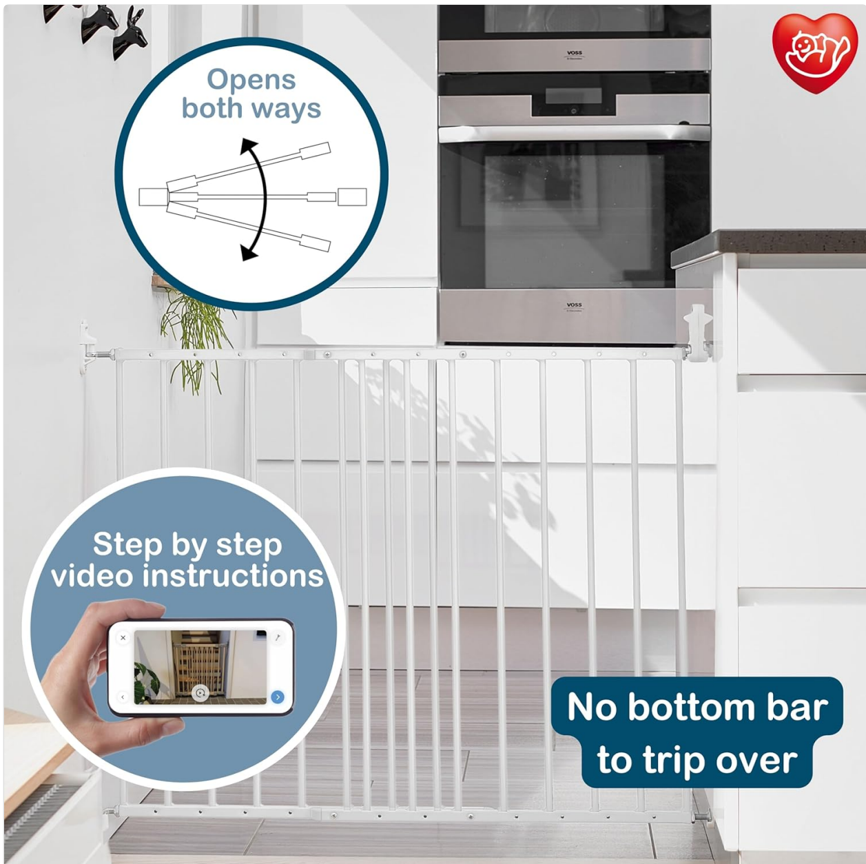
Image 2.3: The gate's ability to open in both directions and a visual reference to the Onbox app for video installation instructions. Note the absence of a bottom bar for clear passage.

For detailed, interactive step-by-step assembly instructions, download the free Onbox app on your smartphone. This app provides visual guidance to simplify the installation process.