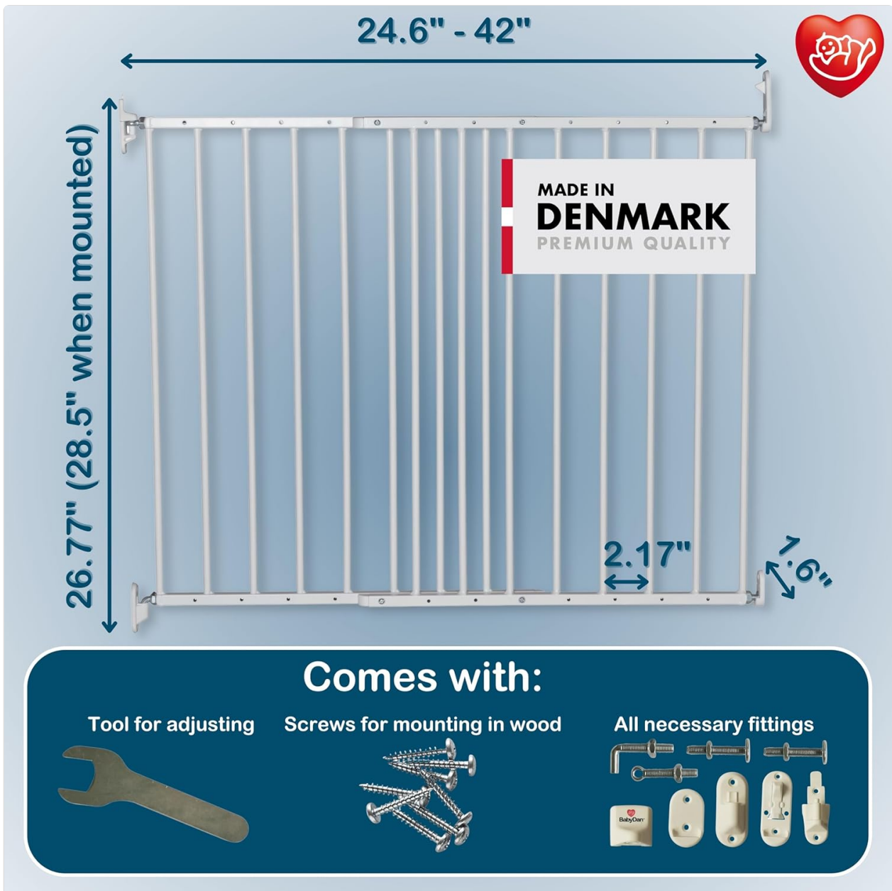
Image 2.2: An illustration detailing the gate's dimensions (24.6"-42" width, 26.77" height) and the various components supplied for installation.