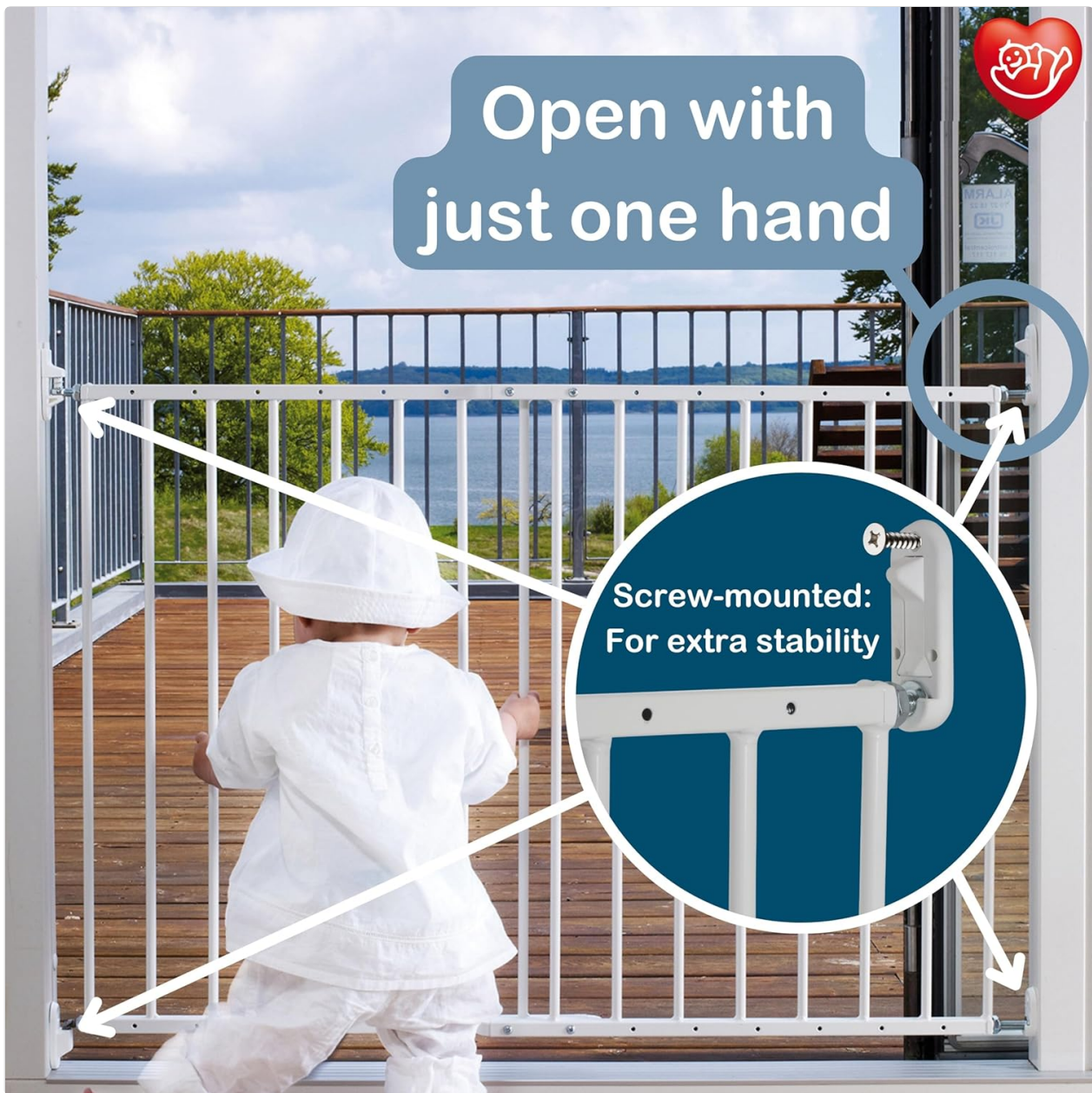
Image 3.1: Demonstrating the gate's one-handed opening feature and highlighting its secure screw-mounted installation.