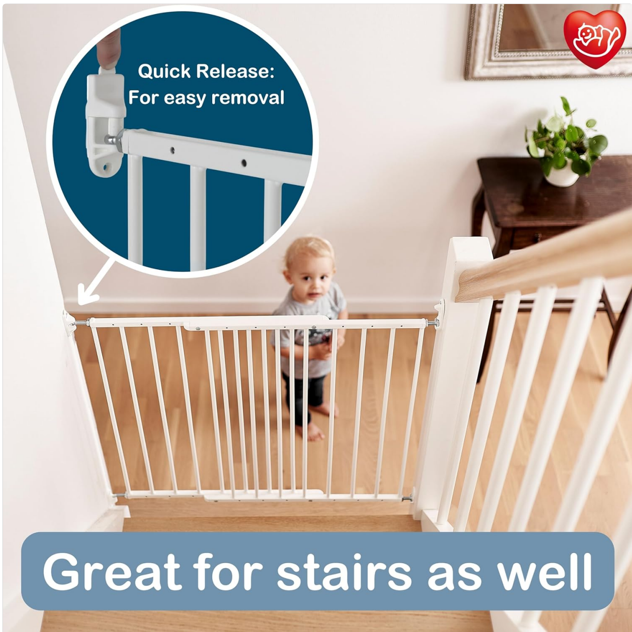
Image 3.2: The quick-release feature of the gate, making it convenient for temporary removal, and its suitability for stairways.