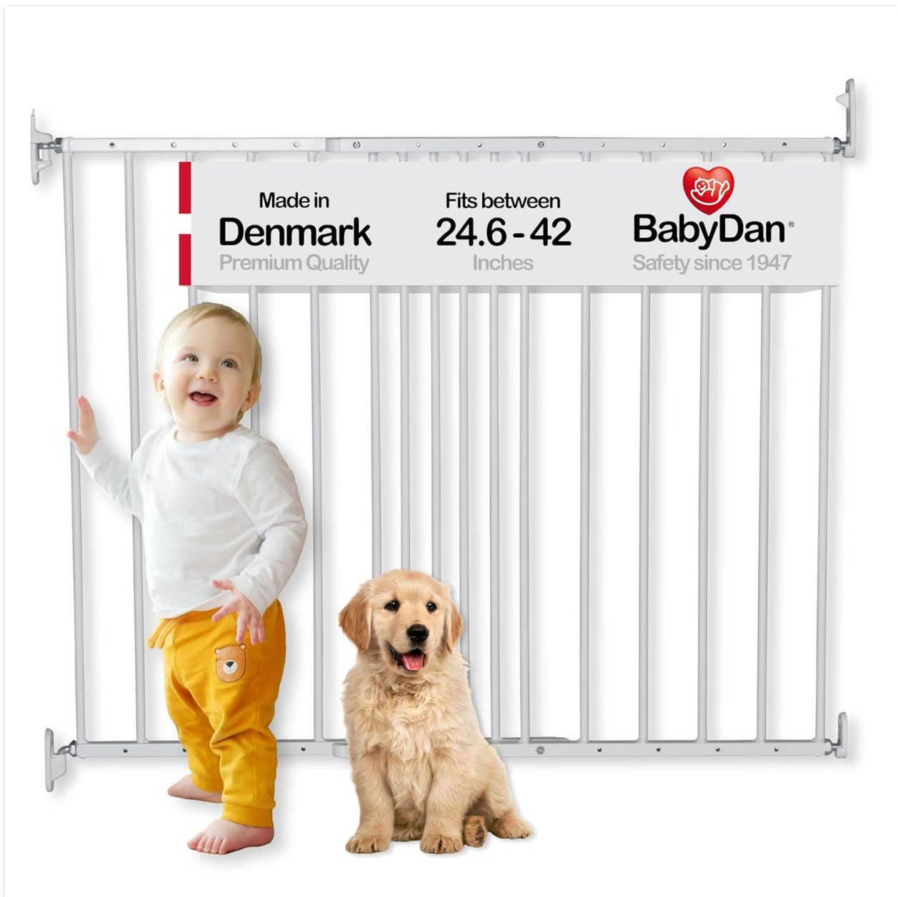
Image 1.1: The BabyDan MultiDan gate, showcasing its extendable design and suitability for both children and pets. The gate is white metal and indicates it fits openings between 24.6 and 42 inches.