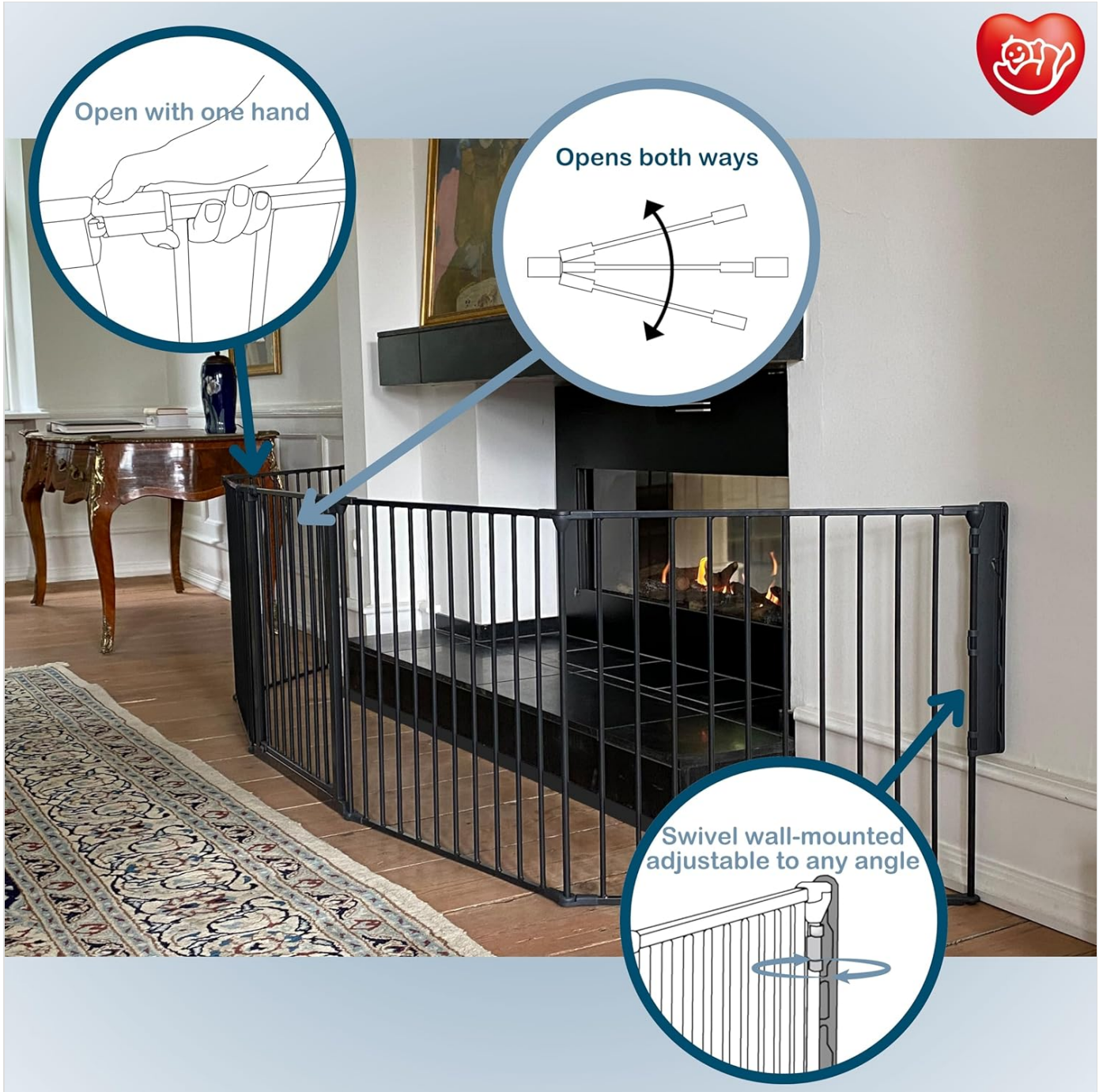
Image: A diagram illustrating how to open the gate with one hand, its ability to open both ways, and the swivel wall-mounted feature that allows adjustment to any angle.