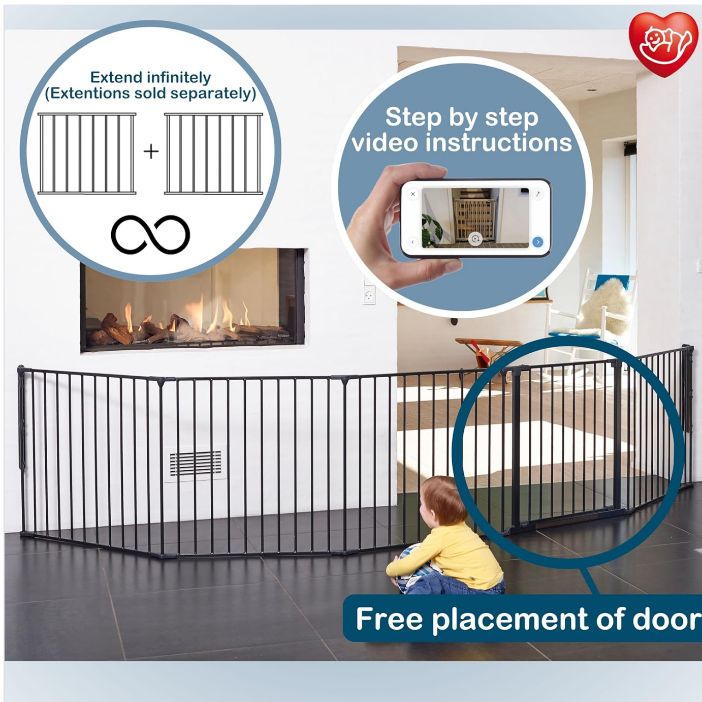
Image: The BabyDan Flex XXL in a room setting, highlighting the option to extend infinitely with separately sold extensions and the flexibility of free door placement within the configuration. A visual cue for 'Step by step video instructions' is also present.