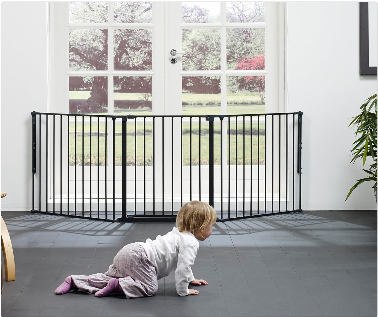
Image: The BabyDan Flex Gate installed as a room divider, demonstrating its function in a living space with a child.