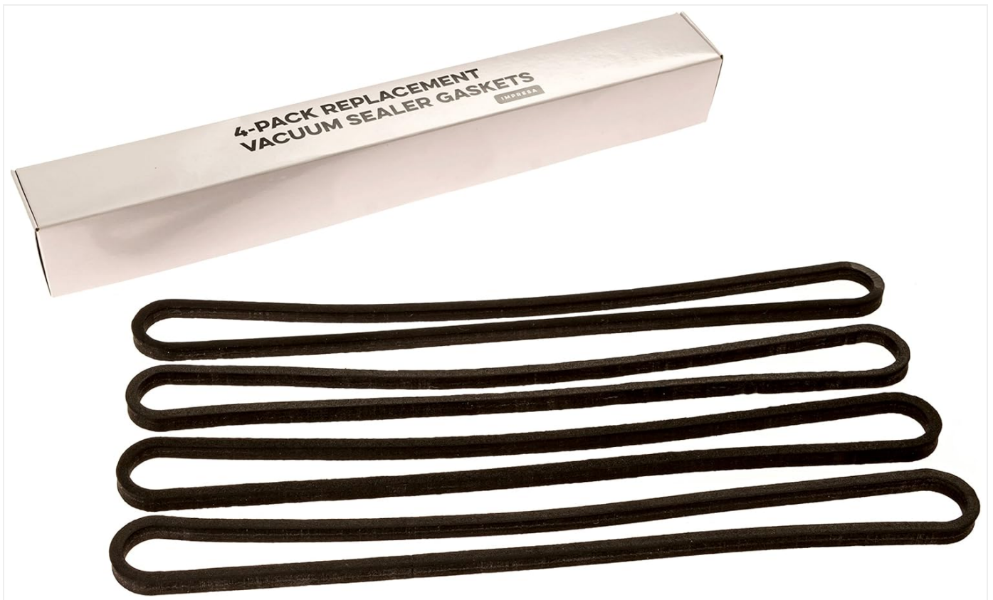
Image: The four-pack of replacement gaskets shown with their product packaging, ready for installation.