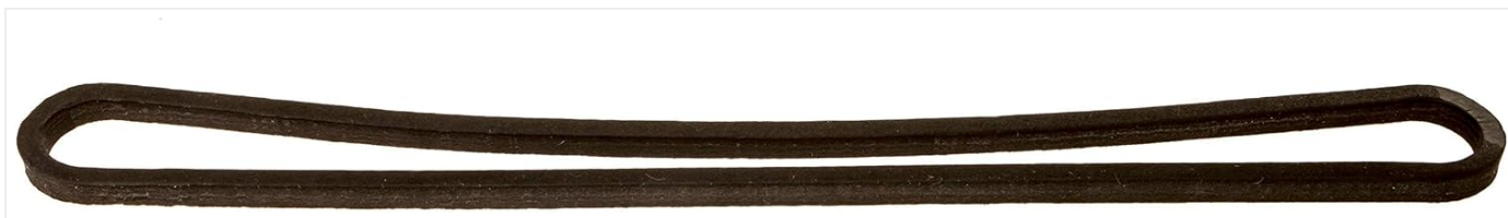
Image: A close-up view of a single replacement gasket, highlighting its foam material and precise shape for effective sealing.