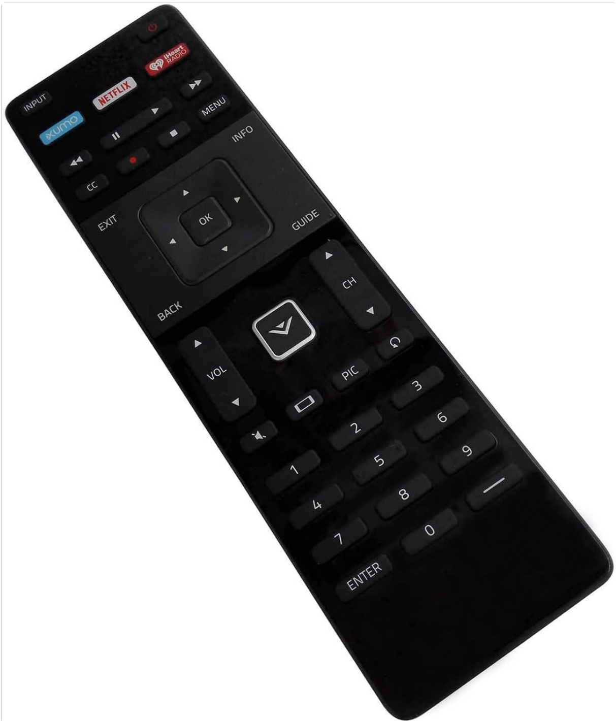
Image: Front view of the VIZIO XRT122 remote control. This image displays the full layout of the remote, including the power button, input selection, navigation pad, volume and channel controls, and dedicated app buttons for XUMO, Netflix, and iHeartRadio.