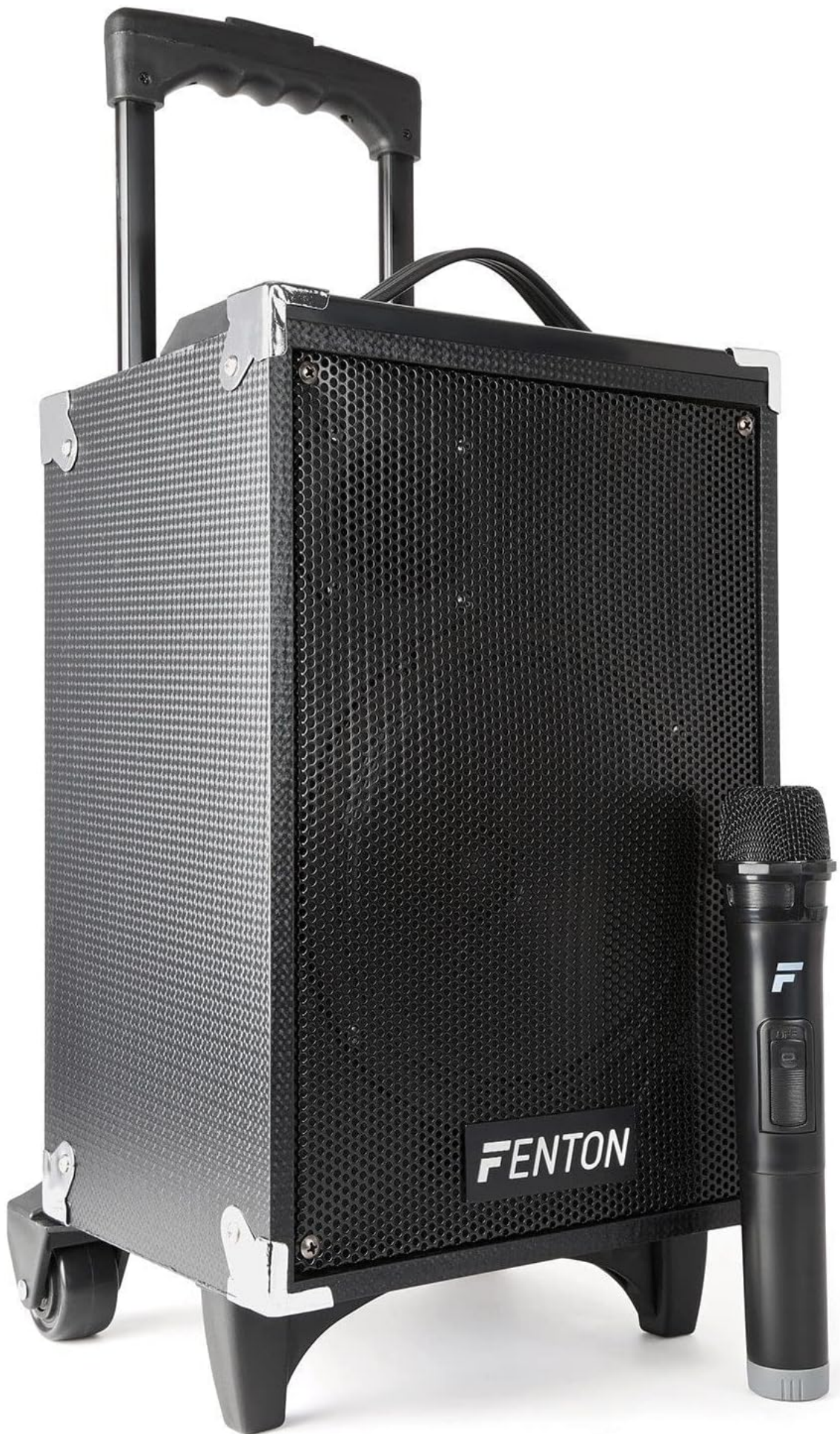
Front view of the Fenton ST050 Mobile Sound System with its included wireless microphone.