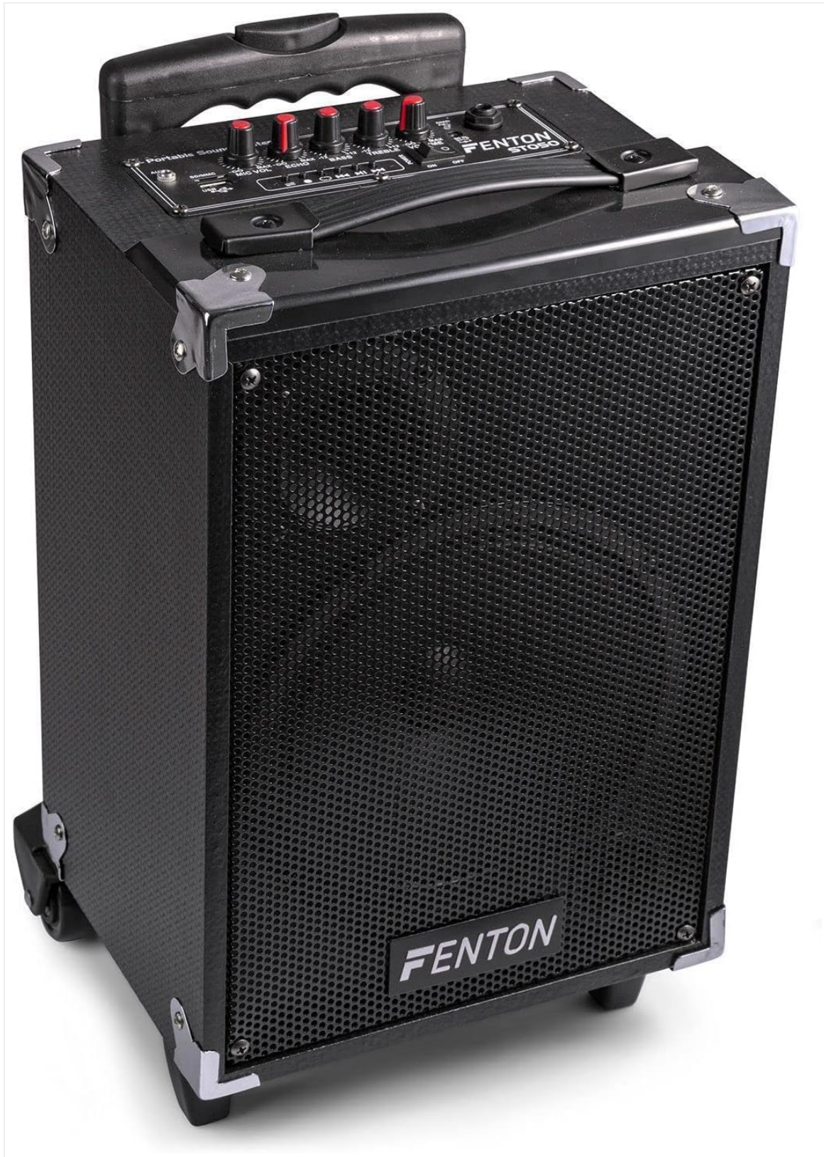
Top view of the unit, highlighting the control panel and integrated handle.