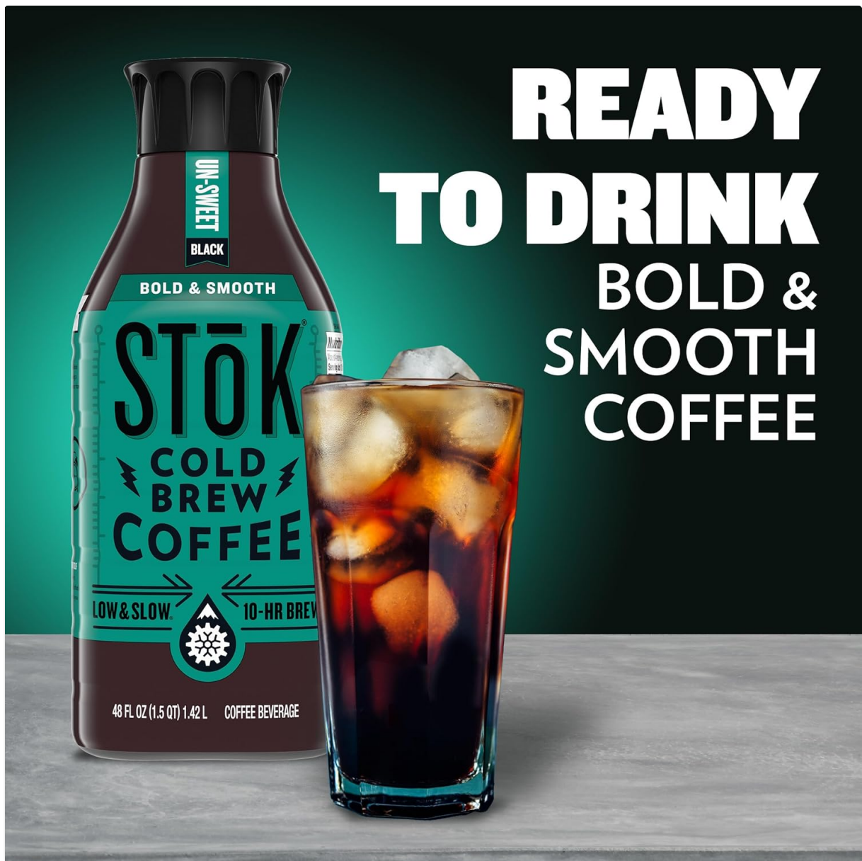
Image: A STōK Cold Brew Coffee bottle positioned next to a tall glass filled with ice and poured cold brew, illustrating its ready-to-drink nature.