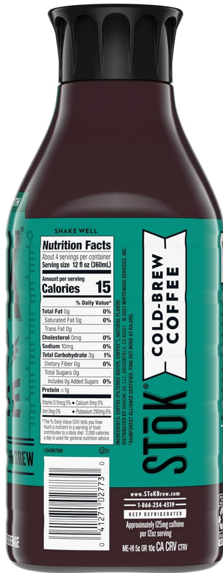
Image: Rear view of the STOK Cold Brew Coffee bottle, showing the nutrition facts label and indicating "Shake well. Keep refrigerated."