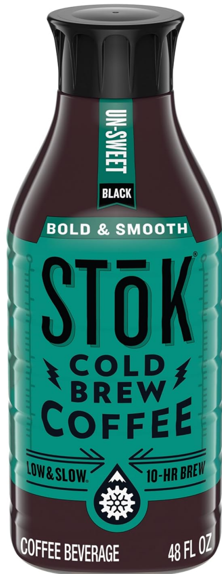
Image: Front view of the STōK Cold Brew Coffee 48 FL OZ bottle, highlighting its "Un-Sweet Black" and "Bold & Smooth" characteristics.