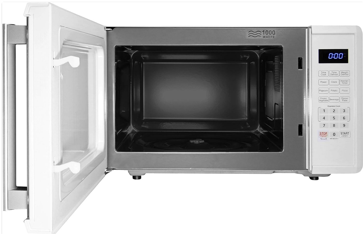
Figure 2: The microwave oven with its door open, revealing the spacious 1.1 cubic feet cooking cavity and the removable glass turntable.