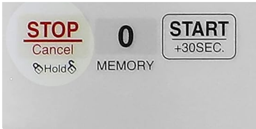
Figure 3: Detailed view of the control panel, highlighting the LED display and button layout for various cooking functions.

The control panel features a digital LED display and various buttons for setting cooking times, power levels, and special functions: