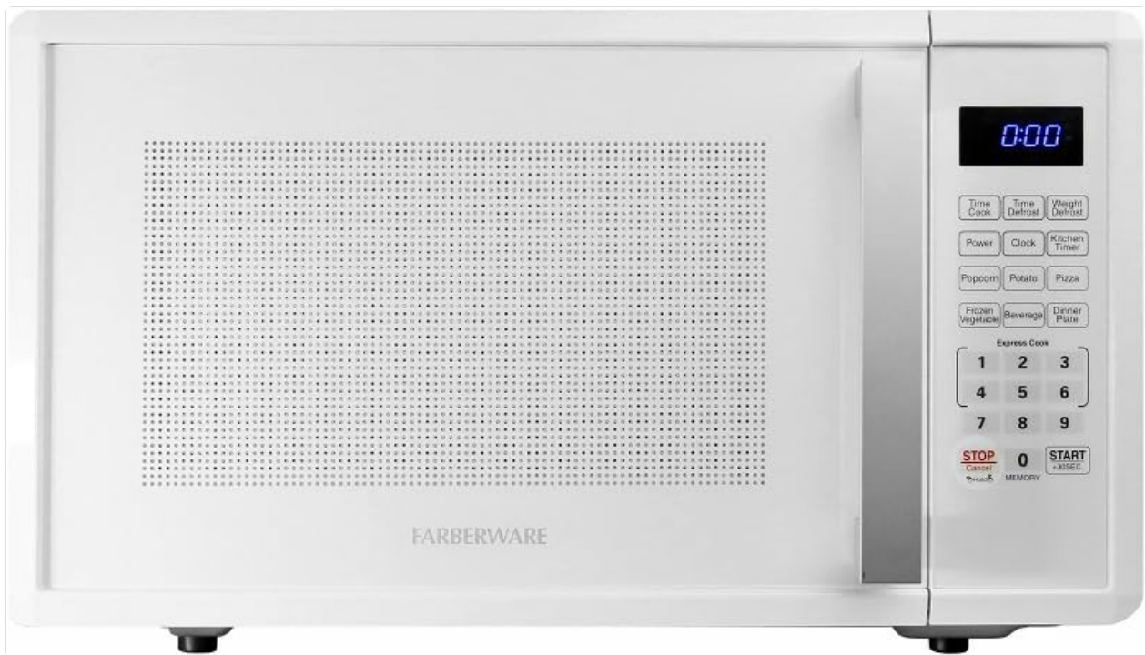
Figure 1: Front view of the Farberware 1000-Watt Microwave Oven, showcasing its white exterior and digital control panel.