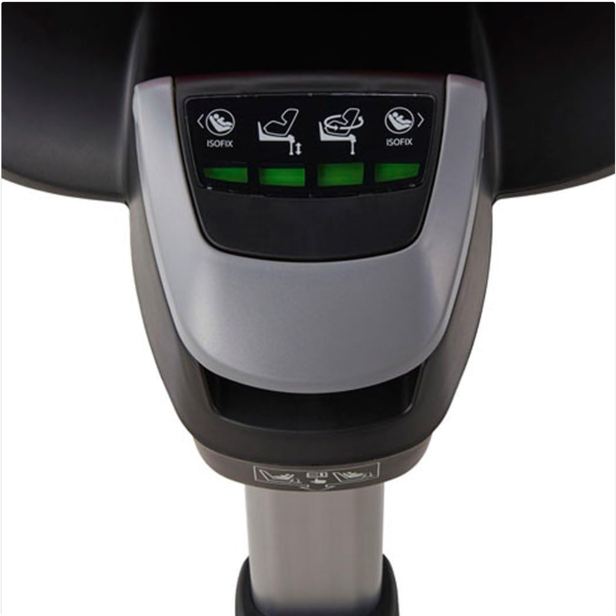
Figure 3.1: ISOFIX installation indicator.