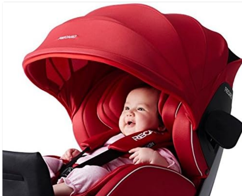
Figure 4.2: Child in seat with sunshade.