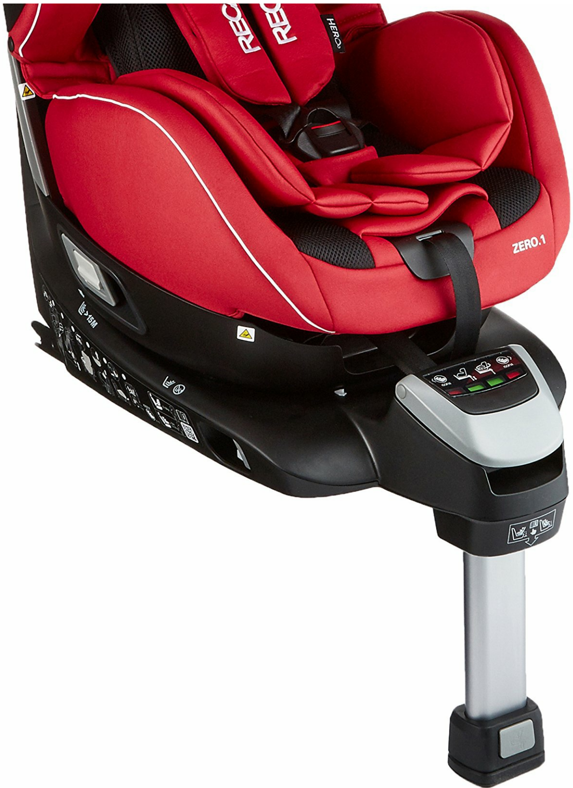
Figure 1.1: Front view of the Recaro Zero.1 Select Coral Red child car seat.