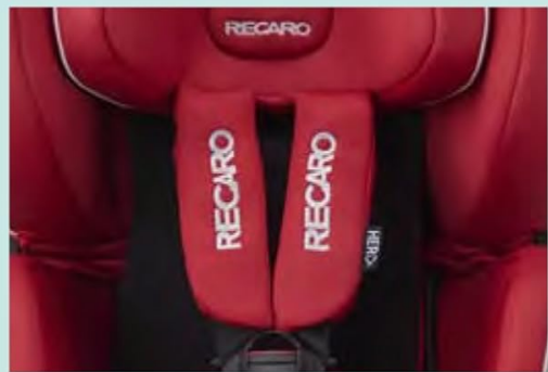
Figure 2.1: Illustration of key safety features.

ヘッドサポート一体型の肩パッドが、ベルトのねじれを抑制。肩から胸までのグリップパッドと合わせ、赤ちゃんの体をしっかりホールドします。