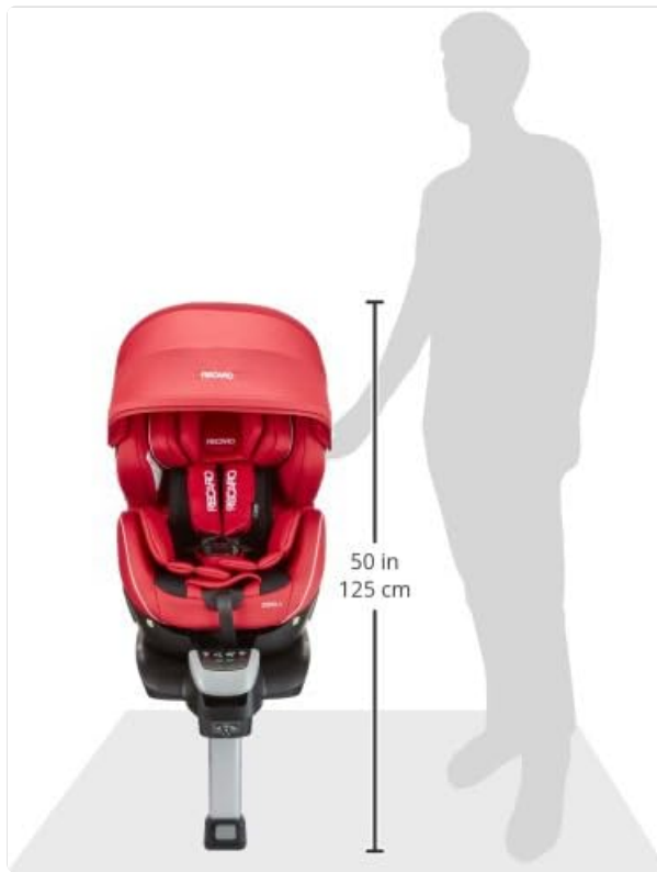
Figure 9.1: Product size comparison.