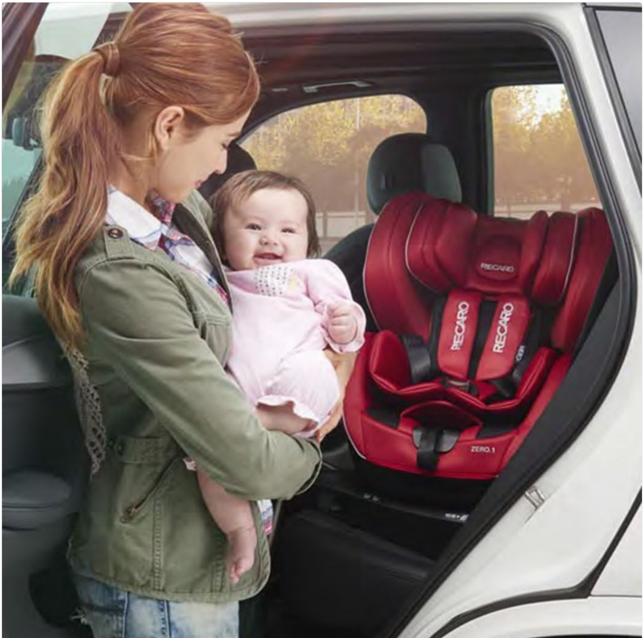
Figure 5.1: Installing the child car seat.

The car seat is designed for forward-facing installation. No assembly is required for the main unit.