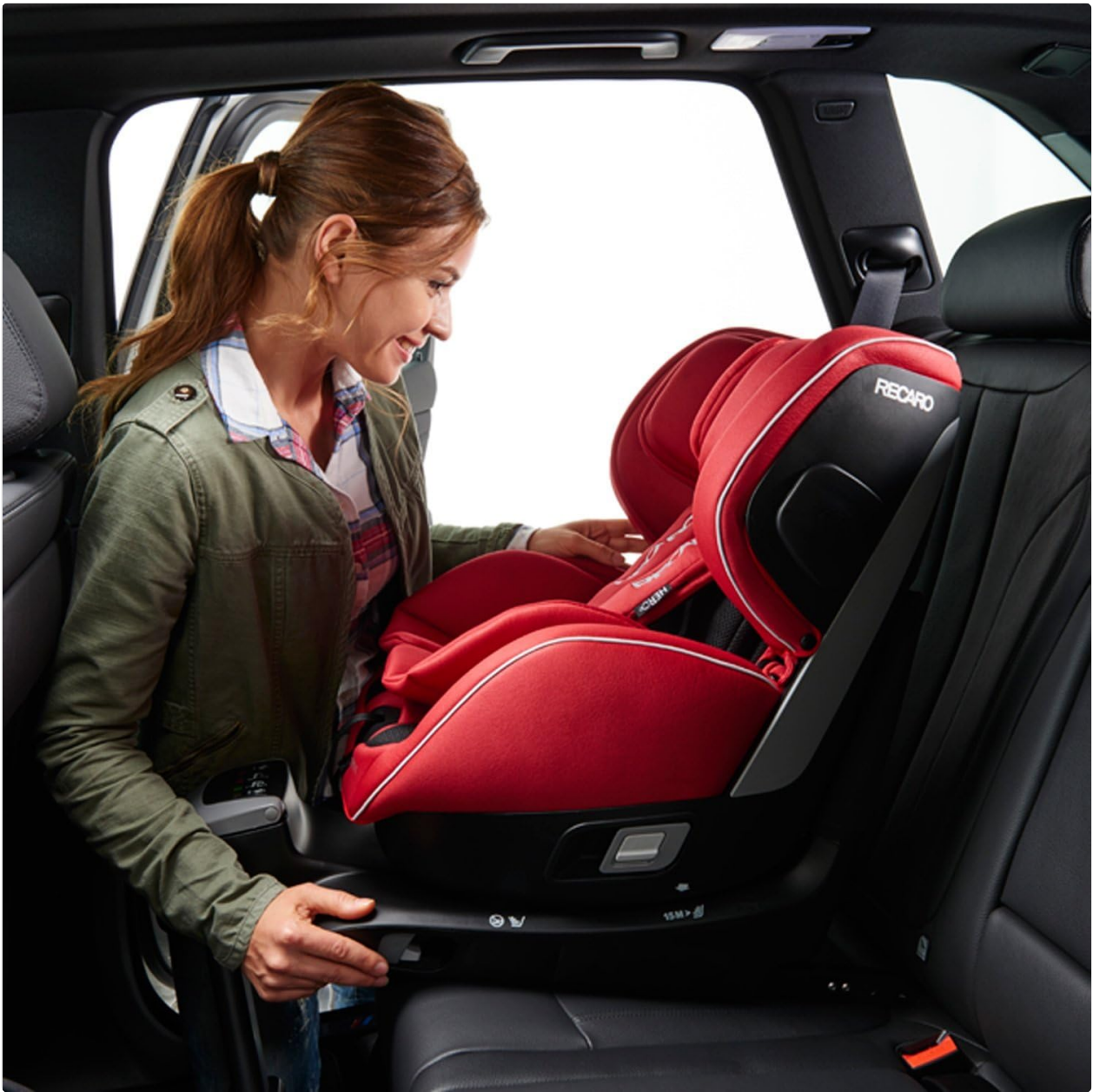
Figure 3.2: Demonstrating seat rotation.