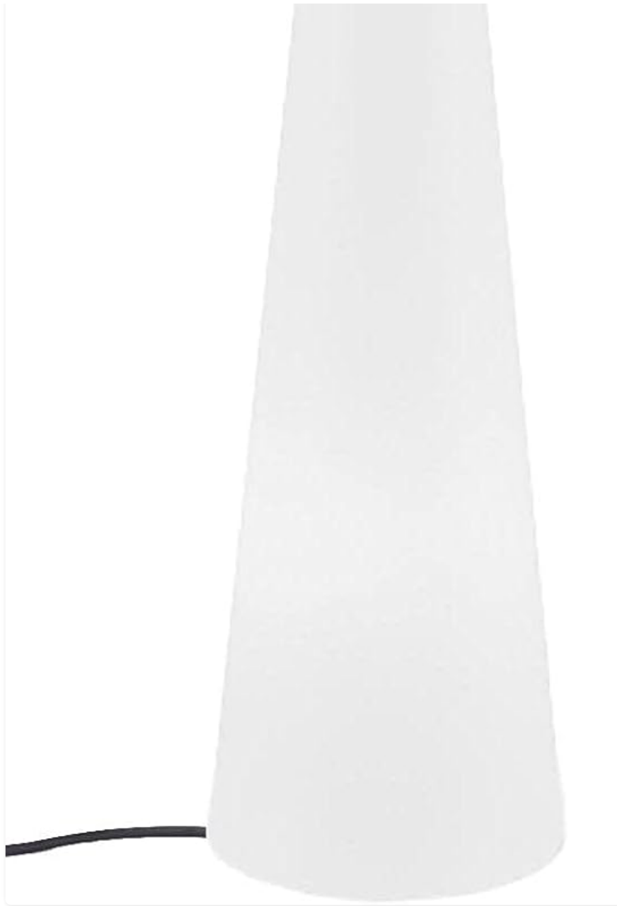
Image: The LOLA Outdoor Floor Lamp, showcasing its elegant white design and tall, conical base with a classic lampshade top.