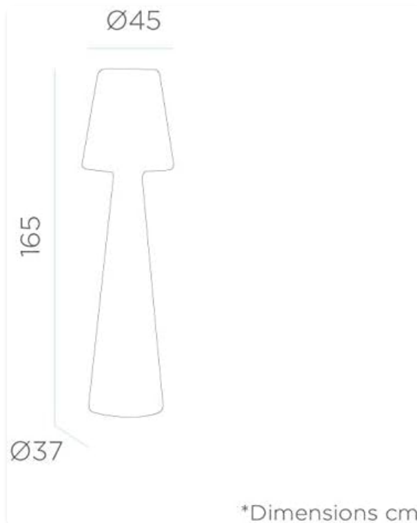
Image: Technical diagram showing the dimensions of the LOLA Outdoor Floor Lamp (Height 165cm, Diameter 45cm at top, 37cm at base).