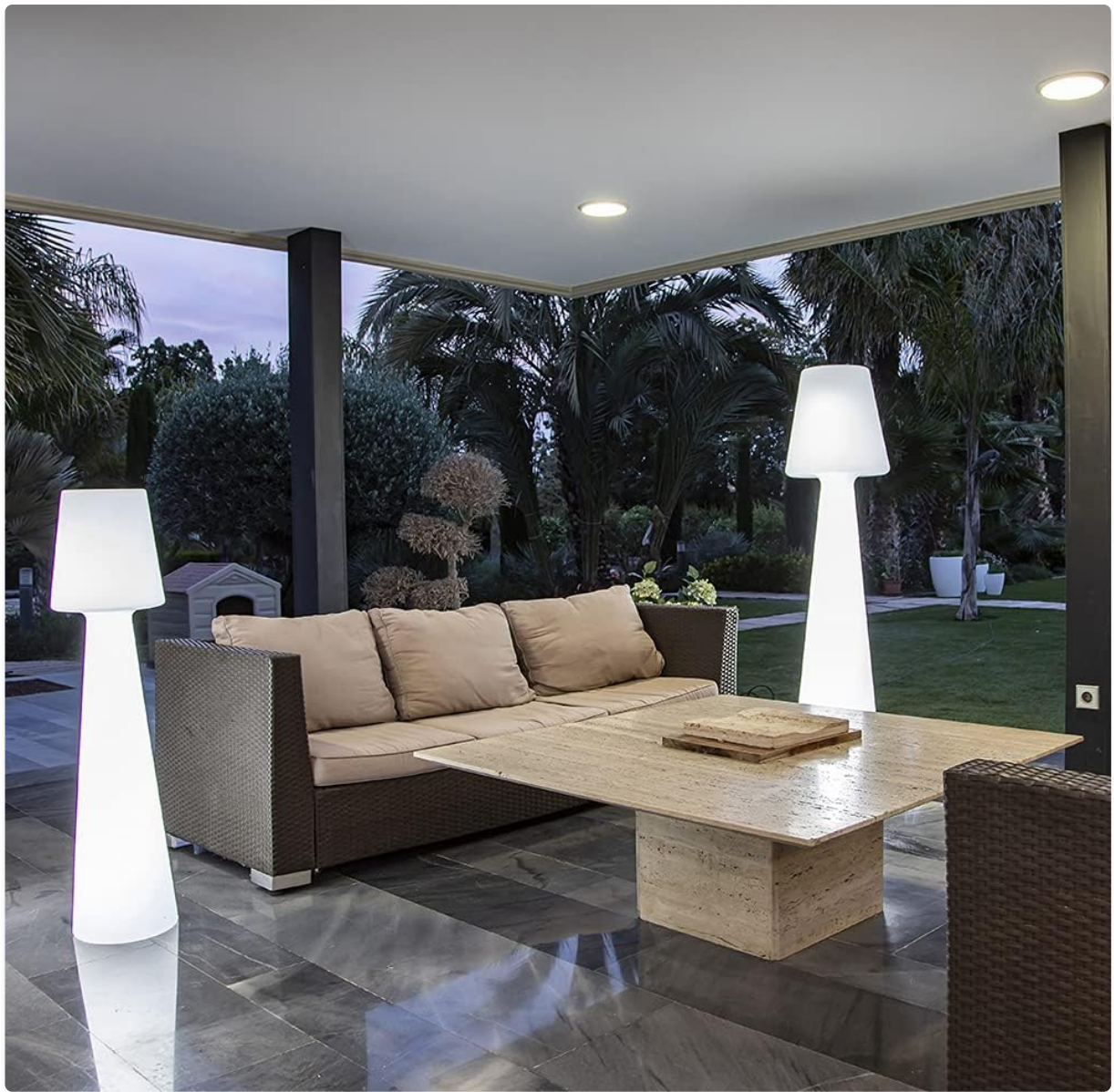
Image: The LOLA lamp positioned on an outdoor patio, demonstrating its suitability for exterior spaces.