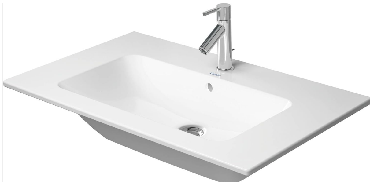
Image: Top-down view of the Duravit ME by Starck Sink, showcasing its rectangular basin, single faucet hole, and overflow. A chrome faucet is installed.

The Duravit ME by Starck Sink is a ceramic vanity sink designed for drop-in installation. It features a single rectangular basin with a faucet hole and an overflow. Its minimalist design integrates seamlessly into various bathroom aesthetics.