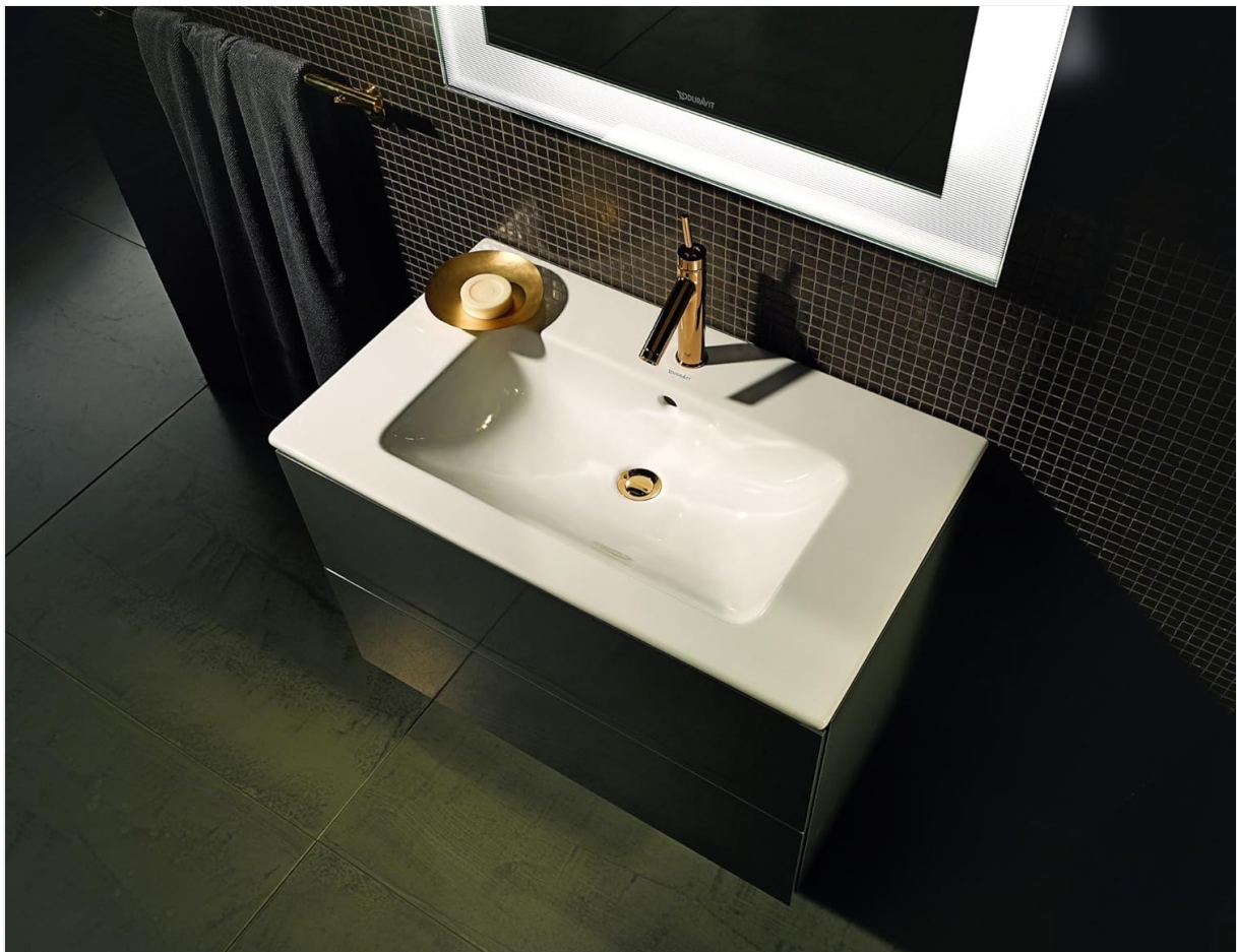
Image: The Duravit ME by Starck Sink integrated into a modern bathroom vanity, demonstrating its aesthetic appeal within a complete setup.