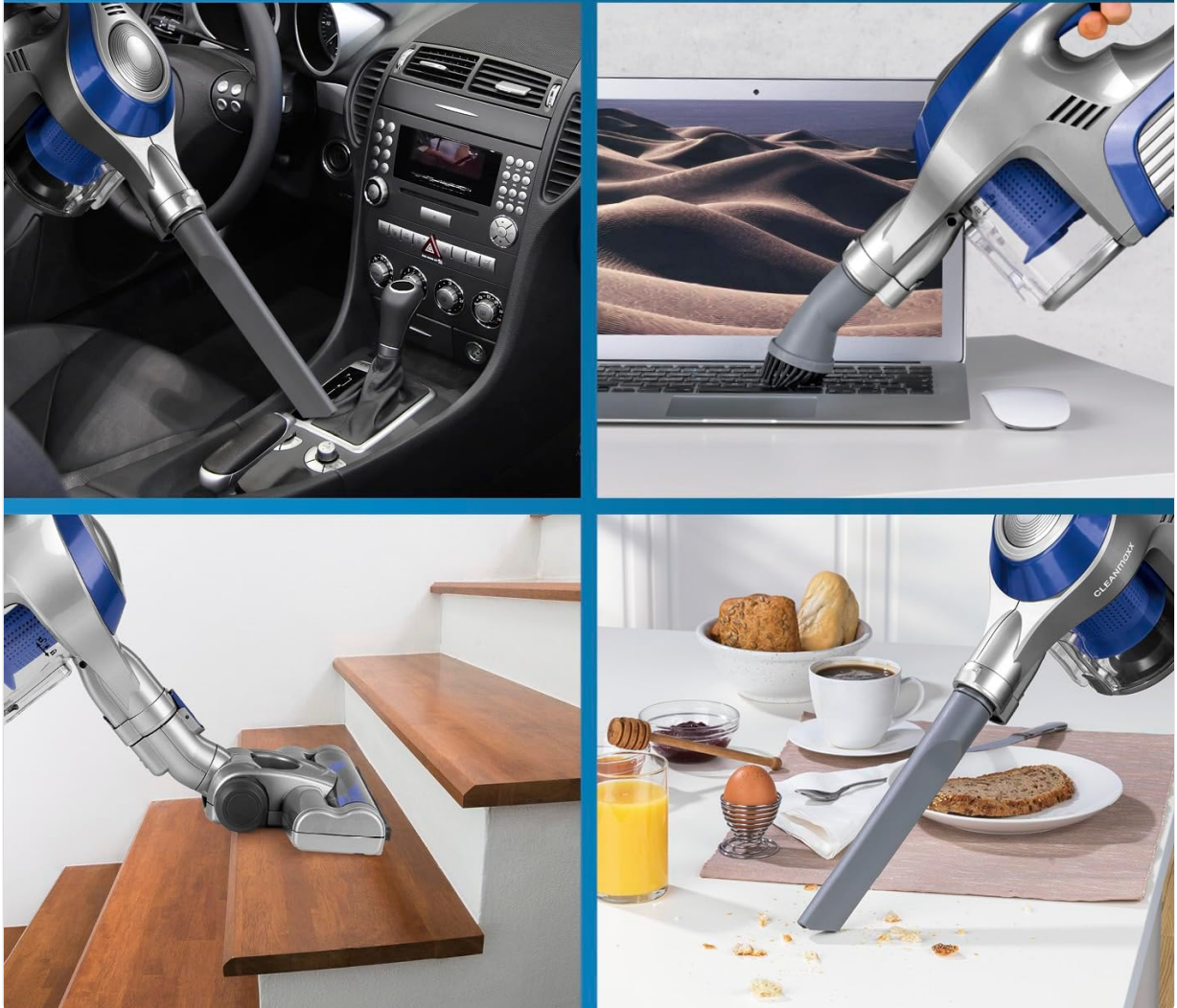
Image 5: The handheld vacuum effectively cleaning a car interior and a computer keyboard.