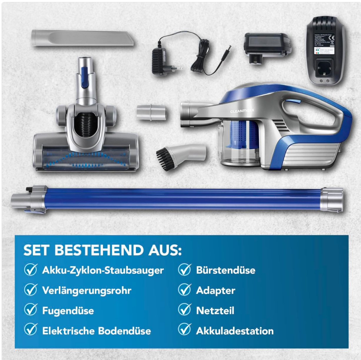
Image 2: All included accessories and main components of the CLEANmaxx vacuum cleaner.