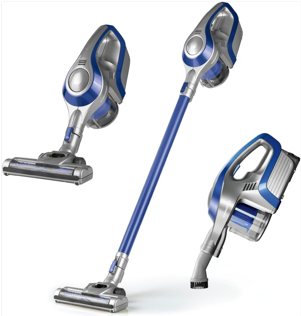
Image 1: The CLEANmaxx vacuum cleaner shown in its full stick configuration and as a handheld unit.