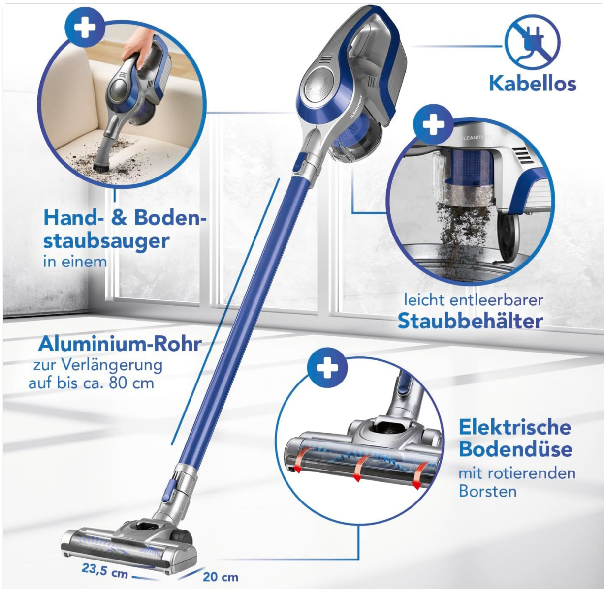
Image 7: The vacuum in both handheld and stick modes, illustrating the easily detachable and emptyable dust container.