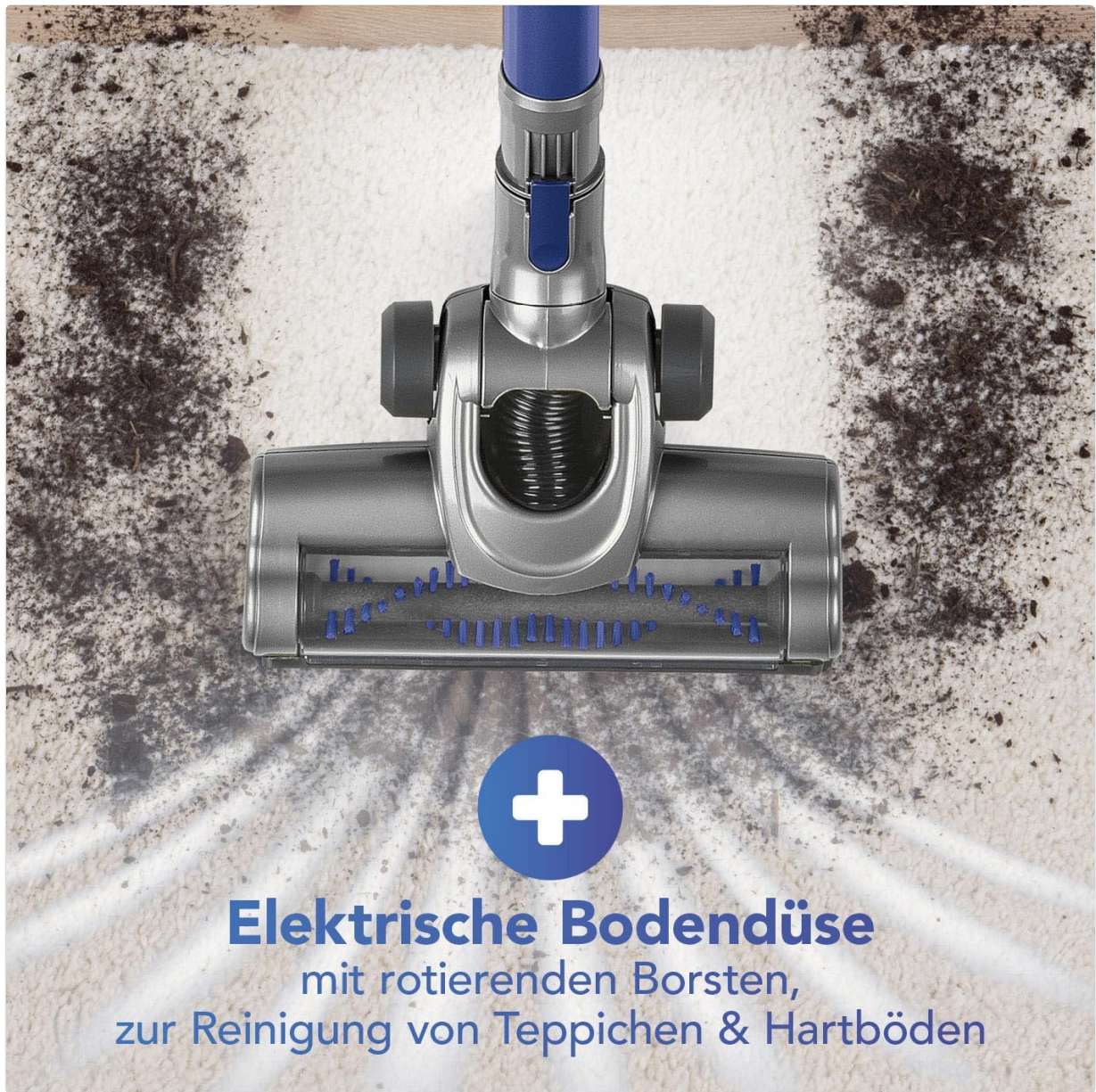
Image 6: The Power Rotation Floor Nozzle demonstrating its cleaning capability on a carpet.