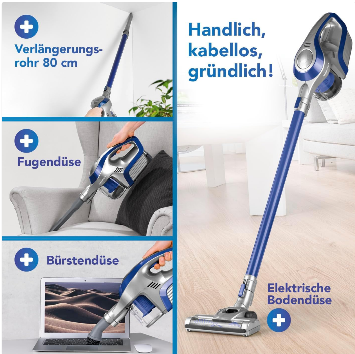
Image 3: Demonstrates the use of the extension tube, crevice tool, and dusting brush for various cleaning tasks.