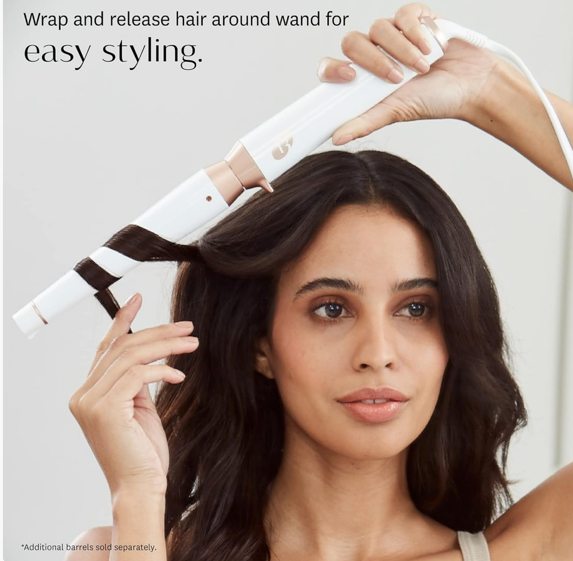
Image: A user demonstrating the technique of wrapping a section of hair around the curling wand for styling.

Wrap and release hair around wand for easy styling.