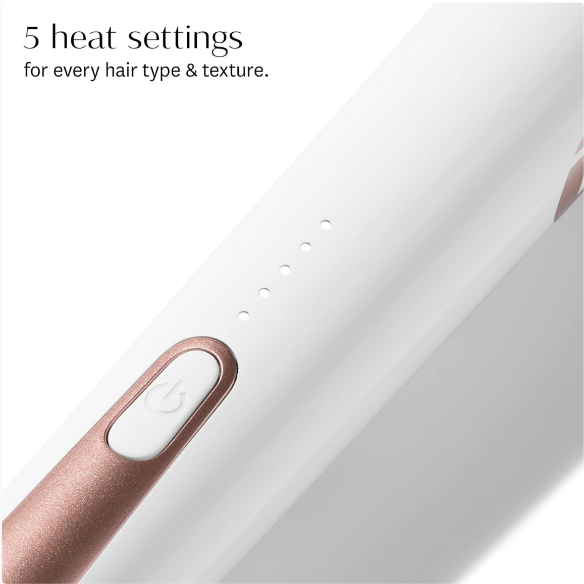
Image: A detailed view of the curling iron's handle, highlighting the power button and the five distinct heat settings.

5 heat settings for every hair type & texture.