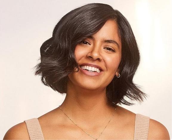
Image: Examples of undone, tousled, and loose waves on dark hair, achieved with different T3 barrels.