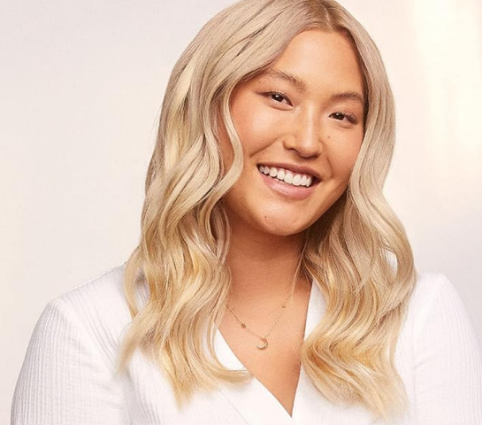
Image: Examples of undone, tousled, and loose waves on blonde hair, achieved with different T3 barrels.

Your browser does not support the video tag.