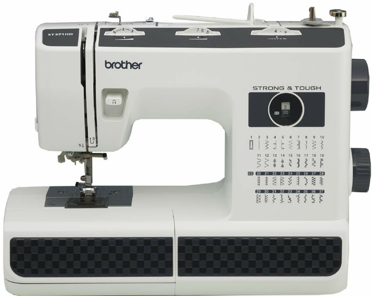
Figure 1: Overview of the Brother ST371HD Sewing Machine.