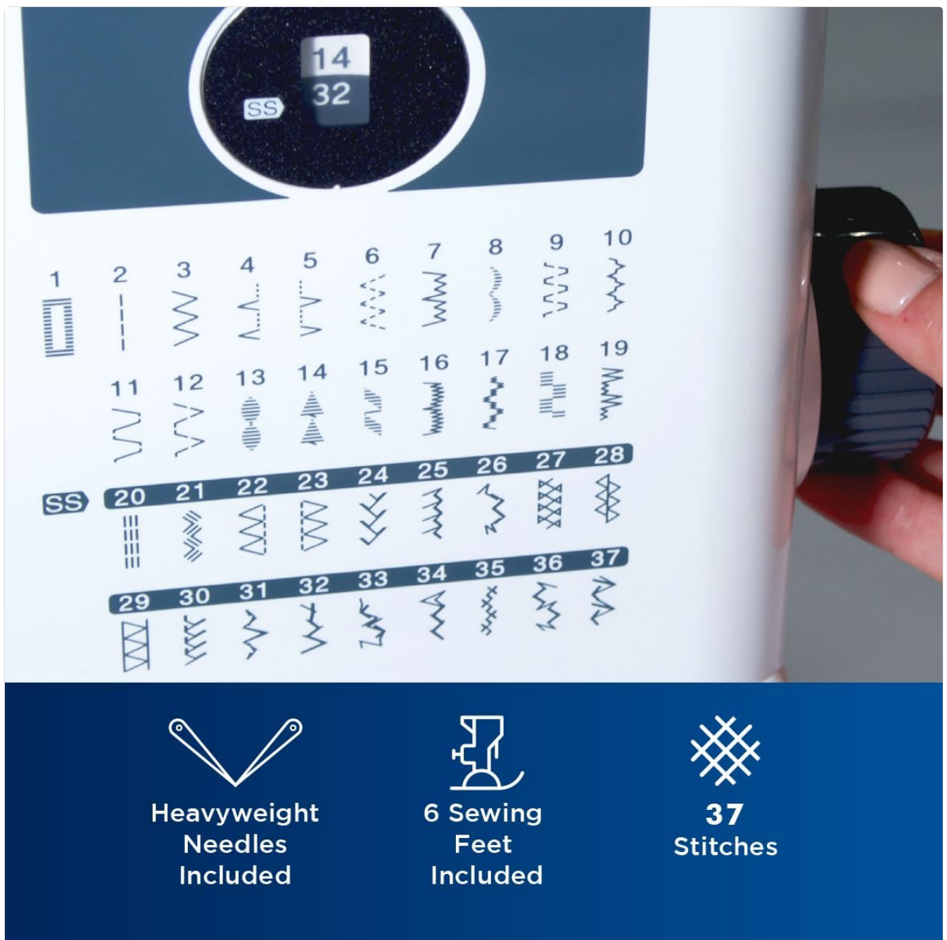
Figure 5: Hand adjusting the stitch selection dial.