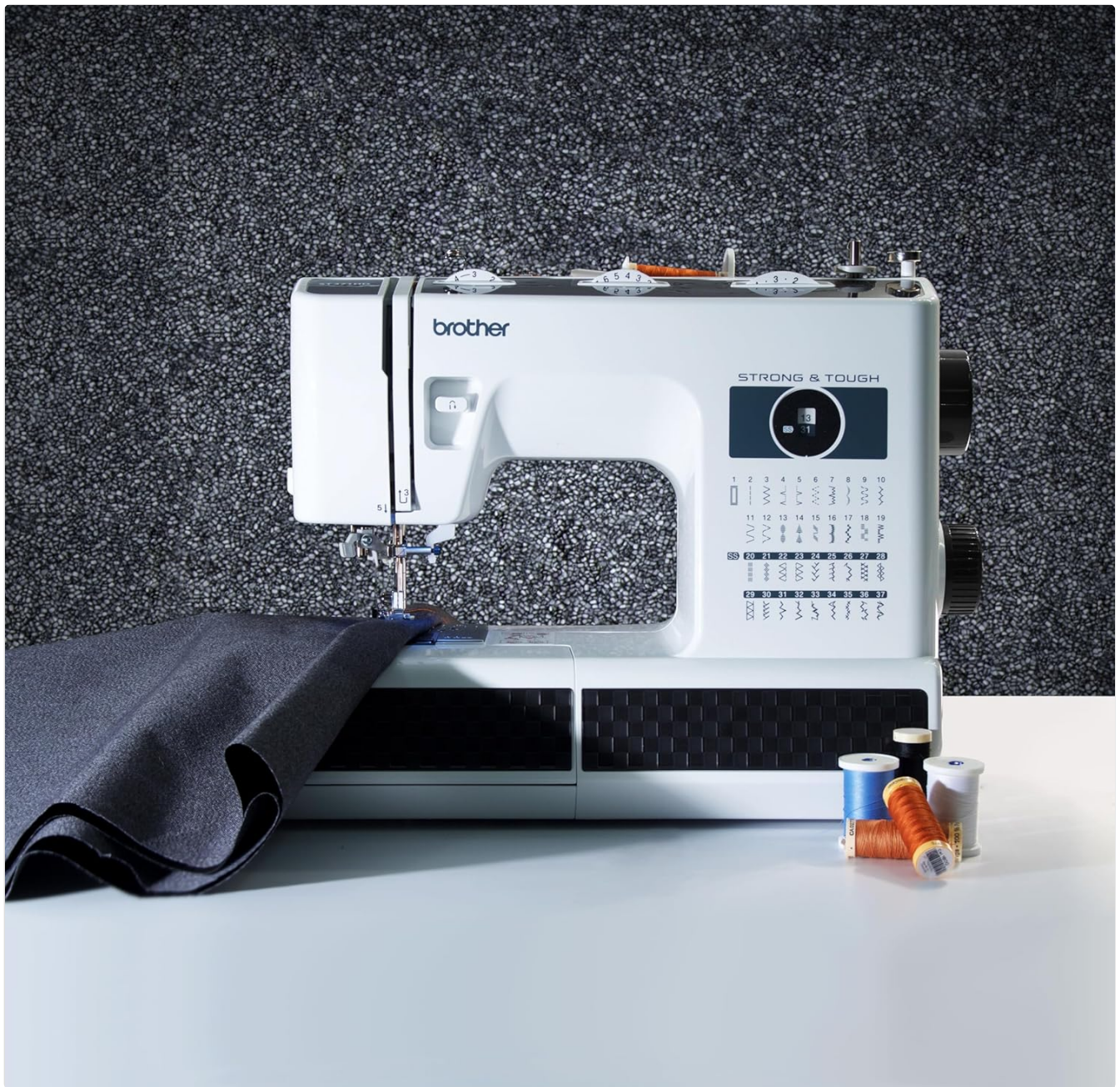
Figure 6: The Brother ST371HD sewing machine ready to tackle various fabrics.

Your browser does not support the video tag.