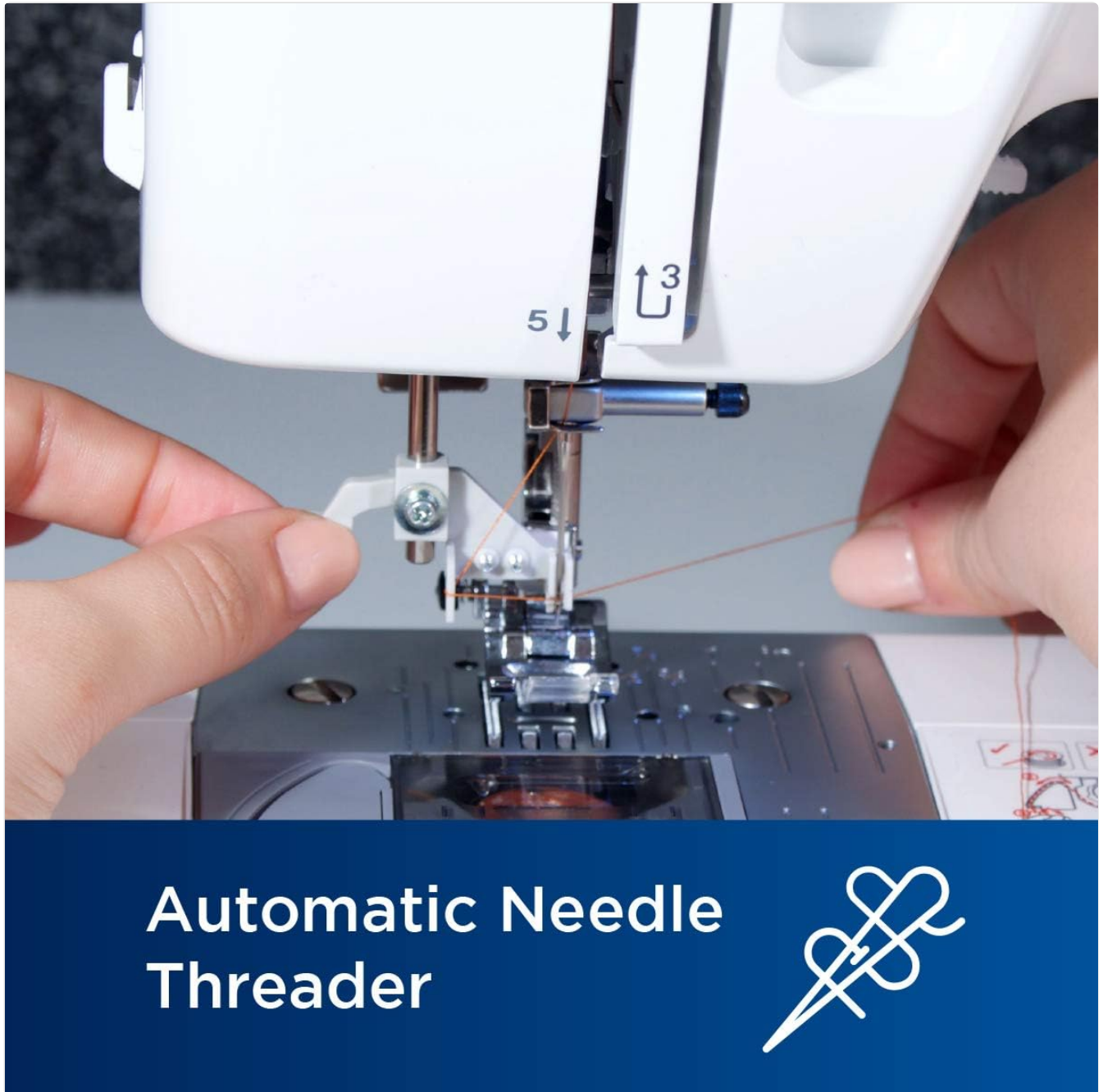
Figure 2: Close-up of the automatic needle threader in action.