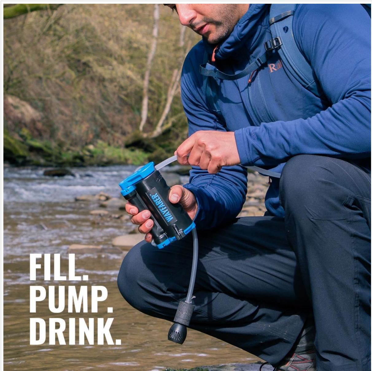
A person kneeling by a stream, using the LifeSaver Wayfarer to pump water into a bottle, demonstrating outdoor use.