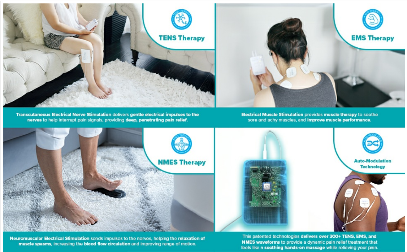
Figure 5: Key Features of the Pain Therapy System.

This diagram illustrates the core features of the device, including its three therapy modes, auto shut-off timer, drug-free nature, patented AMP technology, total body therapy capability, and portability.