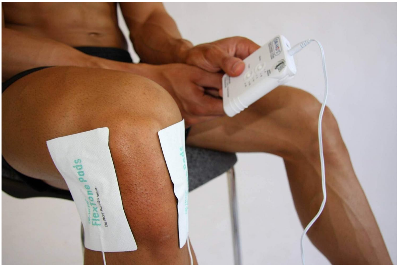
Figure 8: Pad placement examples.

These images demonstrate typical placement of the DR-HO'S electrode pads on the neck, shoulders, and knee for effective pain relief.