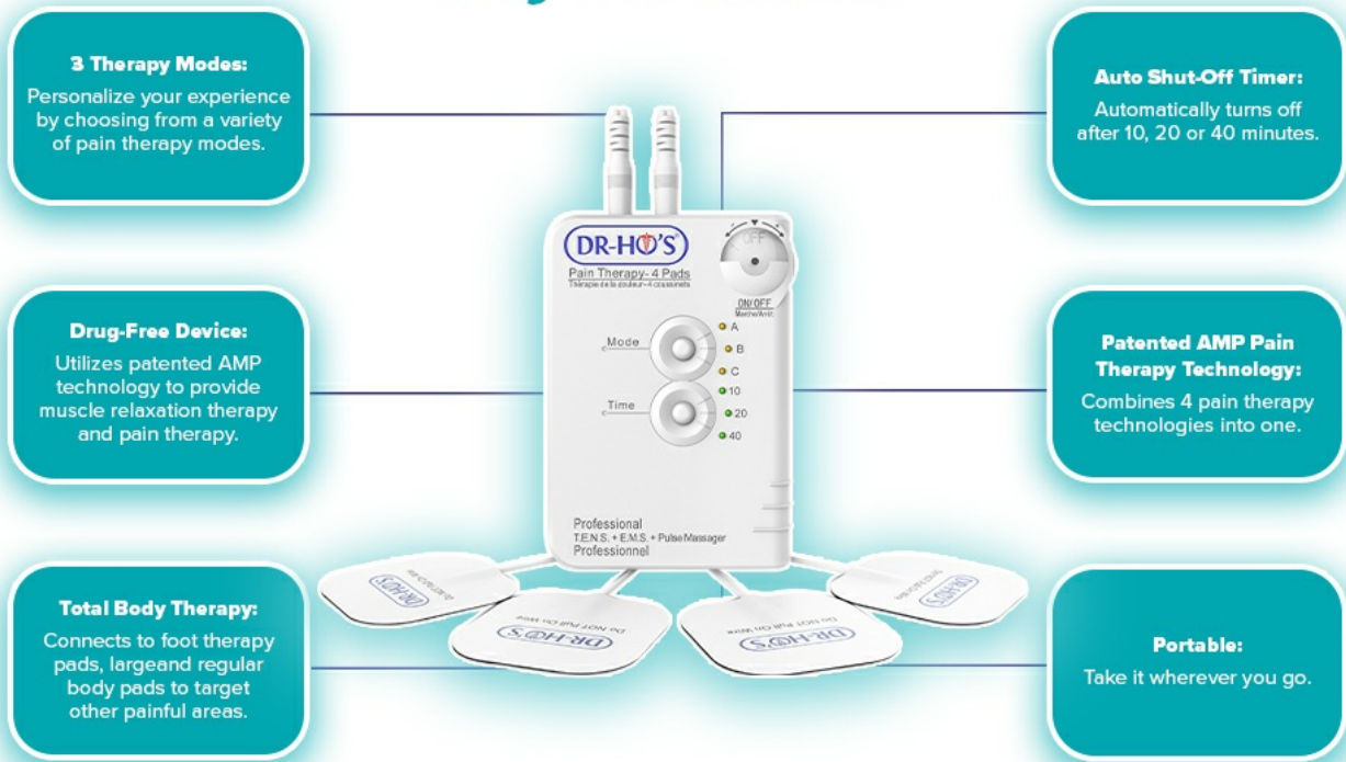
Figure 6: Detailed explanation of TENS, EMS, NMES, and Auto-Modulation Technology.

This image provides a visual breakdown of how TENS, EMS, NMES, and Auto-Modulation technologies work within the DR-HO'S system to provide pain relief and muscle stimulation.