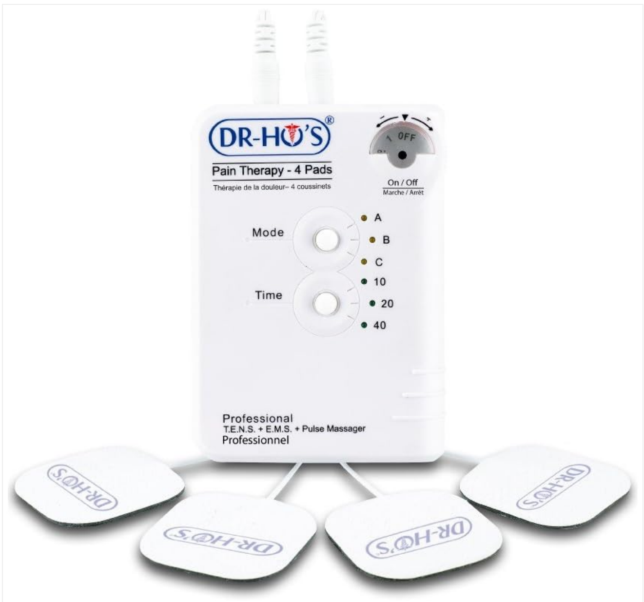
Figure 2: Overview of the DR-HO'S Pain Therapy System and its accessories.

This image provides a visual representation of all components included in the DR-HO'S Pain Therapy System Deluxe Package, such as the main unit, various electrode pads, and carrying case.