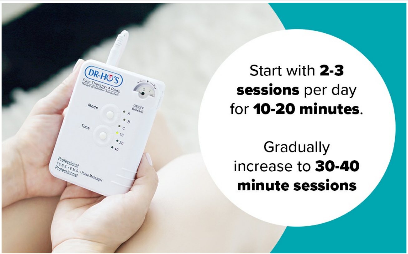
Figure 7: Recommended session durations.

This image advises users on starting with shorter sessions (10-20 minutes, 2-3 times daily) and gradually increasing to longer sessions (30-40 minutes) for optimal results.