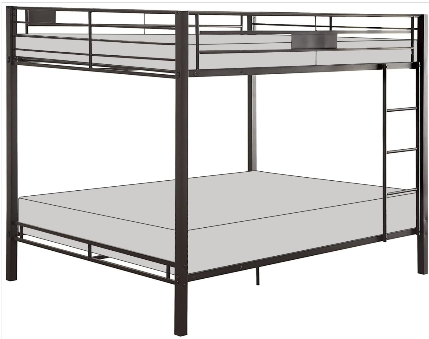
Image: The Acme Kaleb Metal Frame Queen Over Queen Bunk Bed, showcasing its sturdy metal construction and sandy black finish.

Thank you for choosing the Acme Kaleb Metal Frame Queen Over Queen Bunk Bed. This manual provides essential information for the safe assembly, operation, and maintenance of your new bunk bed. Please read all instructions carefully before beginning assembly and retain this manual for future reference.